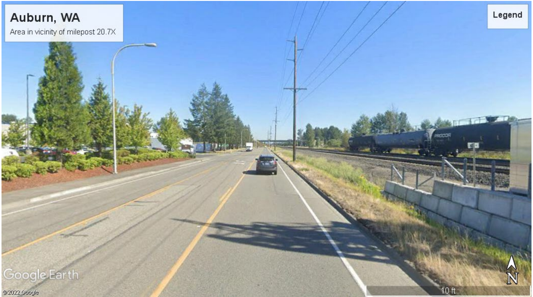
"C Street NW" on west side of tracks