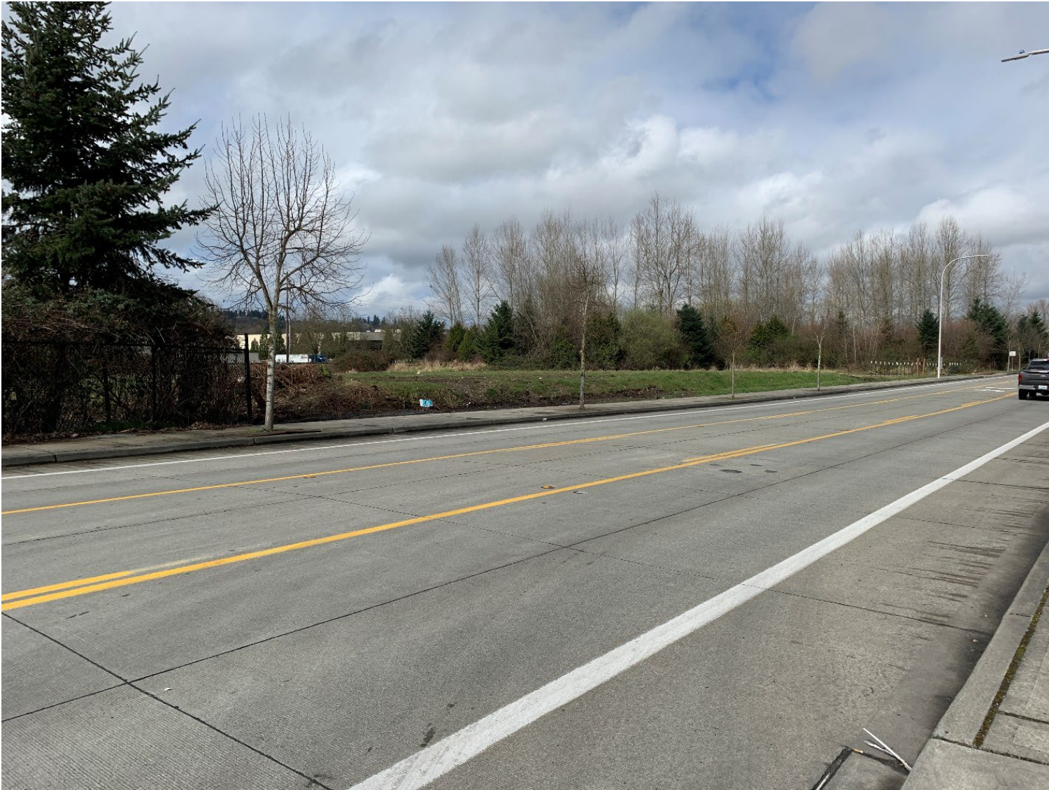
Auburn "B St. NW" open area to tracks at milepost 20.8X