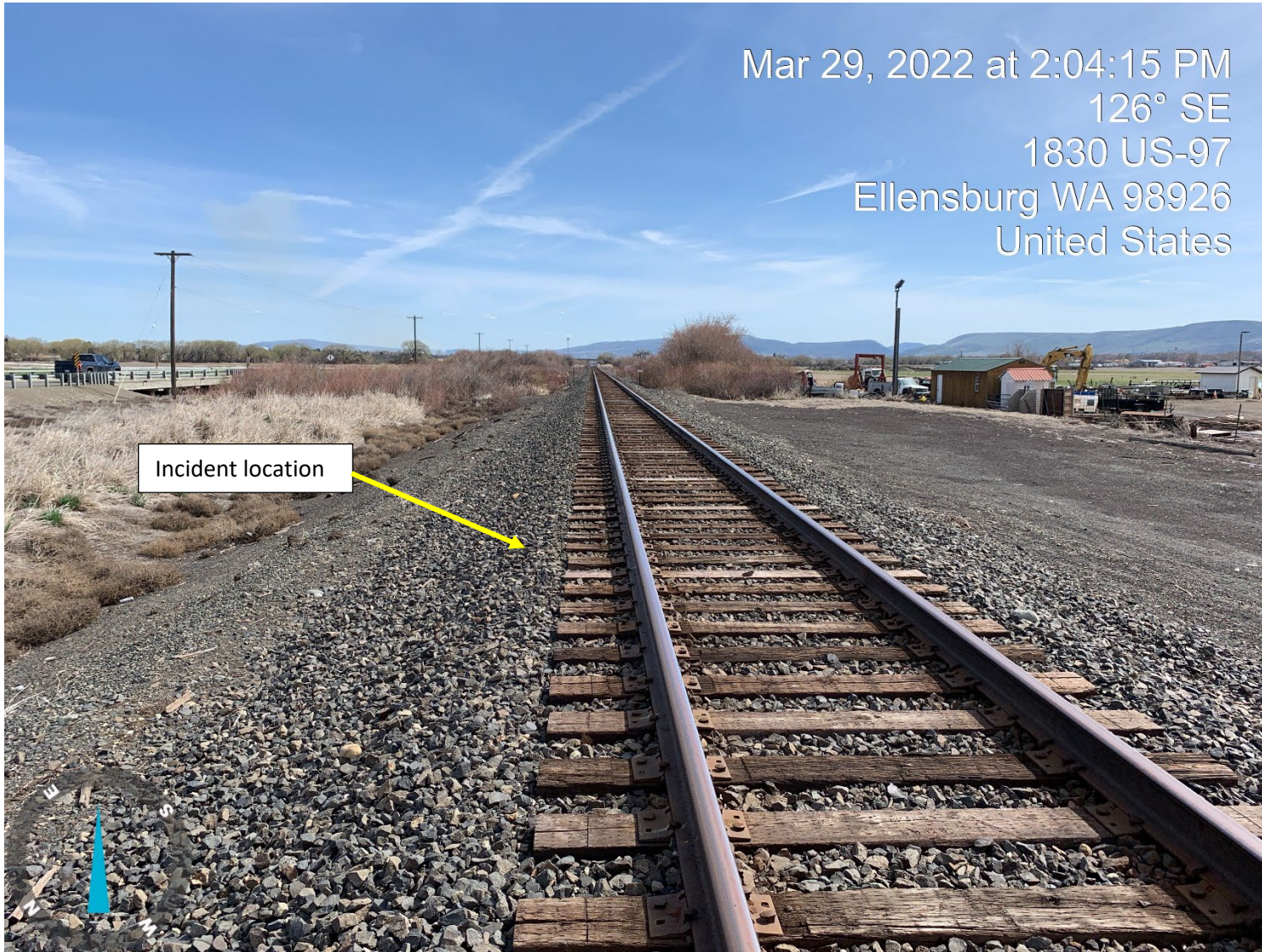
Milepost 2.5 looking East

Mar 29, 2022 at 2:04:15 PM 126° SE 1830 US-97 Ellensburg WA 98926 United States