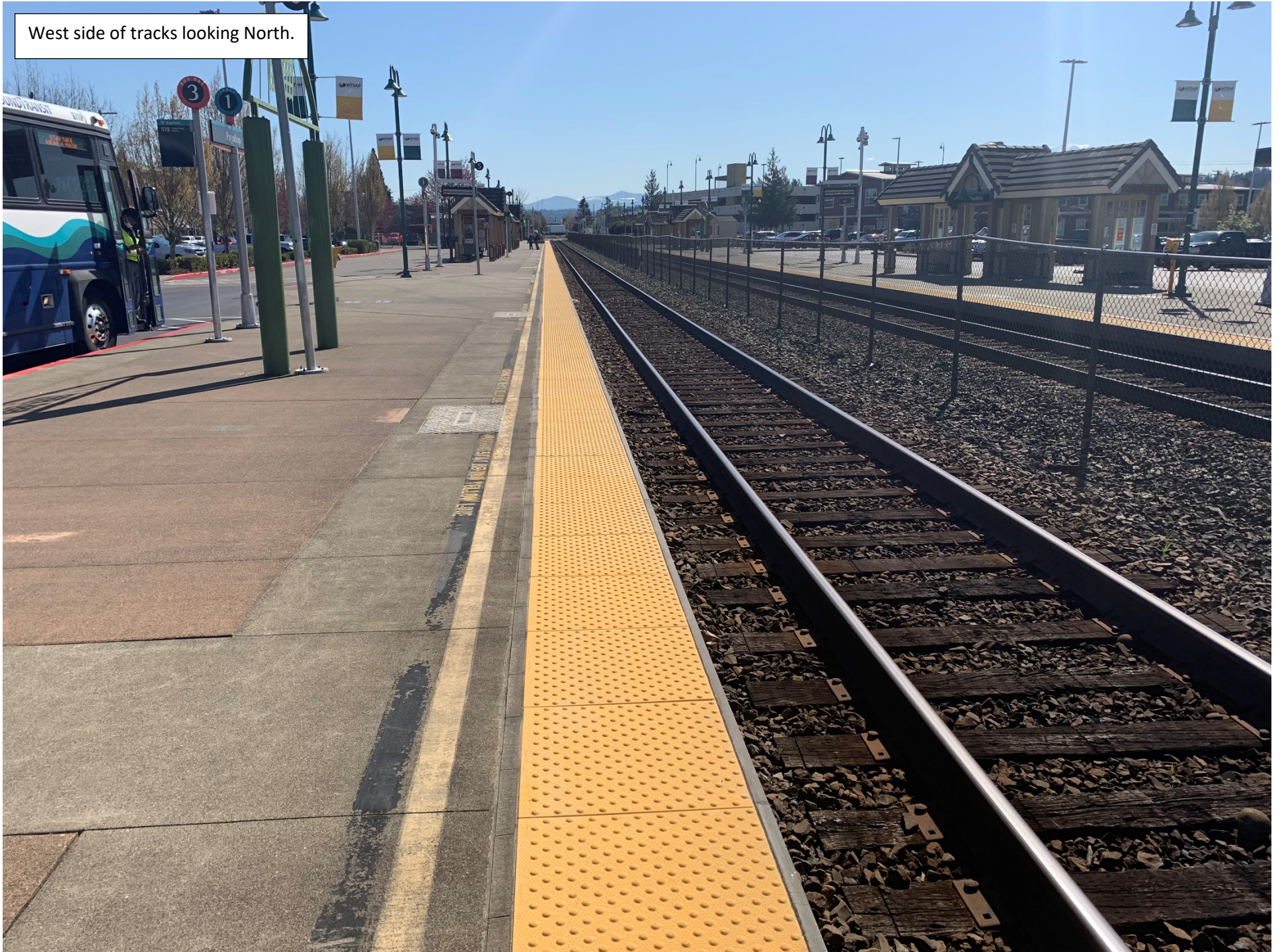
West side of tracks looking North.