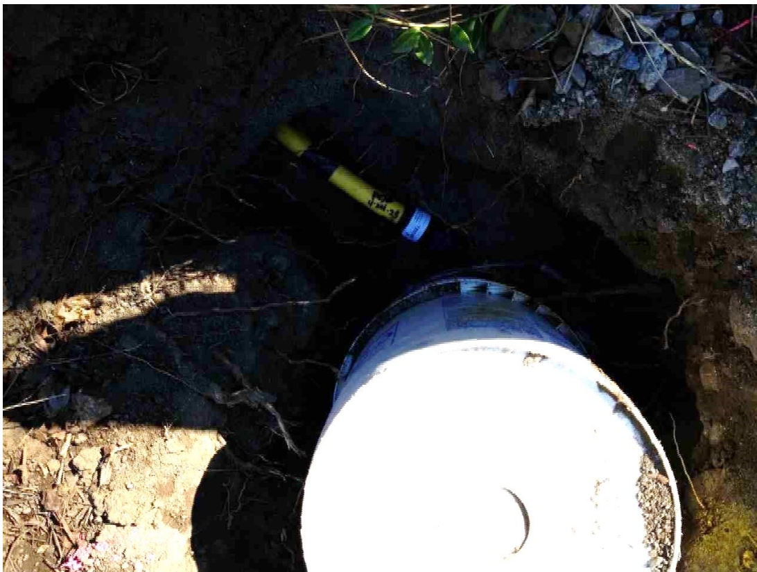
Exhibit #7 – Photo by locating technician showing repaired pipe in open post hole upon their arrival on 4/27.

Ticket: 20148862.0 Timestamp:4/27/2020 8:06:26 AM