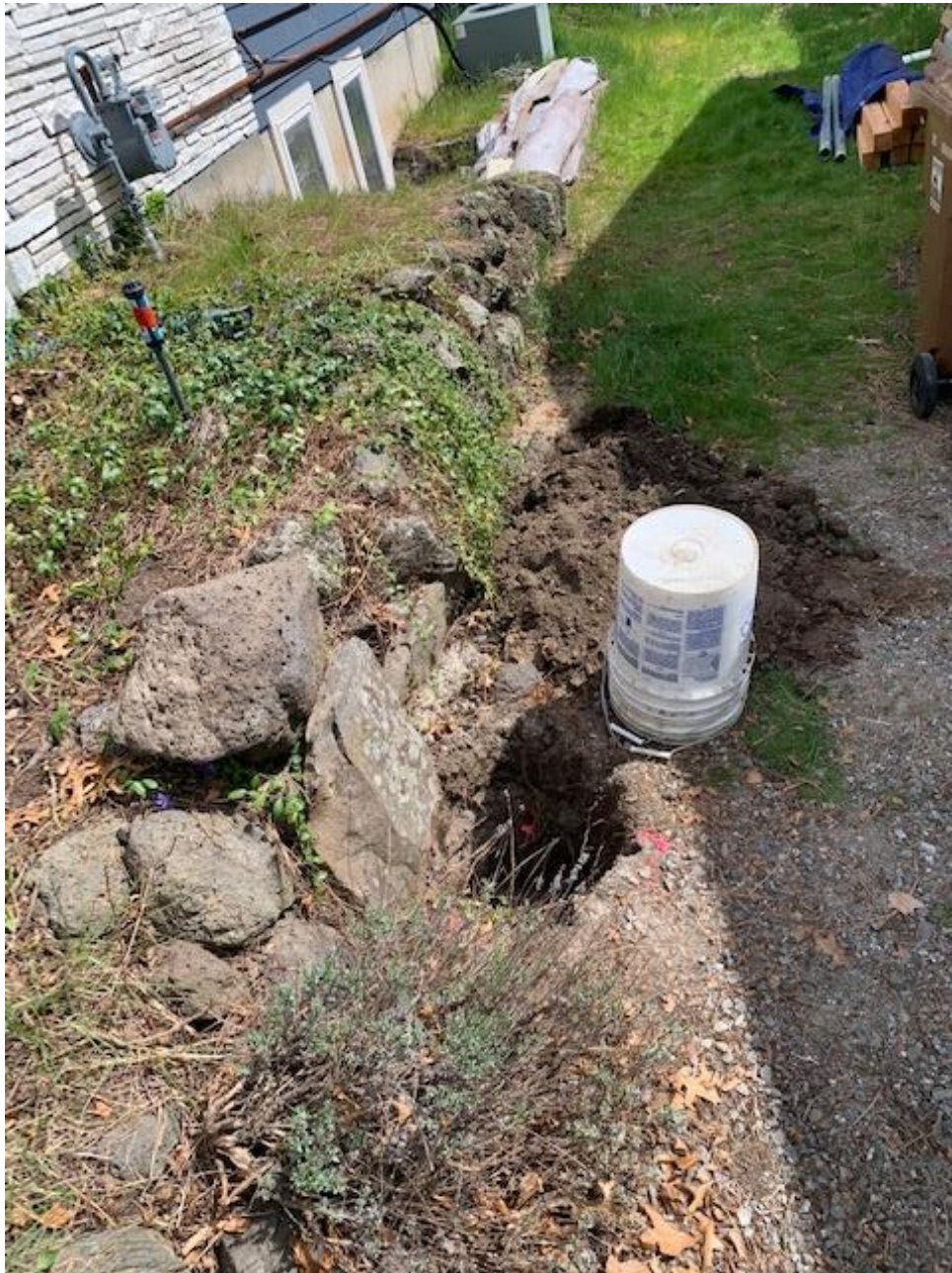
Exhibit #4 - Photo taken on 4/24 by Avista's serviceman showing the location of the damaged pipe and no evidence of locate marks.