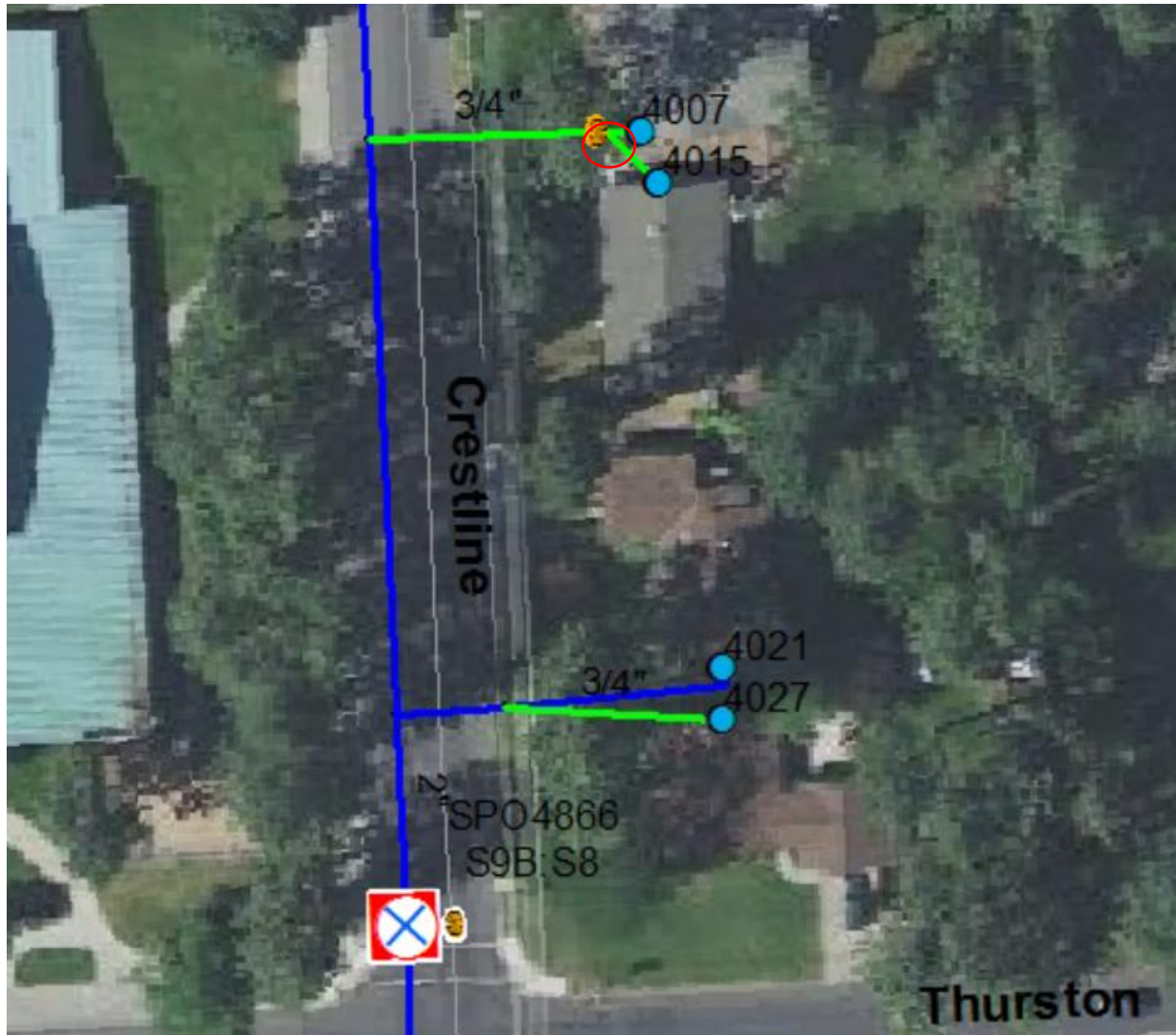
Exhibit #1 – Vicinity map showing location of damaged pipe in red circle. This 3/4" pipe is a split service that feeds both 4007 and 4015 S Crestline.