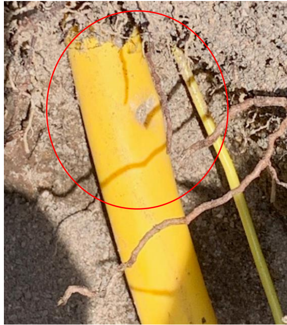
Exhibit #6 - Photos from locate technician when they arrived on 4/27/20. Shows damaged pipe location (bucket over pipe) when locate technician showed up to locate Avista's pipe for ticket 20148862.

Exhibit #5 - Photo shows gouge damage to the plastic pipe by digging bar, photo taken by Avista serviceman on 4/24.