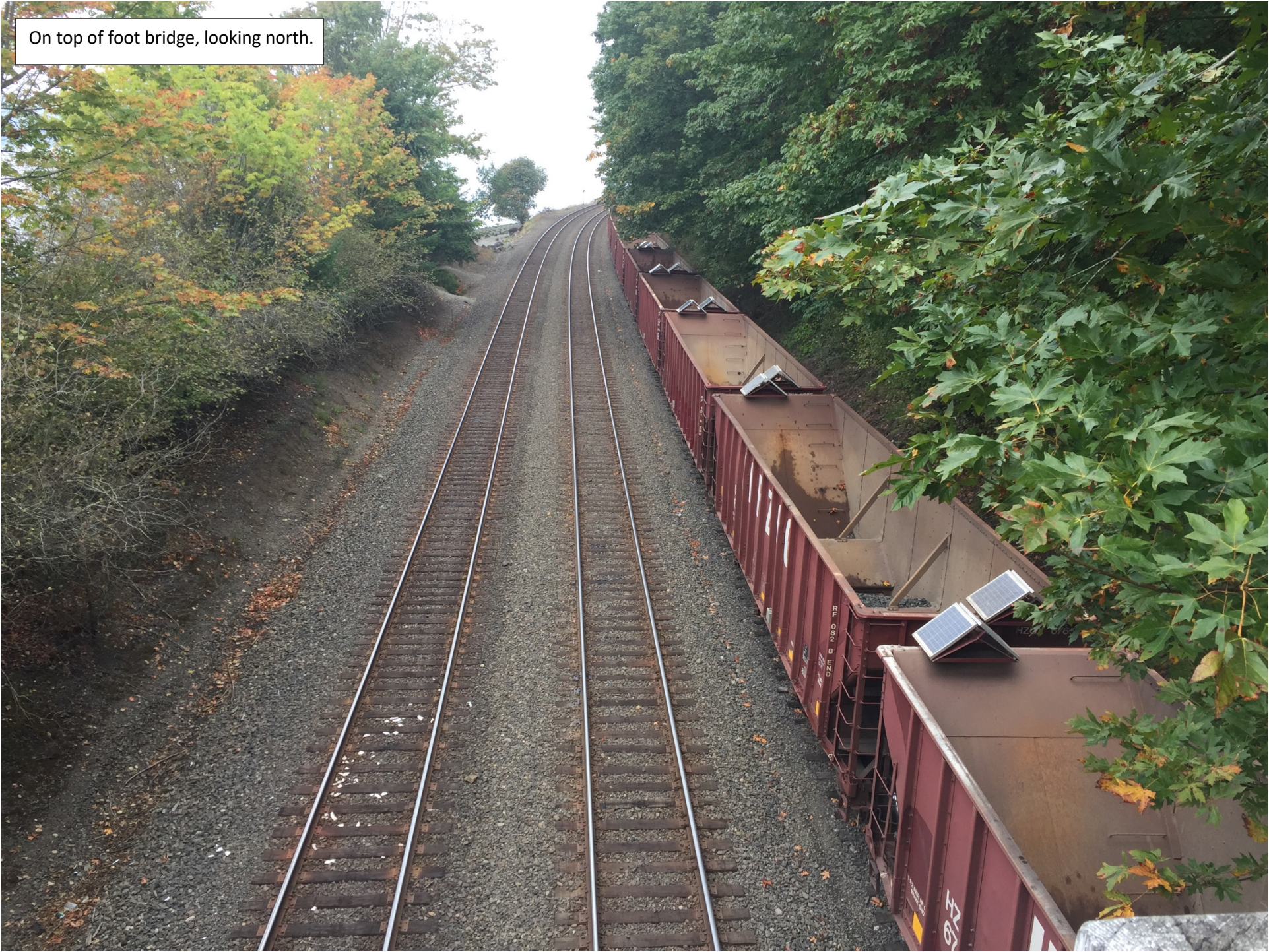
On top of foot bridge, looking north.