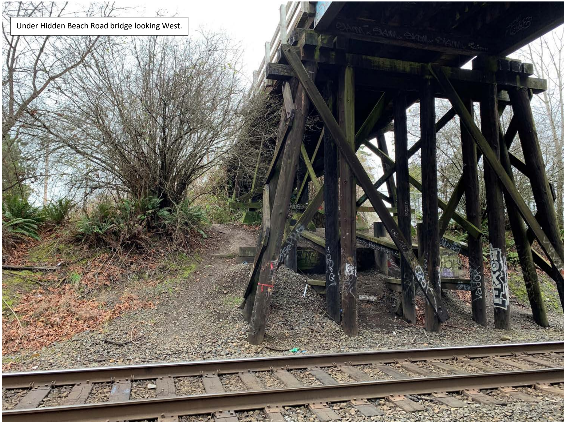
Under Hidden Beach Road bridge looking West.