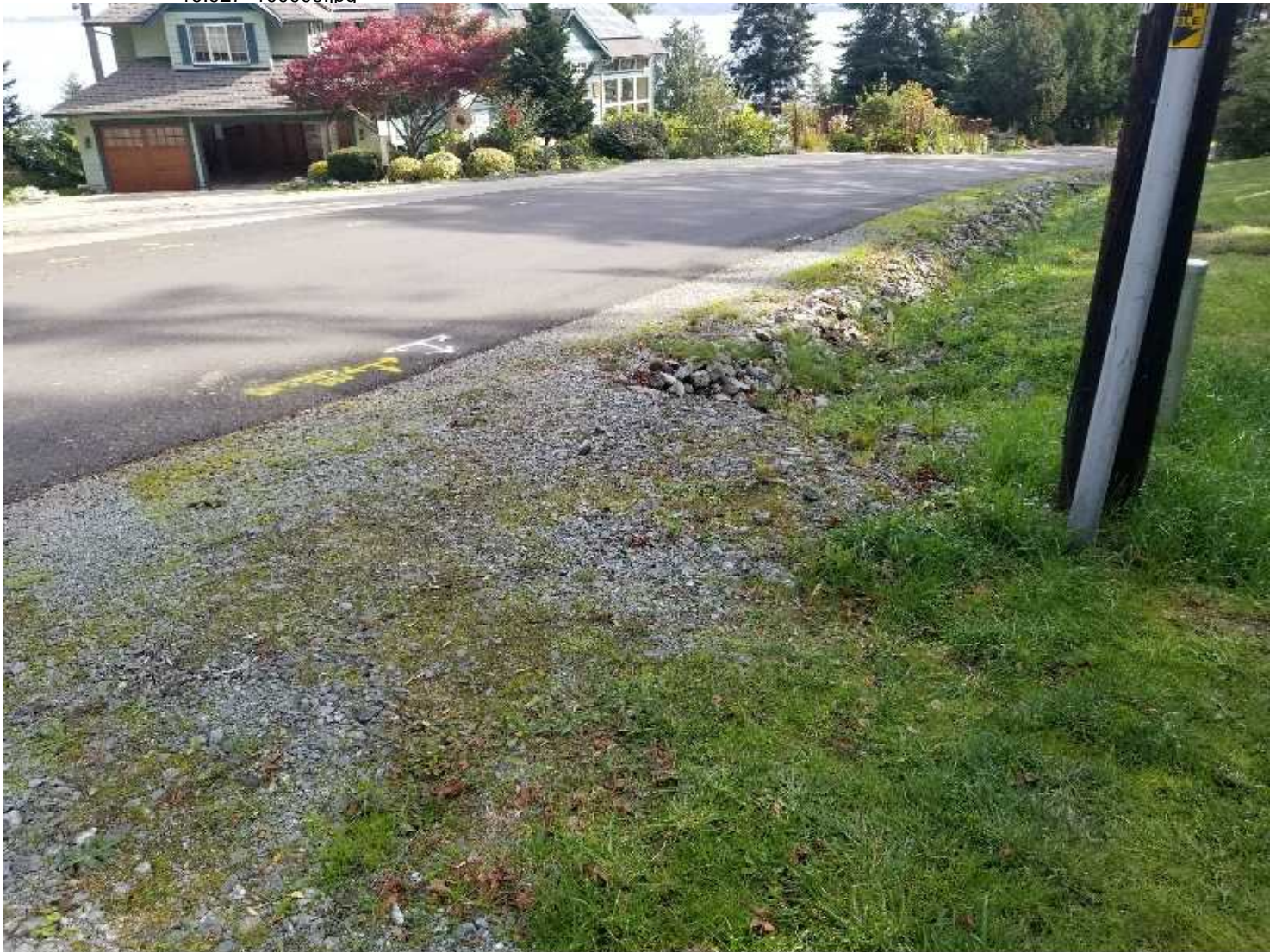
Property of United States Infrastructure Corporation Photo created on 10/02/2019 10:30:37 AM PDT