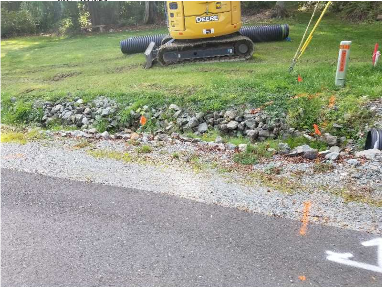
Photo created on 10/02/2019 10:52:35 AM PDT