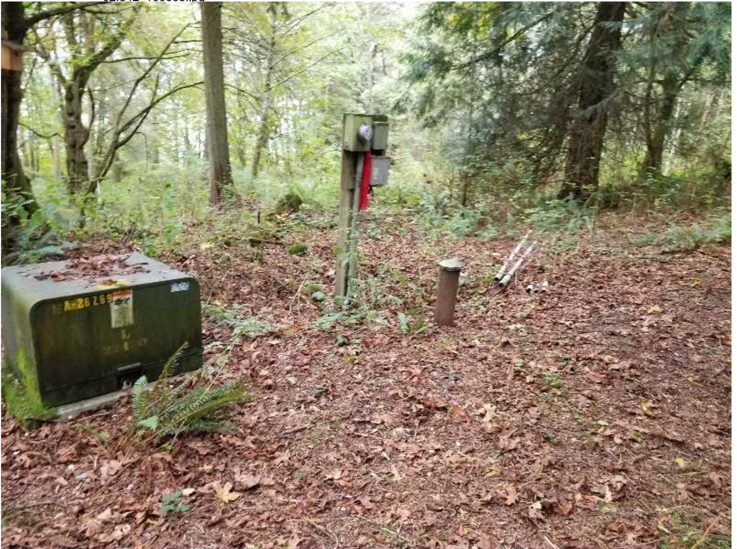
Property of United States Infrastructure Corporation Photo created on 10/03/2019 09:29:45 AM PDT