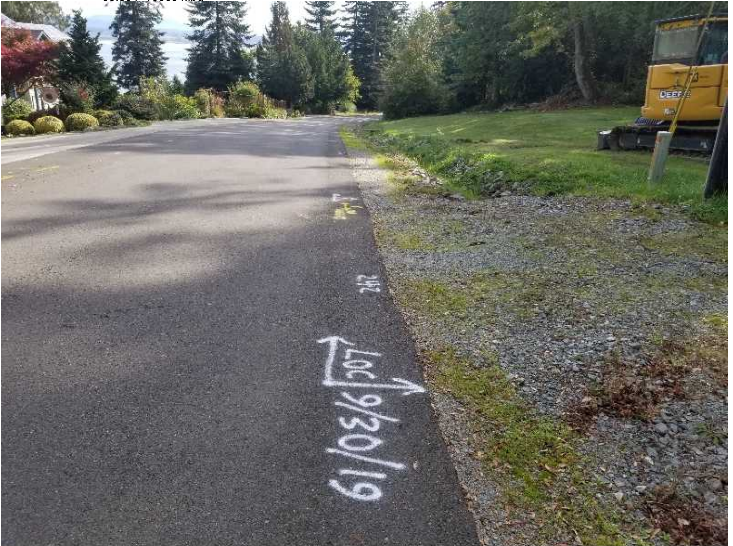
Photo created on 10/02/2019 10:30:25 AM PDT