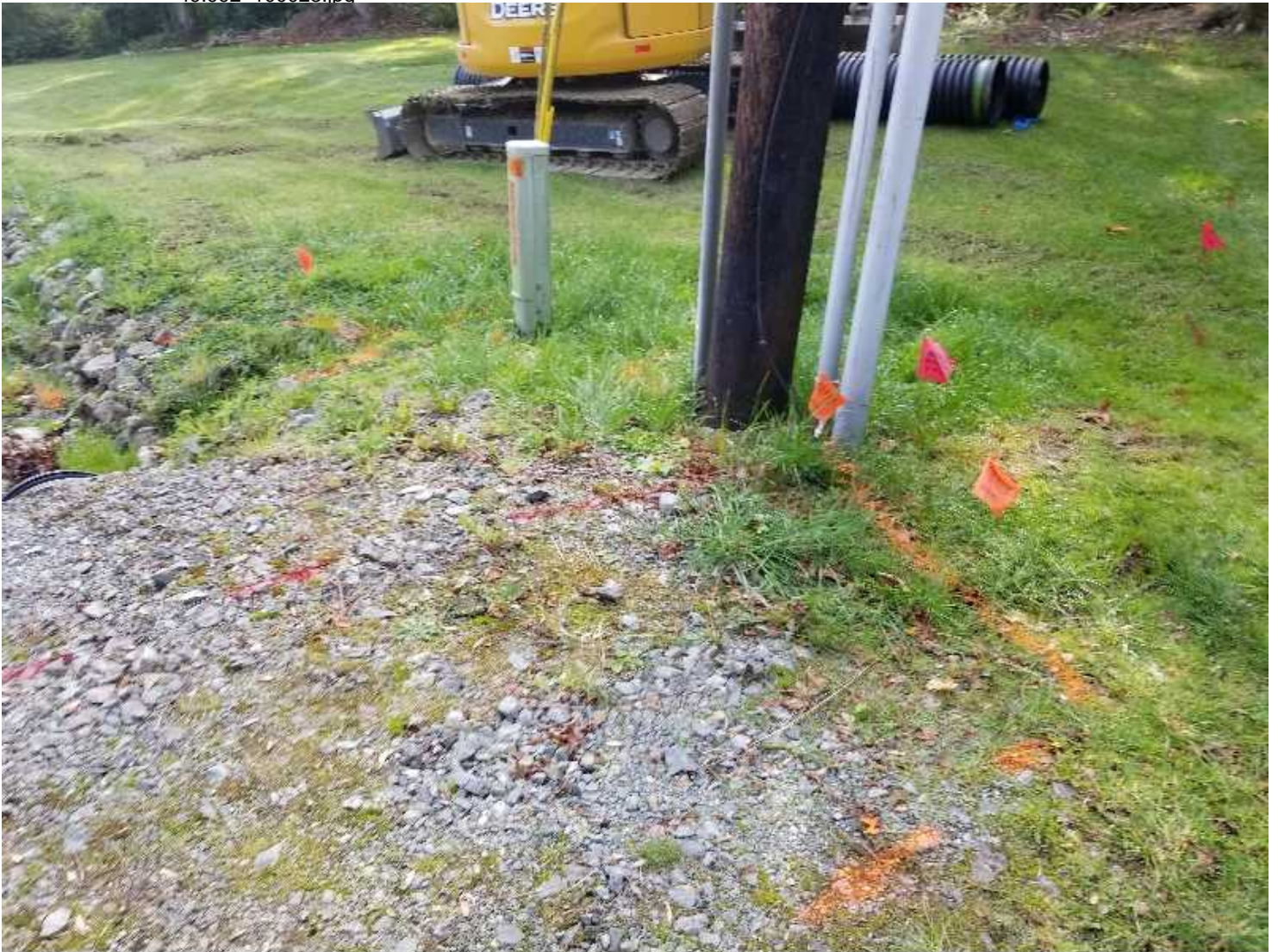
Photo created on 10/02/2019 10:52:20 AM PDT