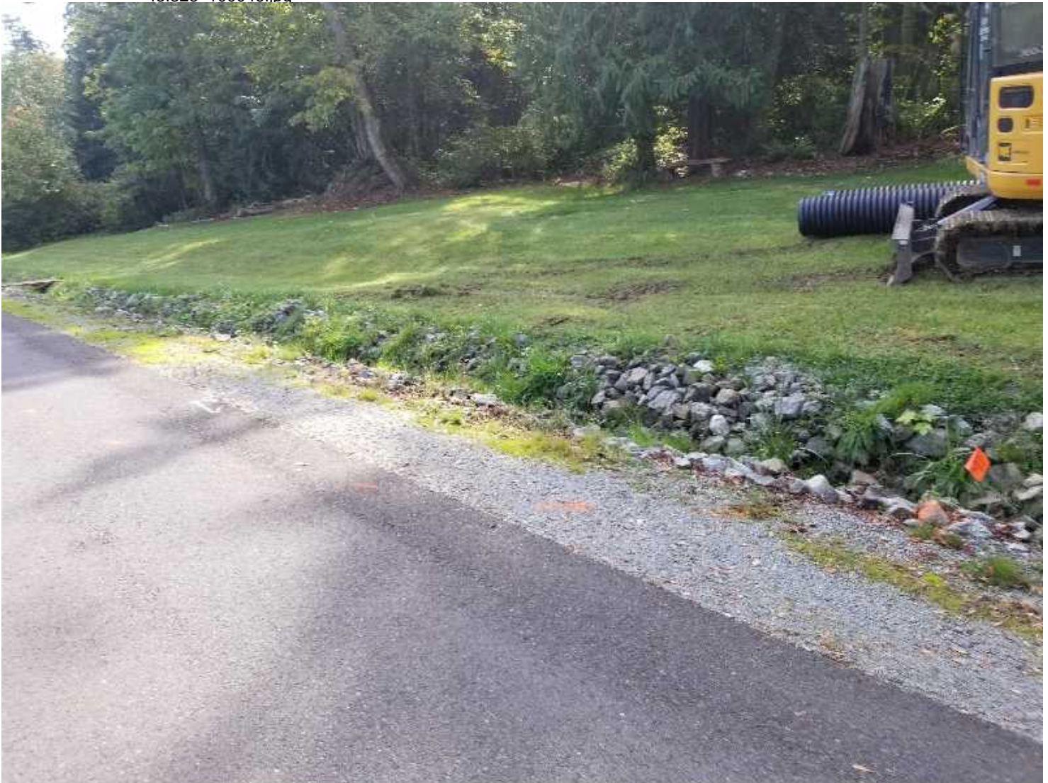
Photo created on 10/02/2019 10:52:36 AM PDT