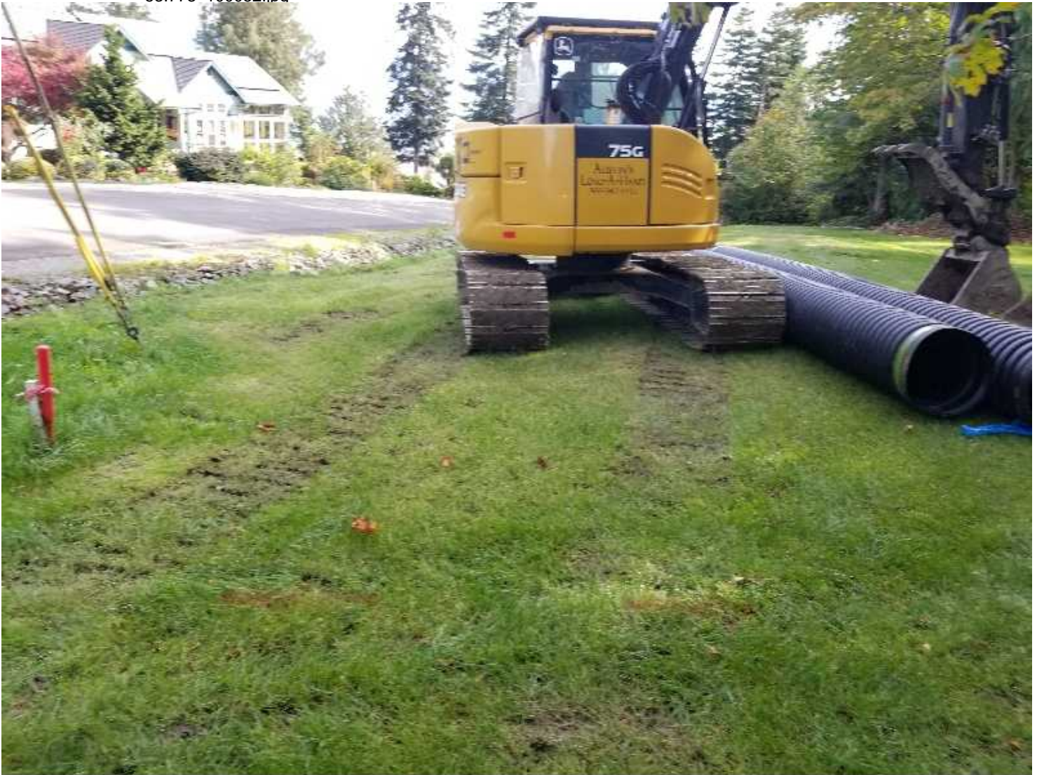
Photo created on 10/02/2019 10:56:00 AM PDT