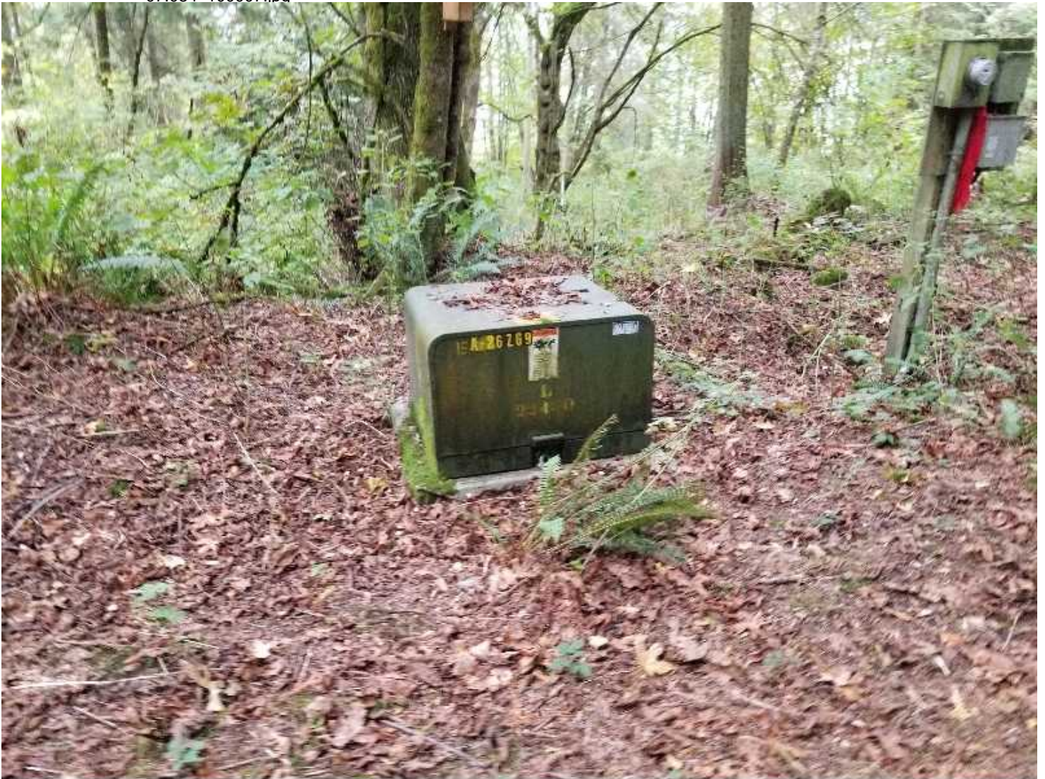
Photo created on 10/03/2019 09:29:47 AM PDT