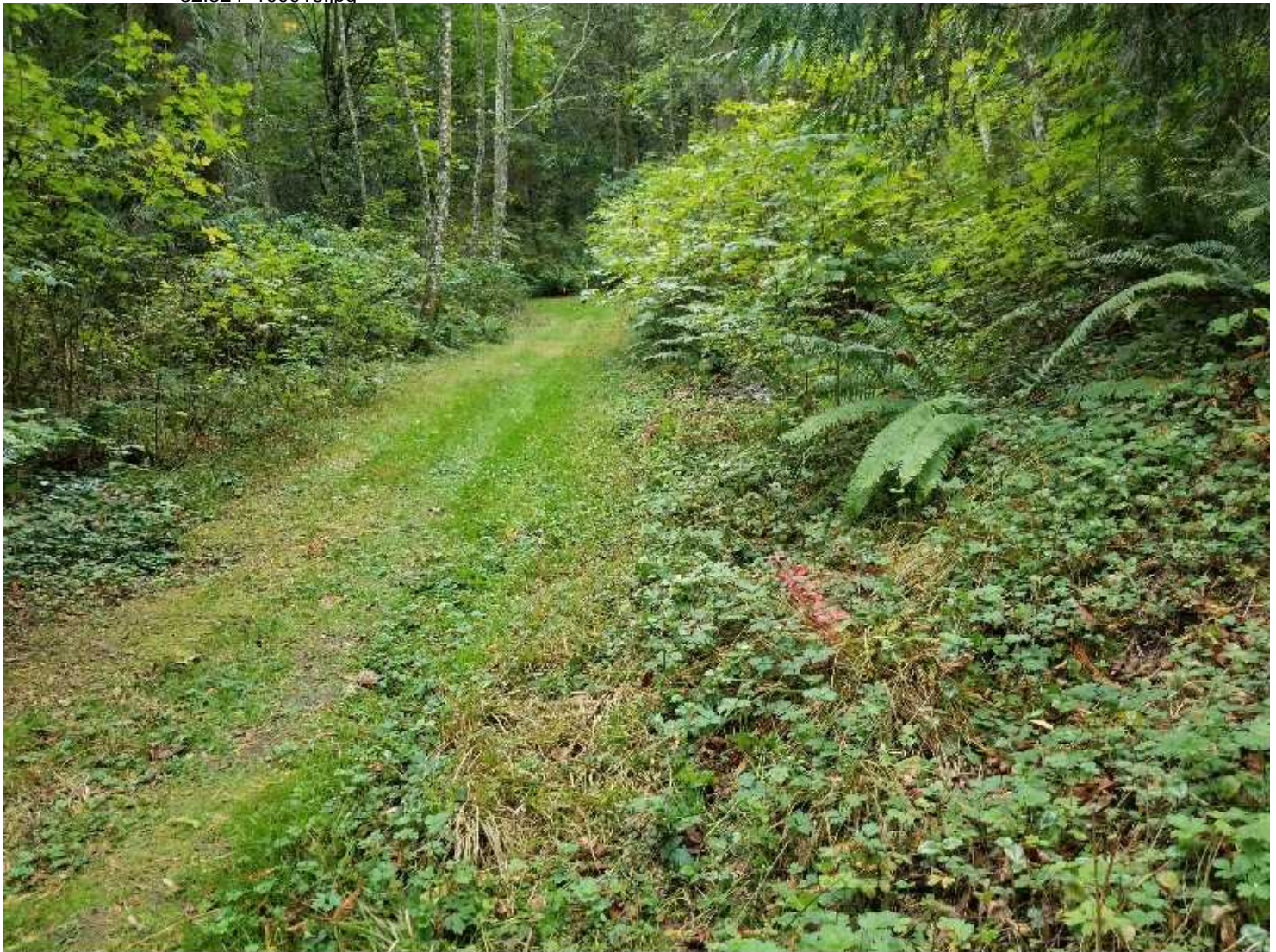
Photo created on 10/03/2019 09:34:36 AM PDT