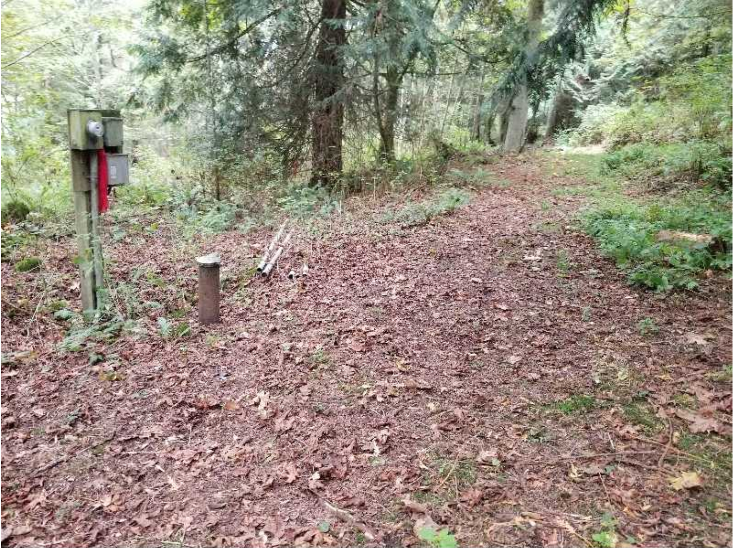
Property of United States Infrastructure Corporation Photo created on 10/03/2019 09:29:46 AM PDT