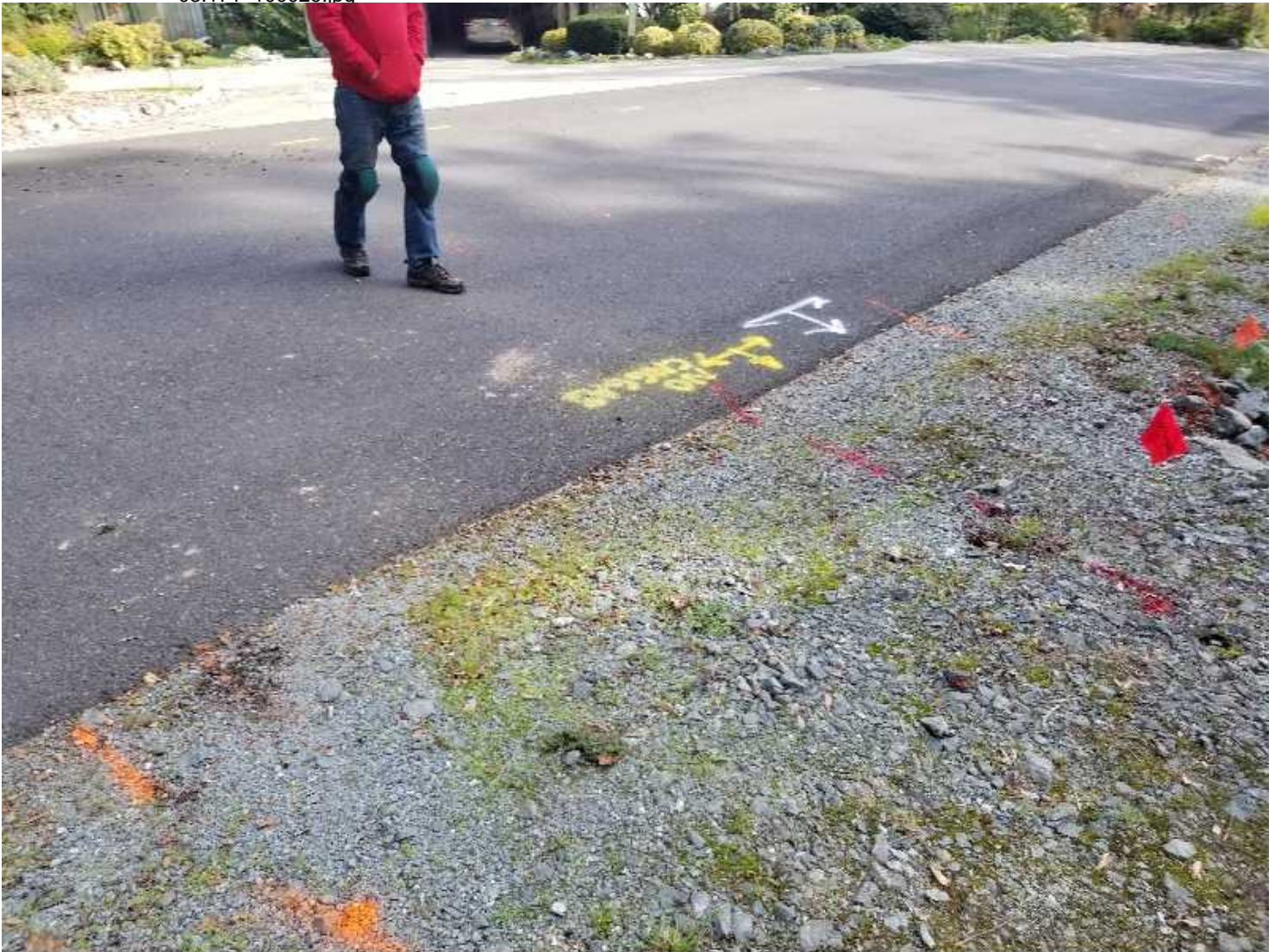
Property of United States Infrastructure Corporation Photo created on 10/02/2019 10:52:23 AM PDT