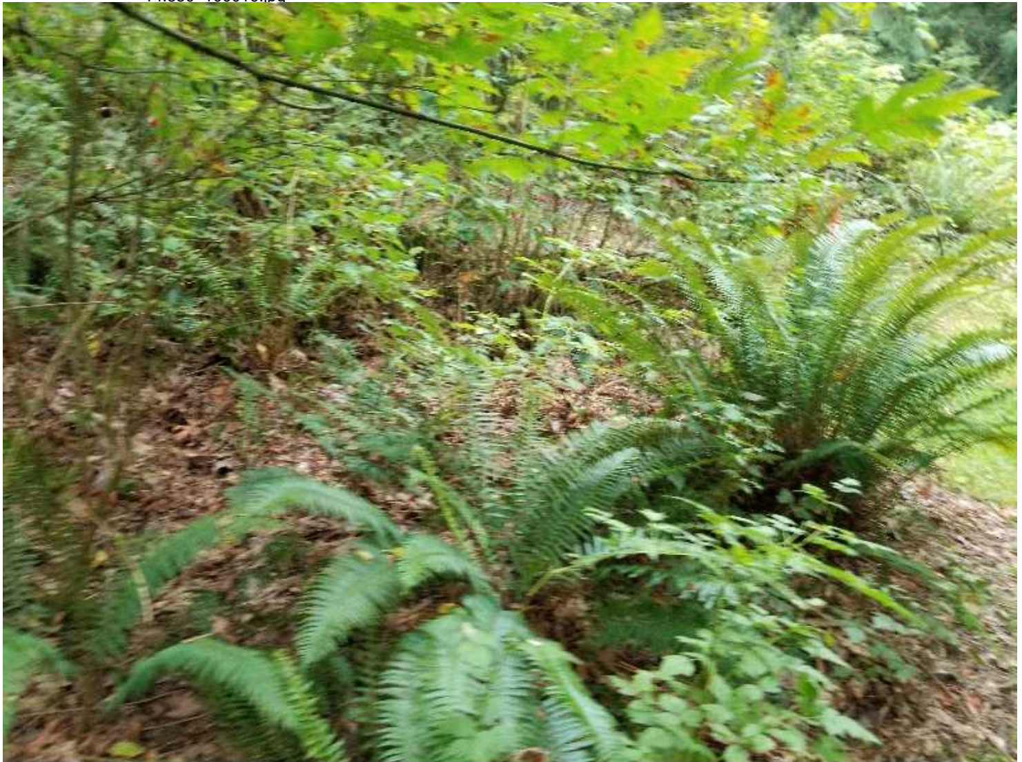
Property of United States Infrastructure Corporation Photo created on 10/03/2019 09:33:28 AM PDT