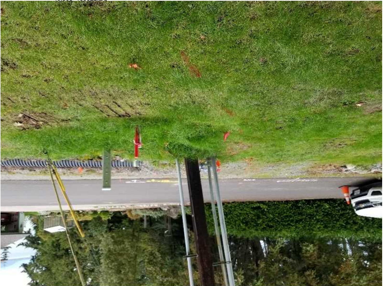
Property of United States Infrastructure Corporation Photo created on 10/03/2019 09:35:29 AM PDT