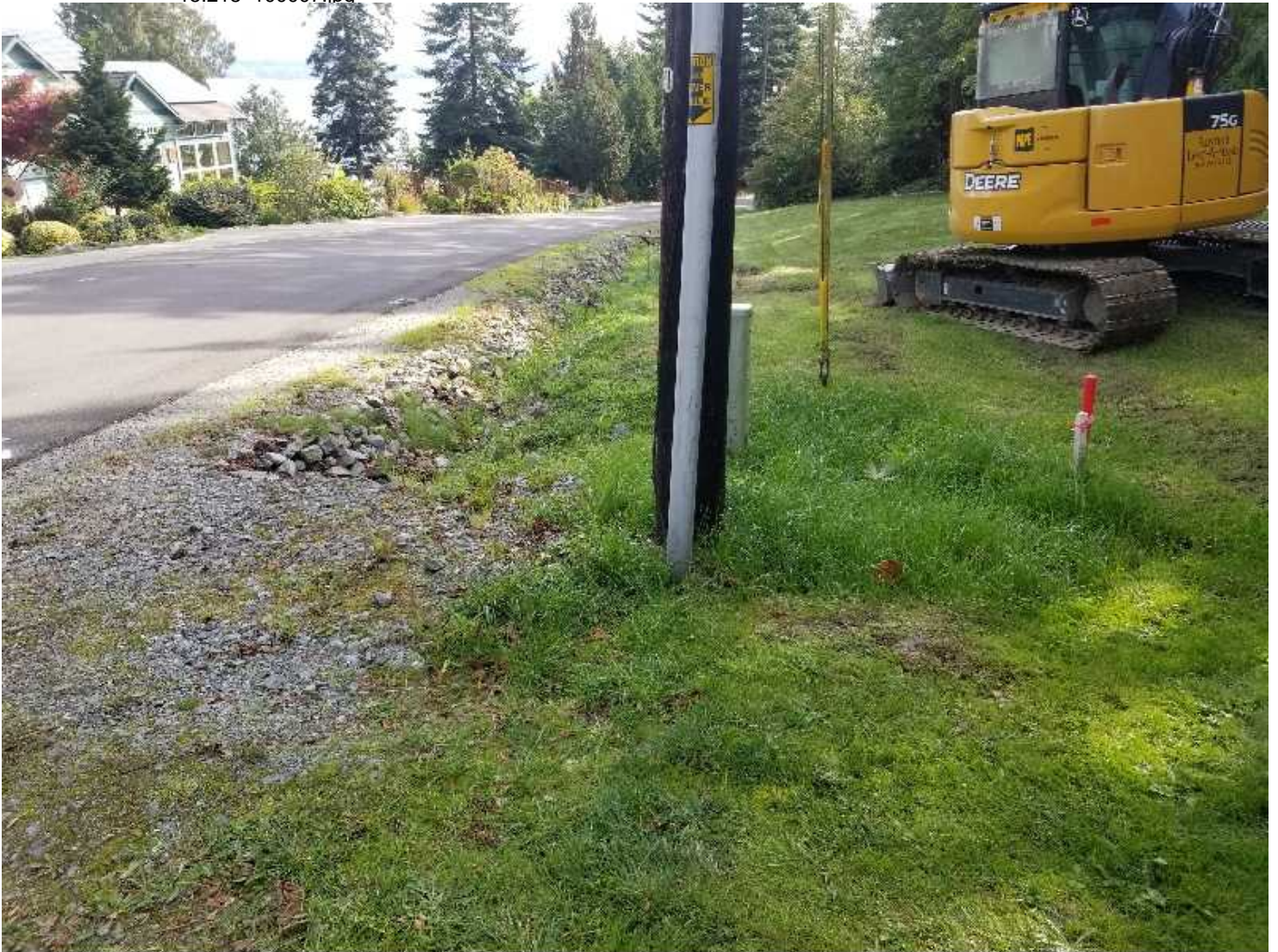
Photo created on 10/02/2019 10:30:36 AM PDT