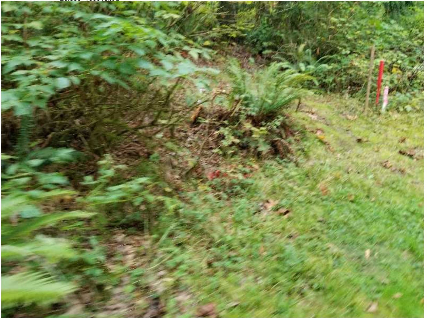
Photo created on 10/03/2019 09:33:32 AM PDT