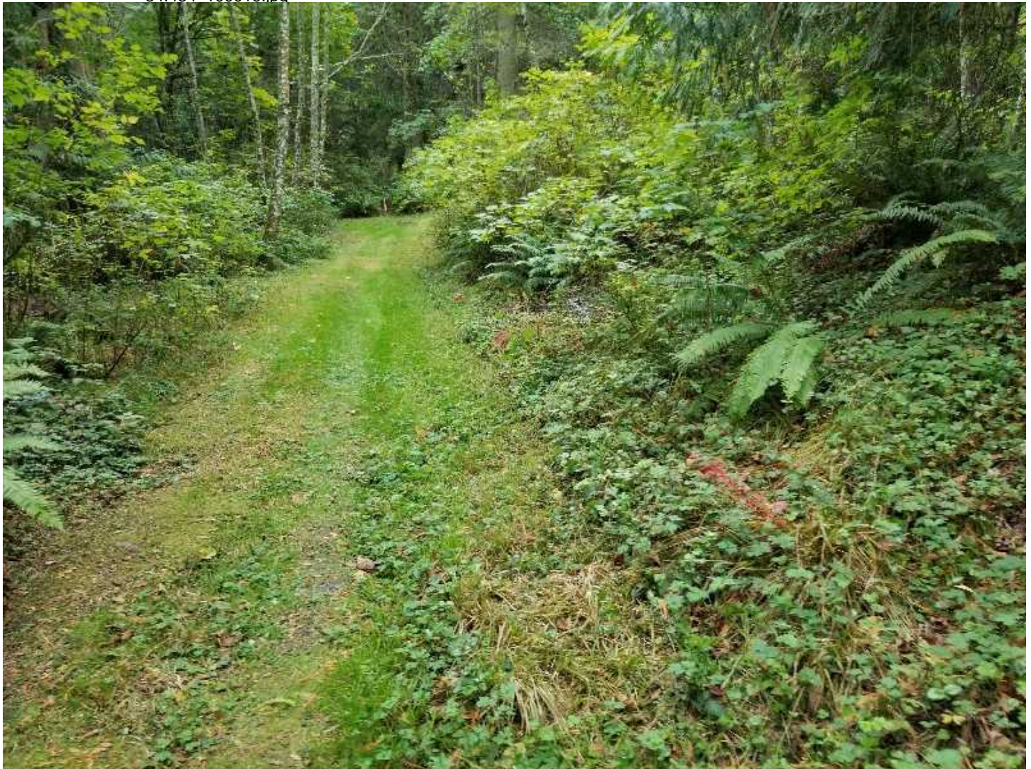
Property of United States Infrastructure Corporation Photo created on 10/03/2019 09:34:37 AM PDT