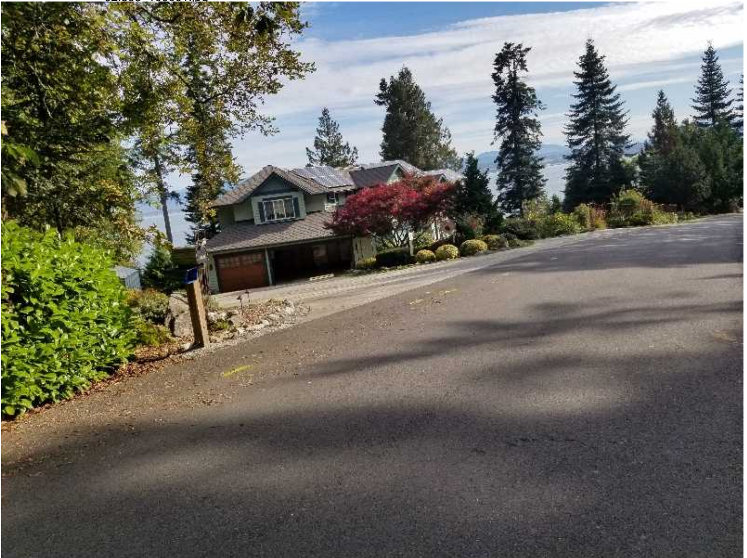
Photo created on 10/02/2019 10:30:22 AM PDT