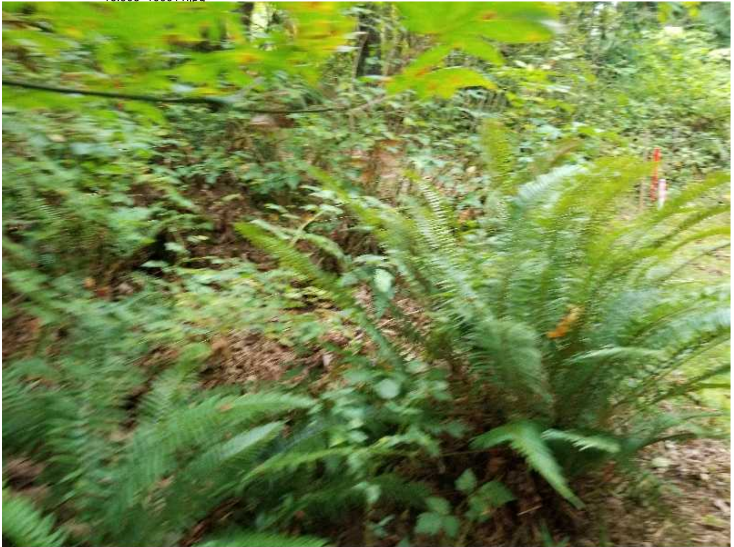
Photo created on 10/03/2019 09:33:30 AM PDT