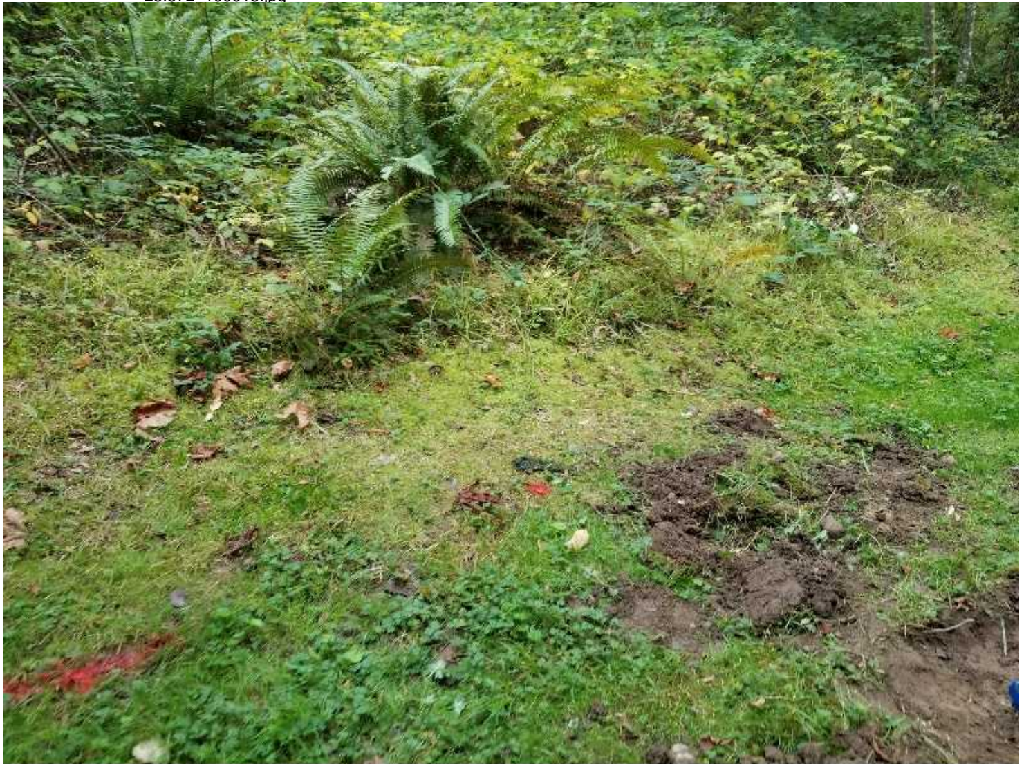
Property of United States Infrastructure Corporation Photo created on 10/03/2019 09:33:34 AM PDT