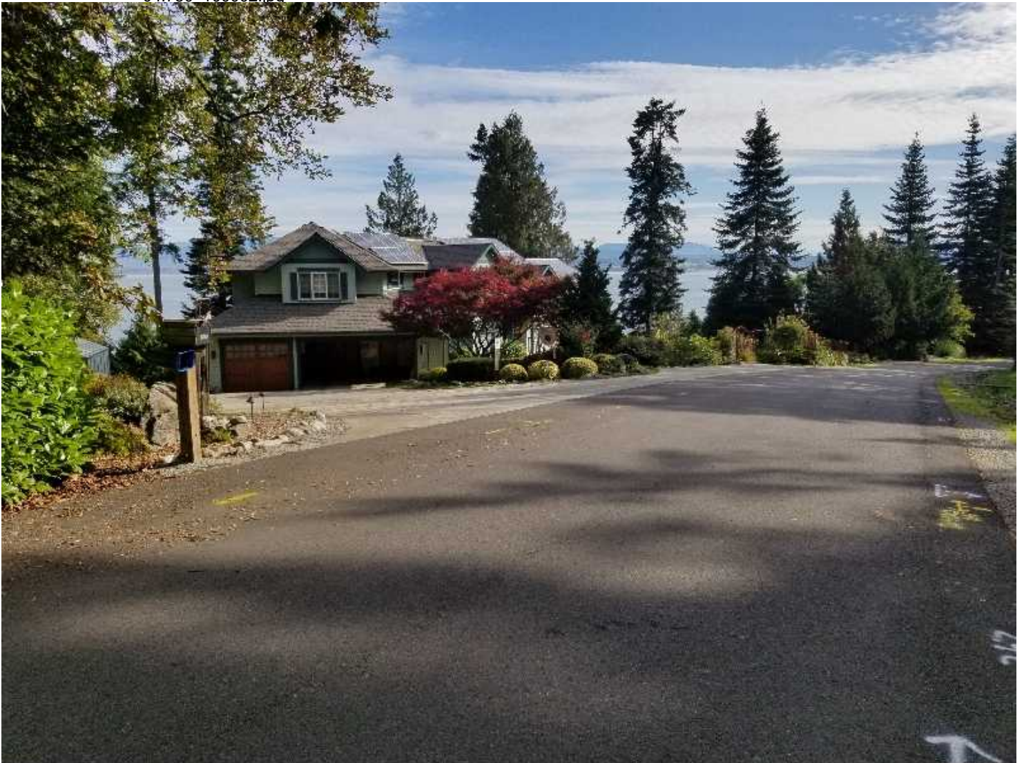
Property of United States Infrastructure Corporation Photo created on 10/02/2019 10:30:23 AM PDT