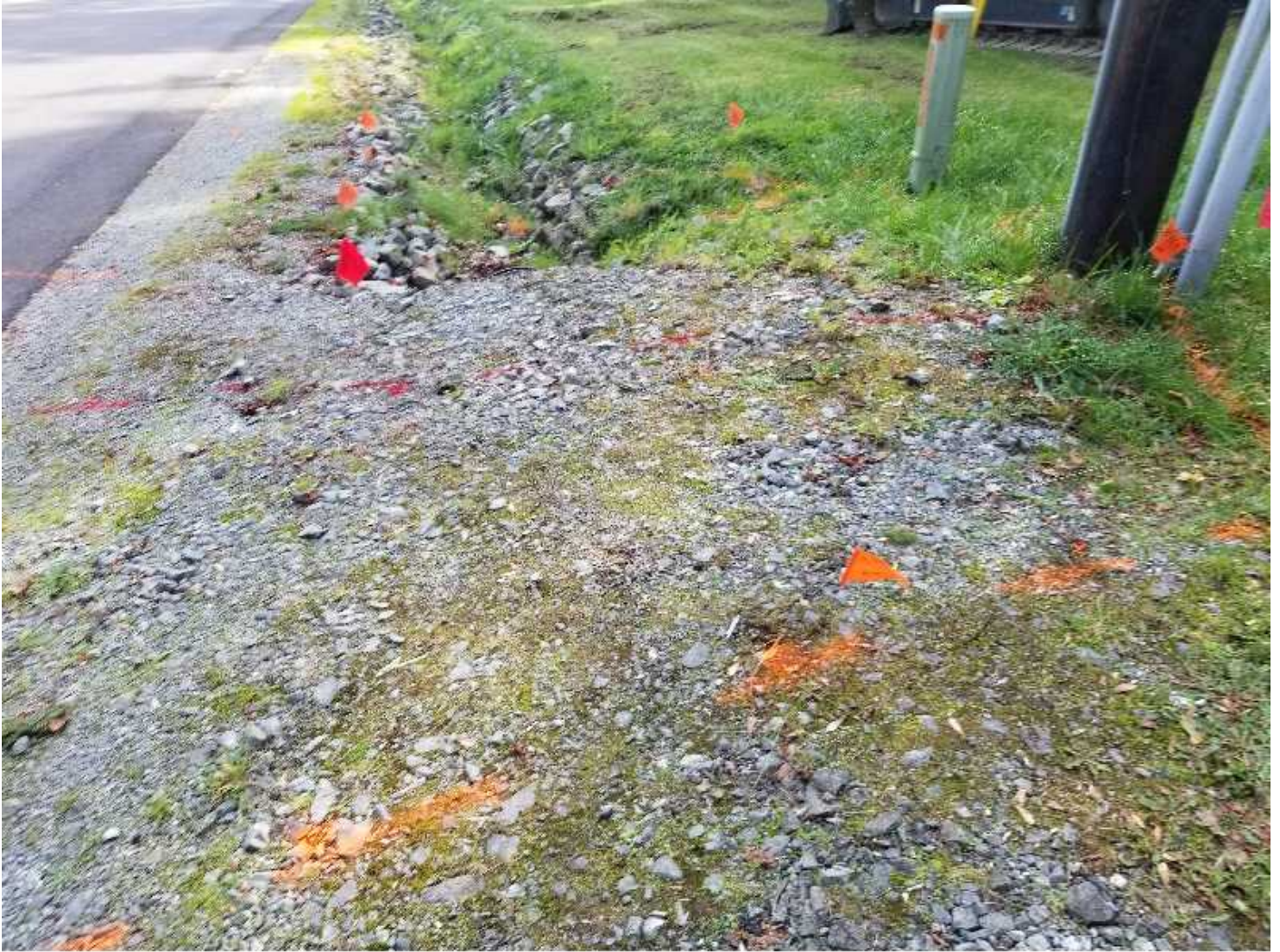
Property of United States Infrastructure Corporation Photo created on 10/02/2019 10:52:27 AM PDT