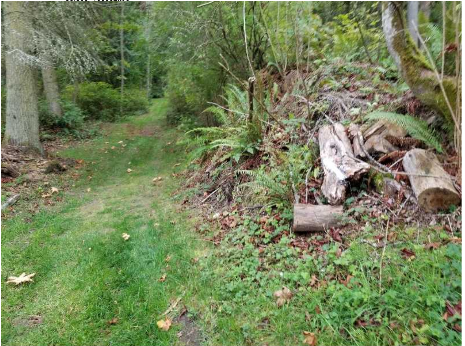
Photo created on 10/03/2019 09:22:06 AM PDT