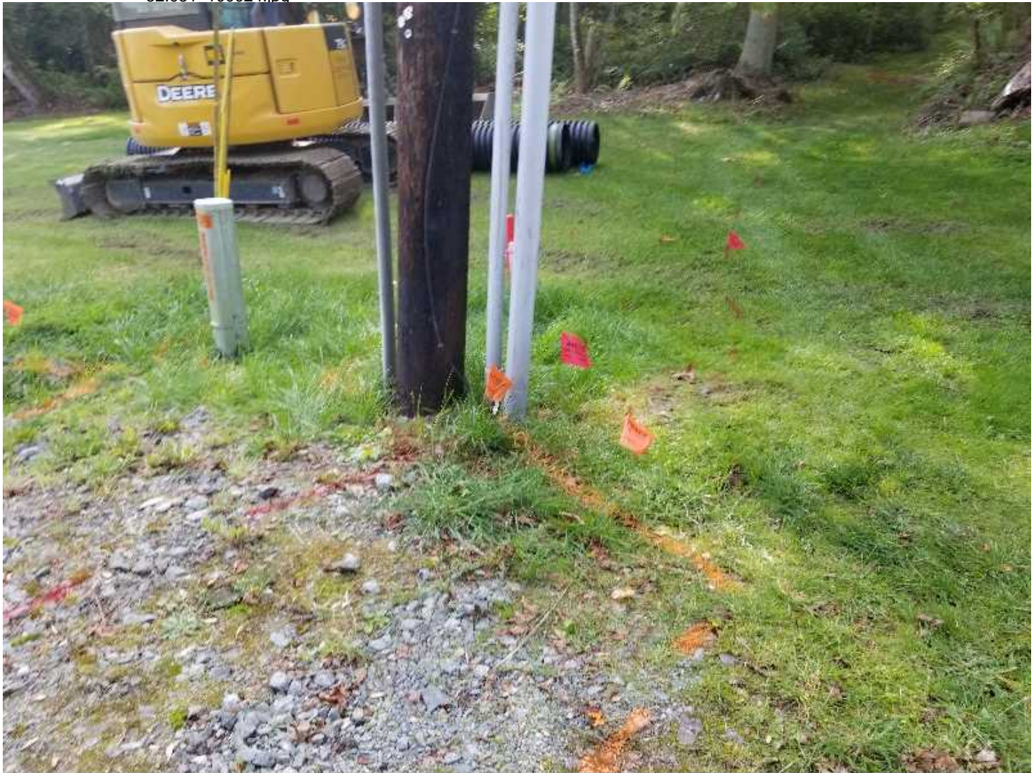
Property of United States Infrastructure Corporation Photo created on 10/02/2019 10:52:20 AM PDT