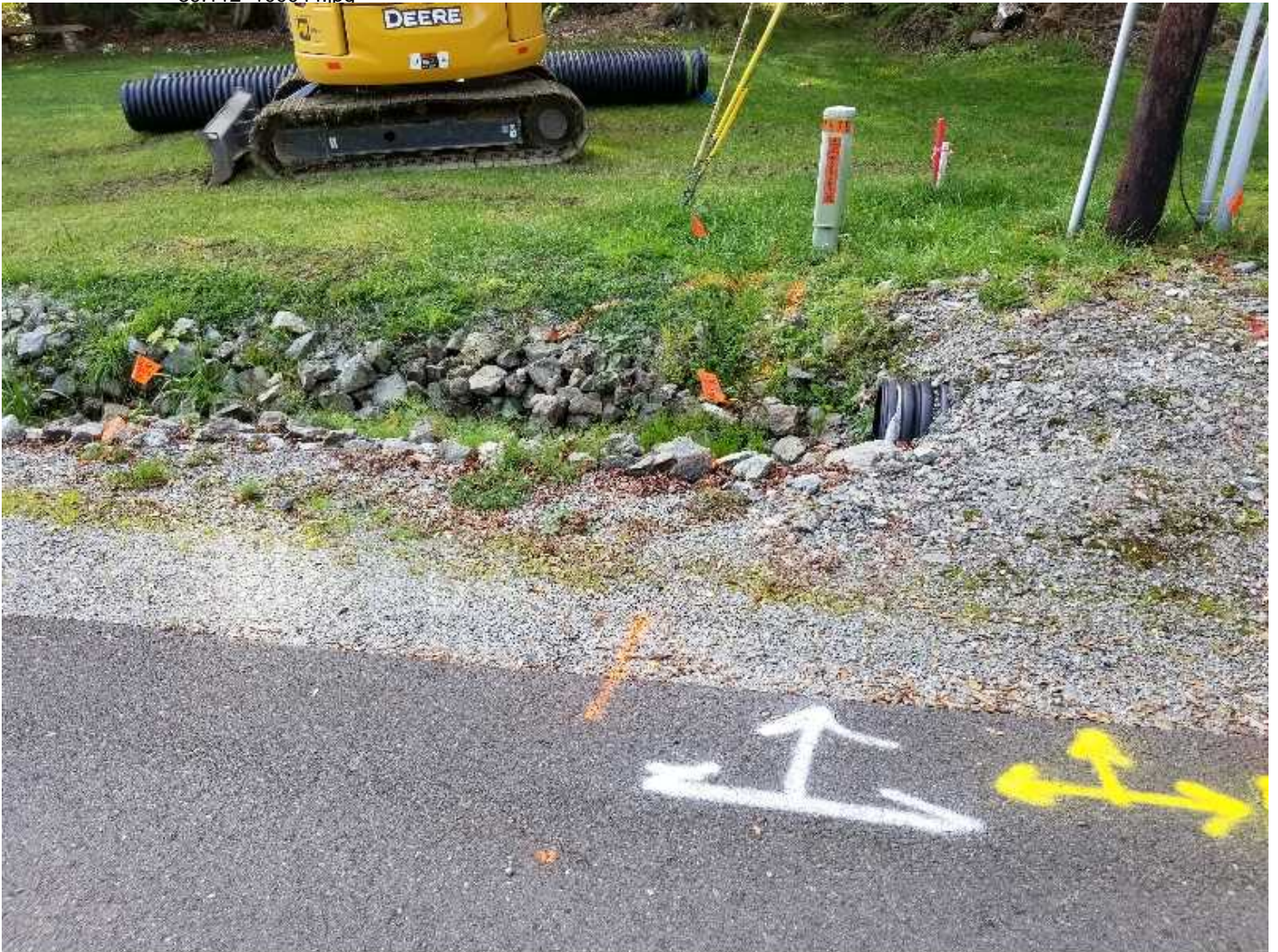
Property of United States Infrastructure Corporation Photo created on 10/02/2019 10:52:35 AM PDT