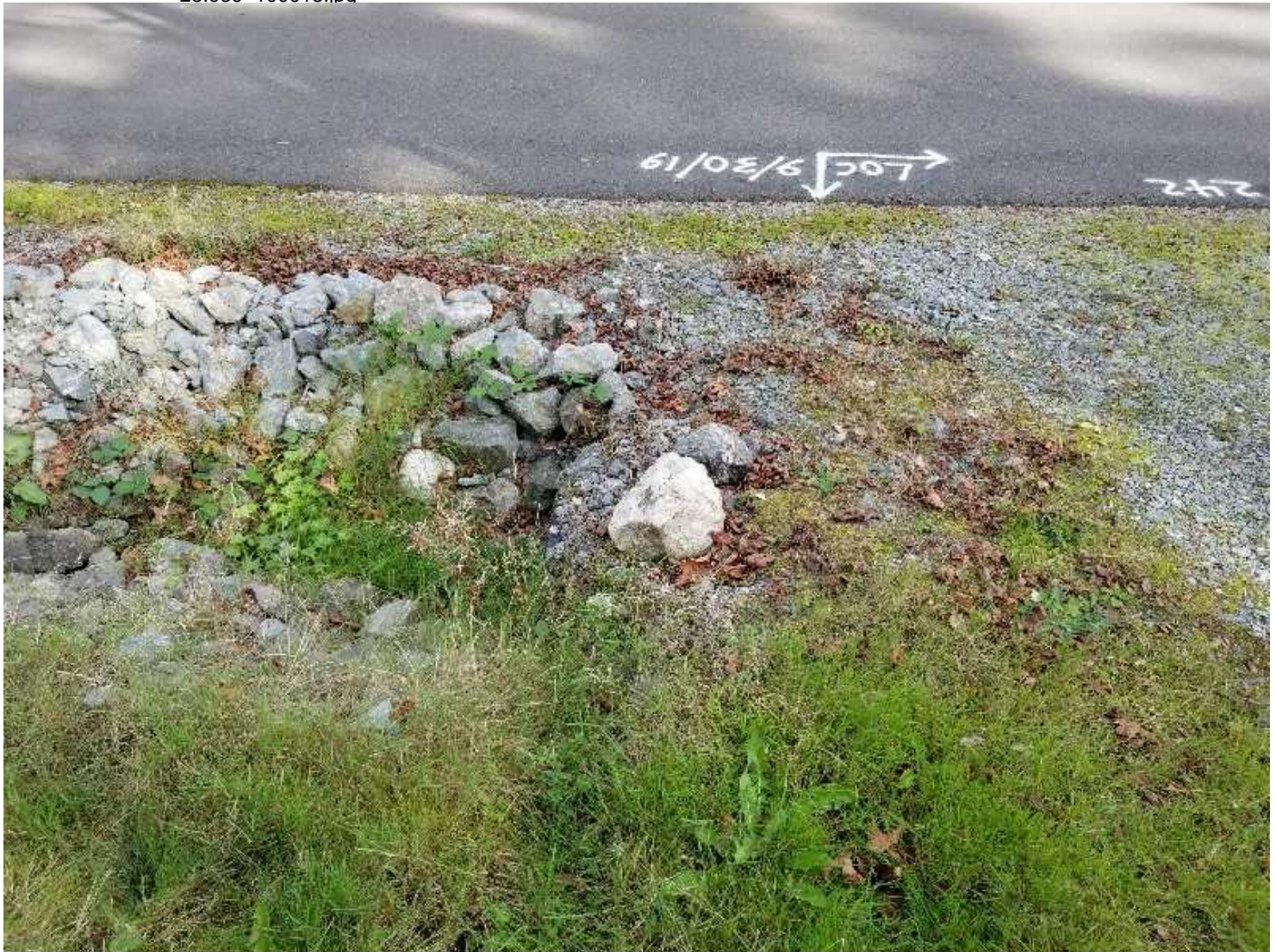
Property of United States Infrastructure Corporation Photo created on 10/02/2019 10:30:39 AM PDT