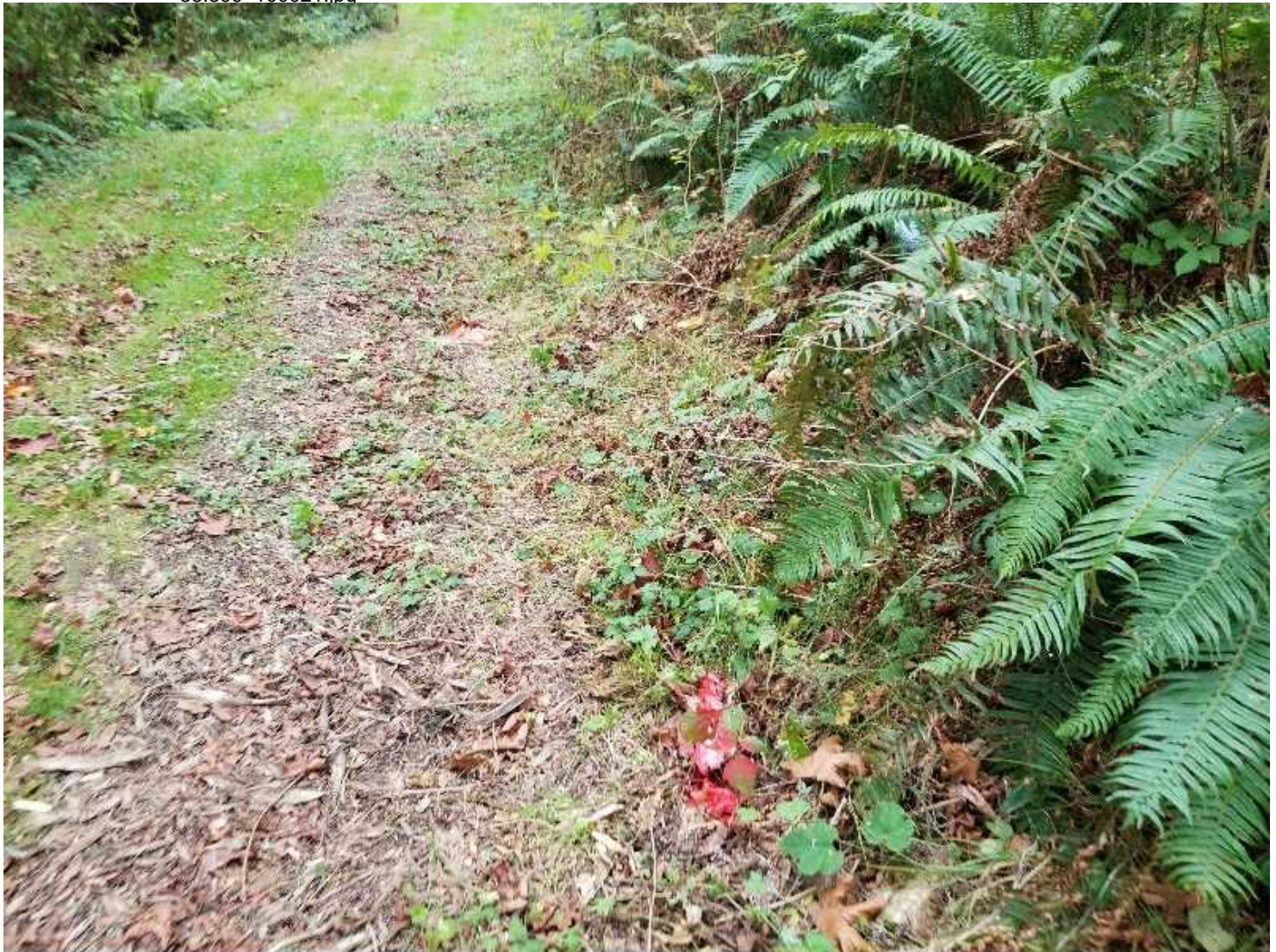
Property of United States Infrastructure Corporation Photo created on 10/03/2019 09:35:04 AM PDT