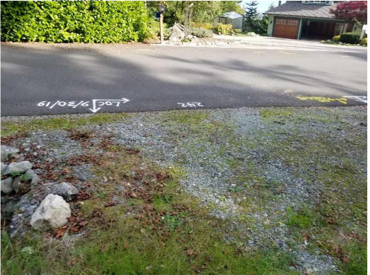
Property of United States Infrastructure Corporation Photo created on 10/02/2019 10:30:38 AM PDT