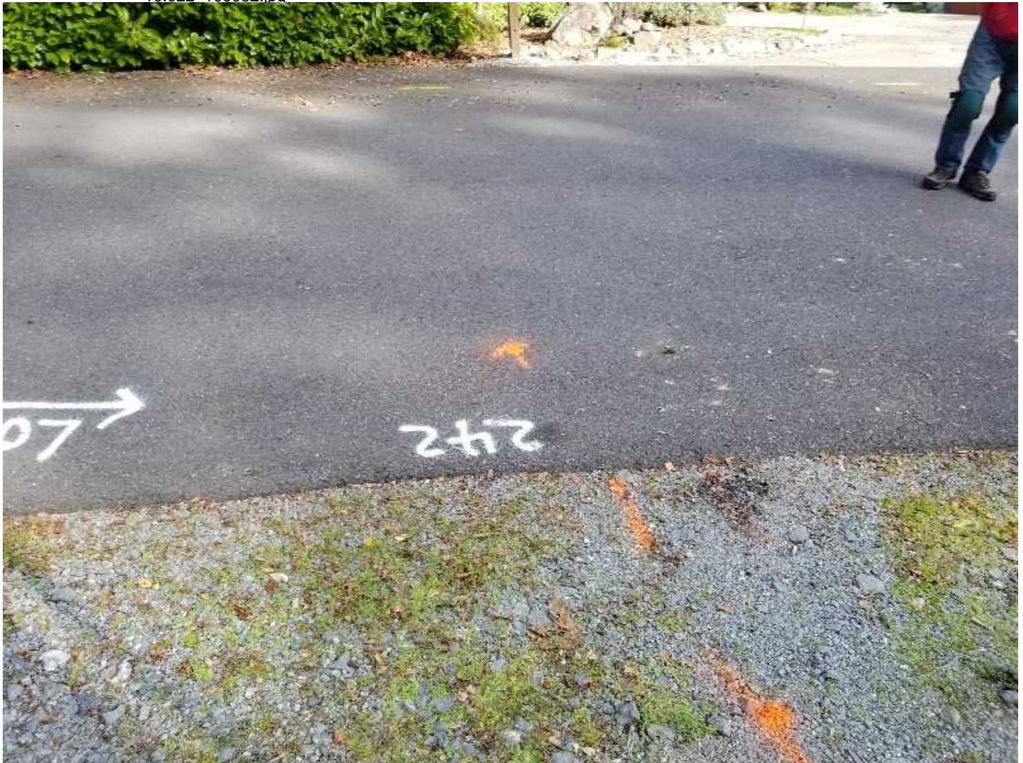
Photo created on 10/02/2019 10:52:24 AM PDT