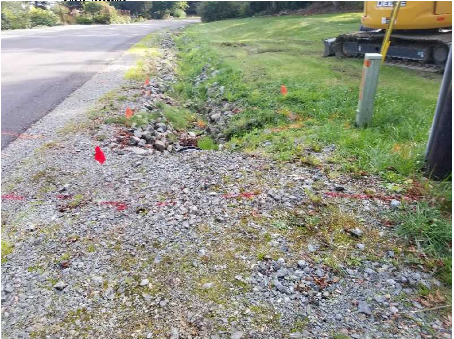
Property of United States Infrastructure Corporation Photo created on 10/02/2019 10:52:21 AM PDT