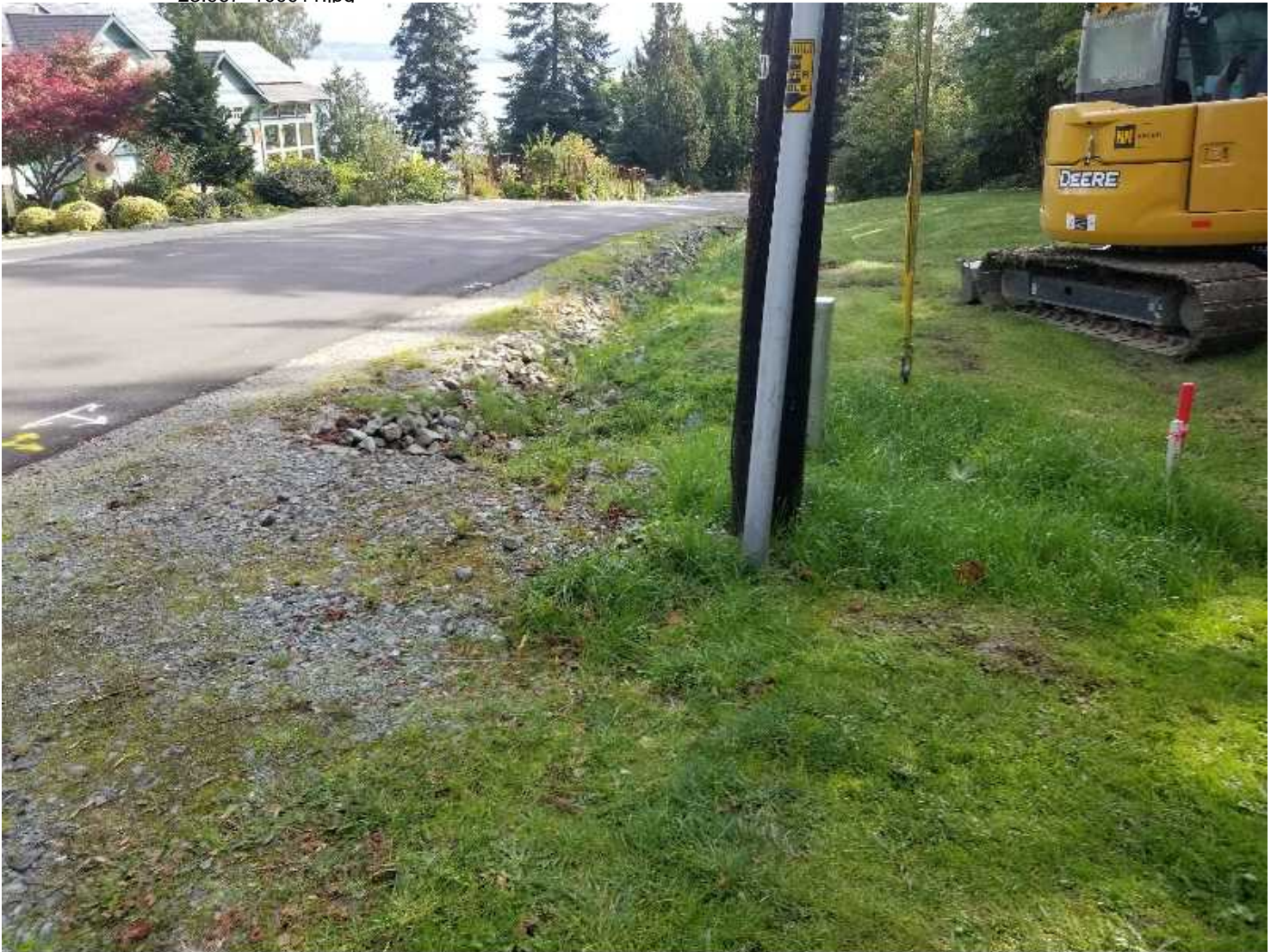
Property of United States Infrastructure Corporation Photo created on 10/02/2019 10:30:36 AM PDT