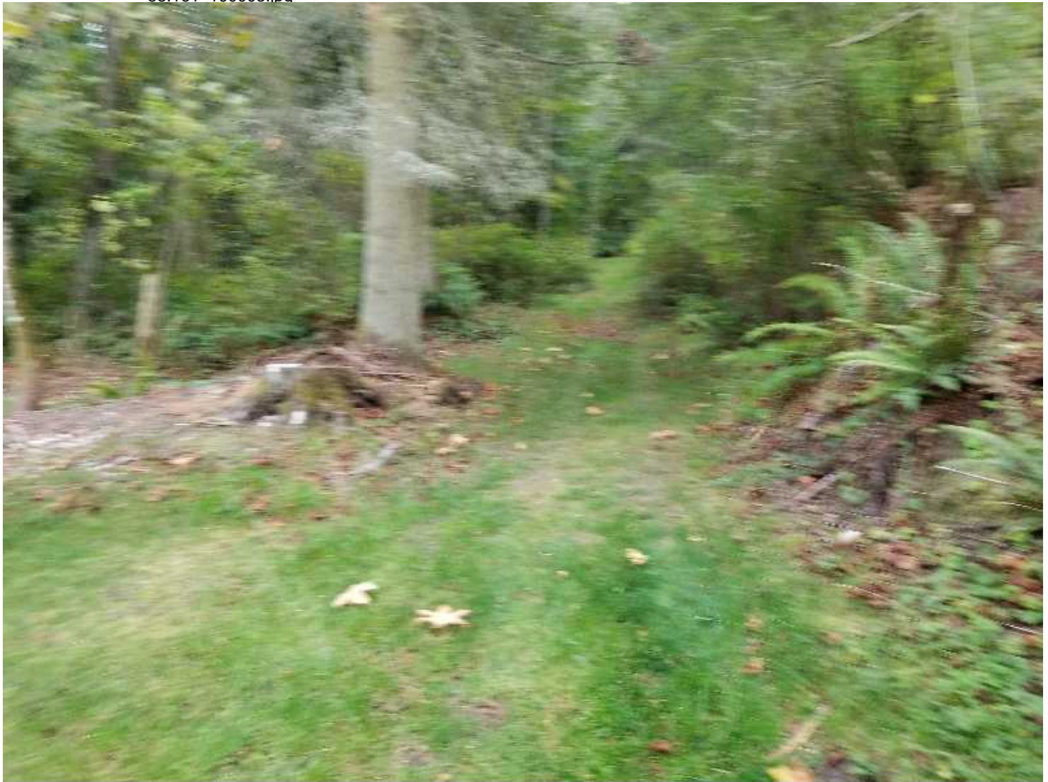
Photo created on 10/03/2019 09:22:07 AM PDT