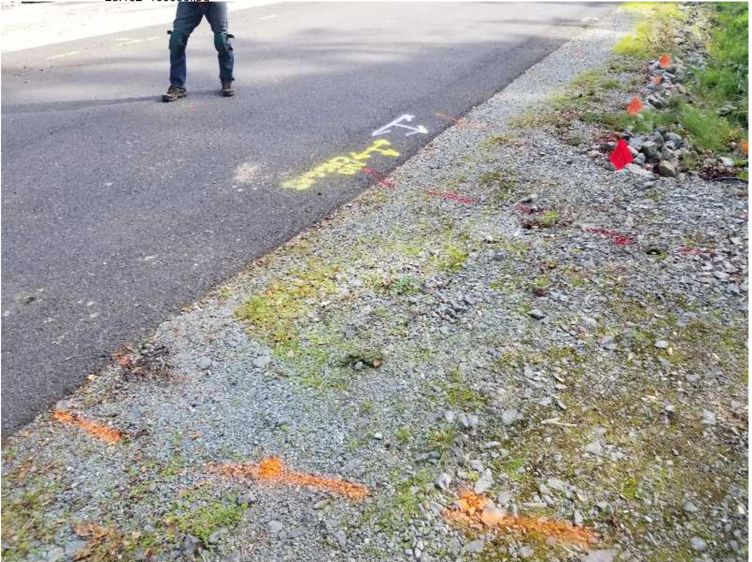
Property of United States Infrastructure Corporation Photo created on 10/02/2019 10:52:27 AM PDT