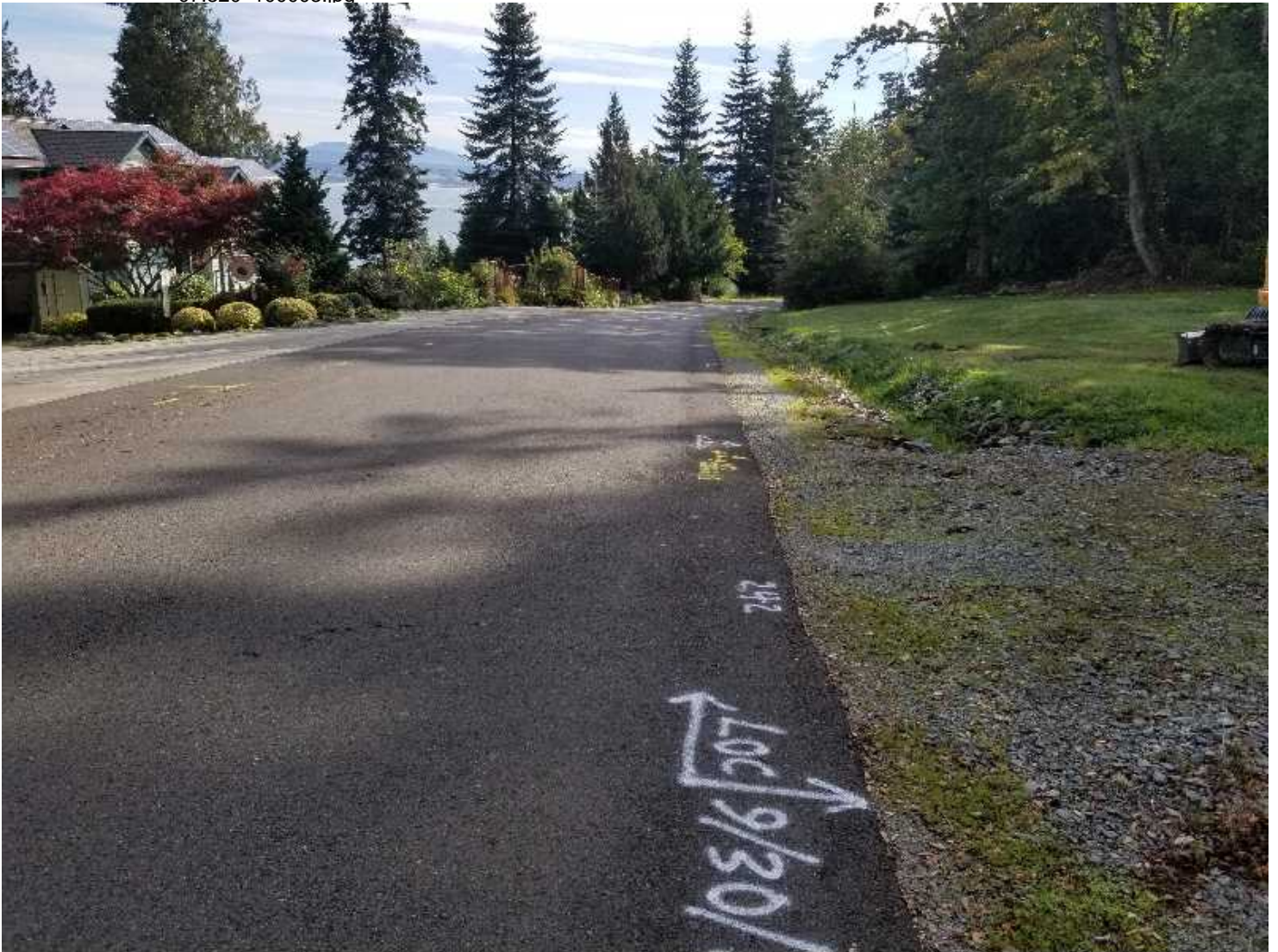
Property of United States Infrastructure Corporation Photo created on 10/02/2019 10:30:24 AM PDT