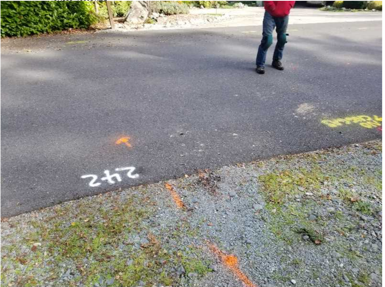
Property of United States Infrastructure Corporation Photo created on 10/02/2019 10:52:24 AM PDT