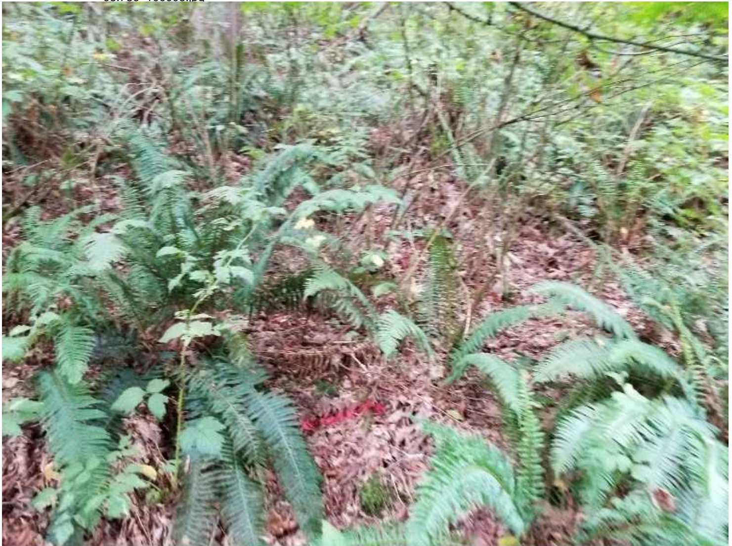
Photo created on 10/03/2019 09:33:26 AM PDT