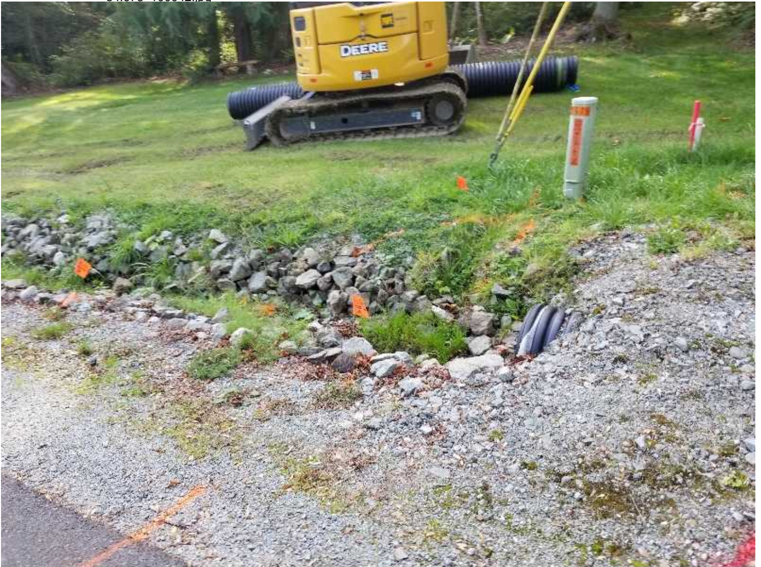
Photo created on 10/02/2019 10:52:32 AM PDT