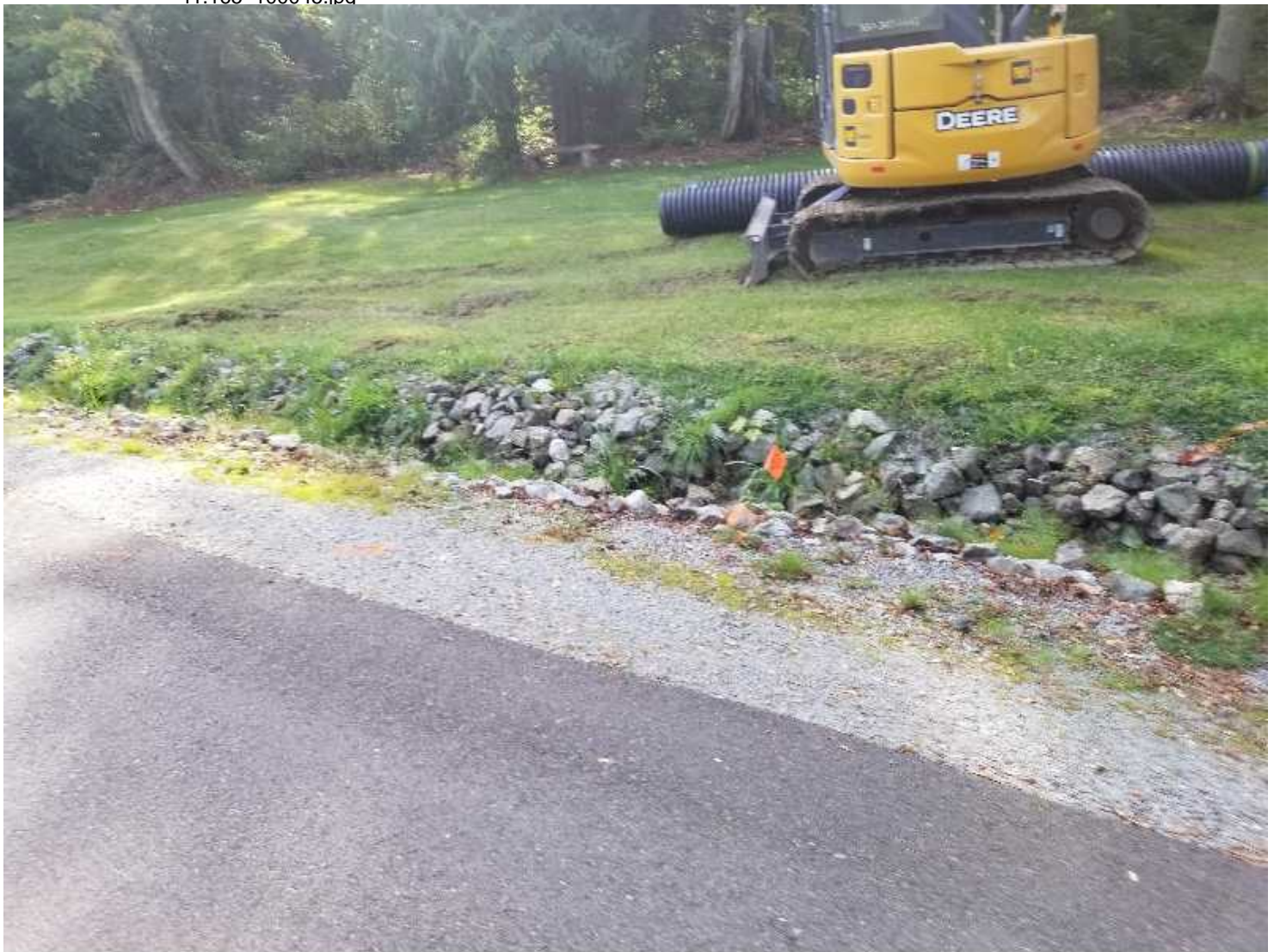
Photo created on 10/02/2019 10:52:36 AM PDT