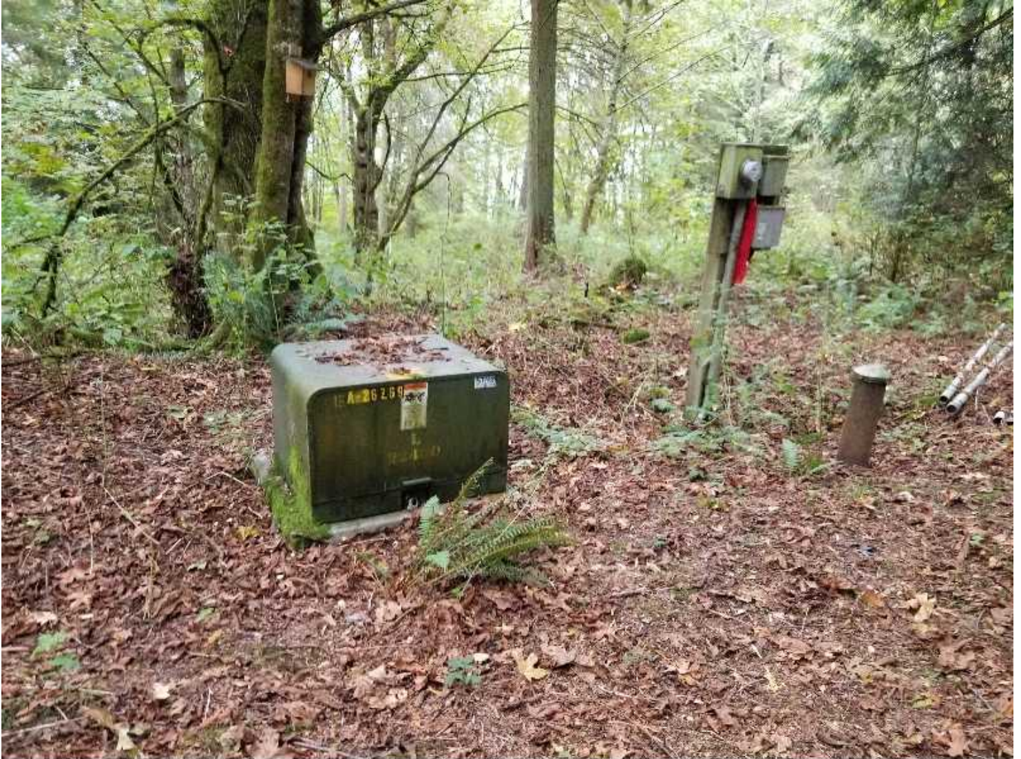
Property of United States Infrastructure Corporation Photo created on 10/03/2019 09:29:44 AM PDT