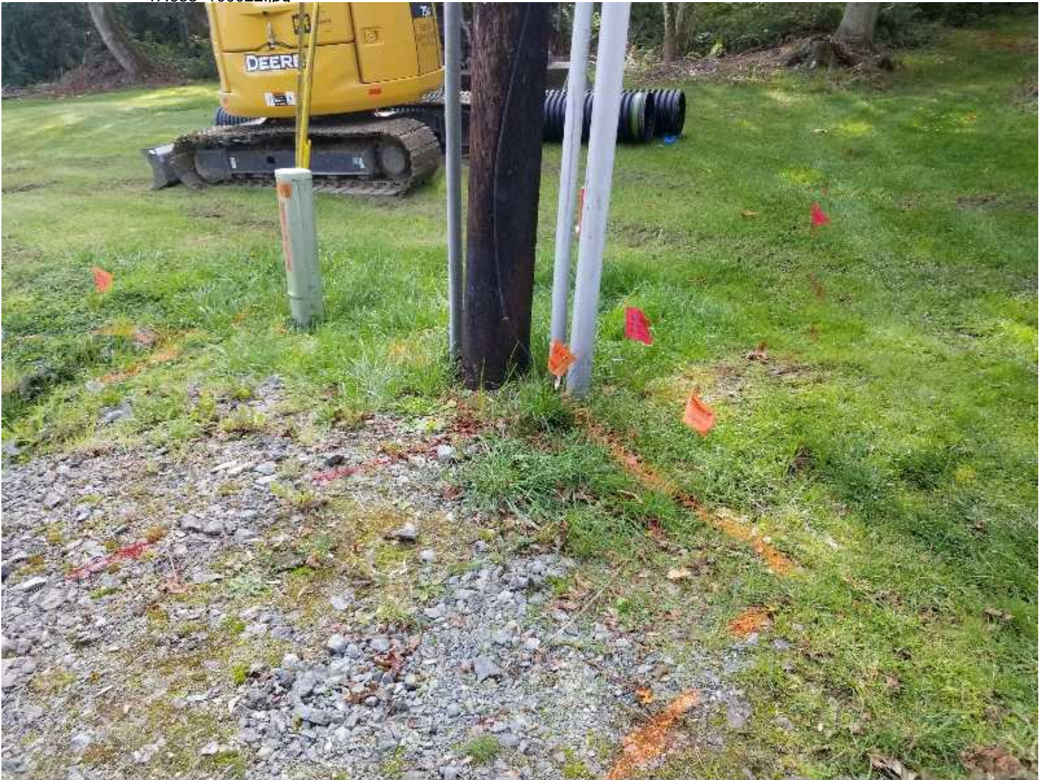
Photo created on 10/02/2019 10:52:20 AM PDT