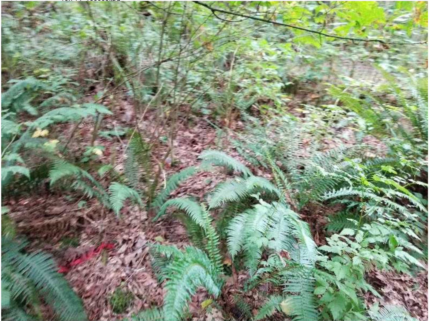
Property of United States Infrastructure Corporation Photo created on 10/03/2019 09:33:27 AM PDT