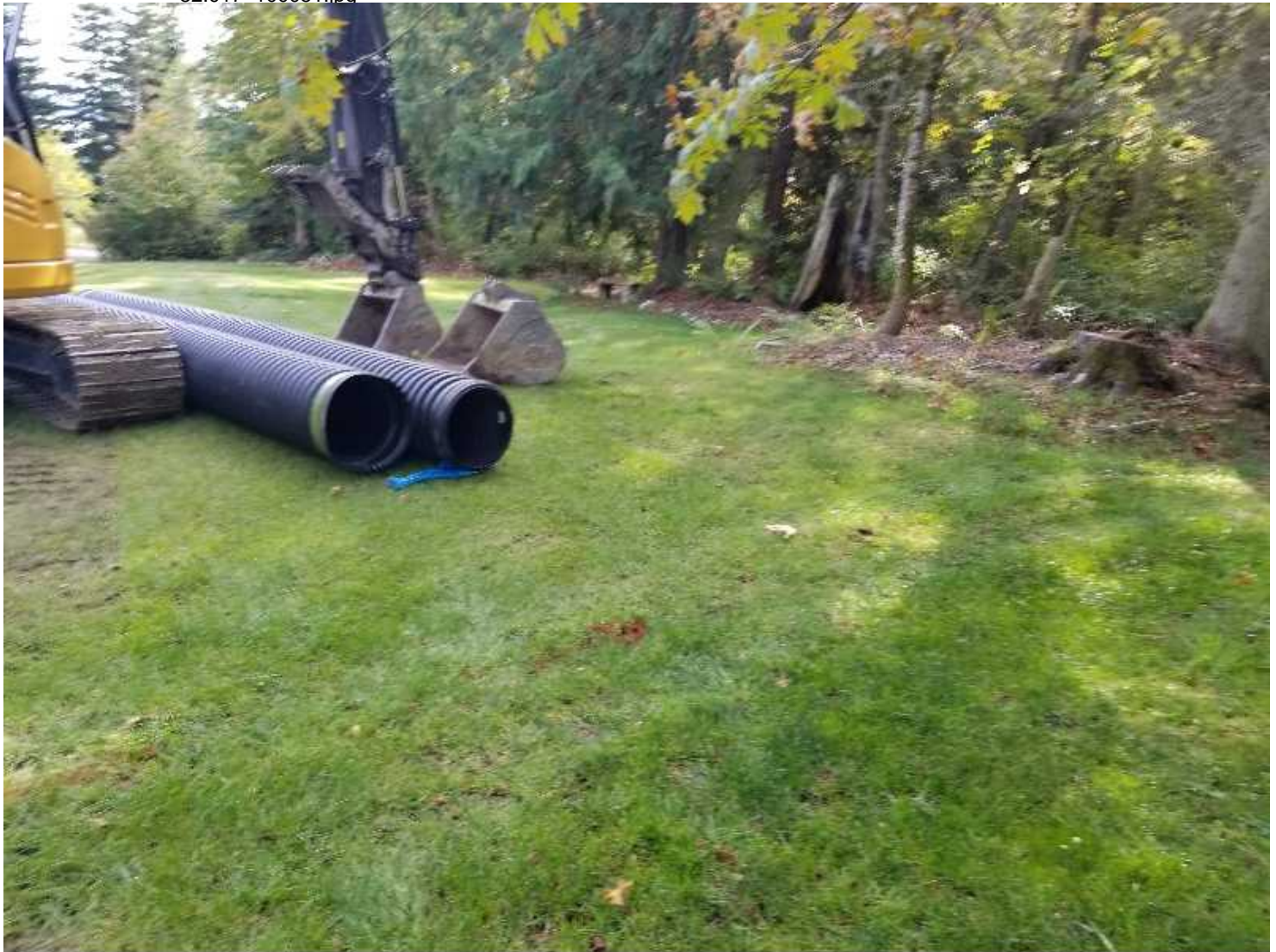
Property of United States Infrastructure Corporation Photo created on 10/02/2019 10:55:59 AM PDT