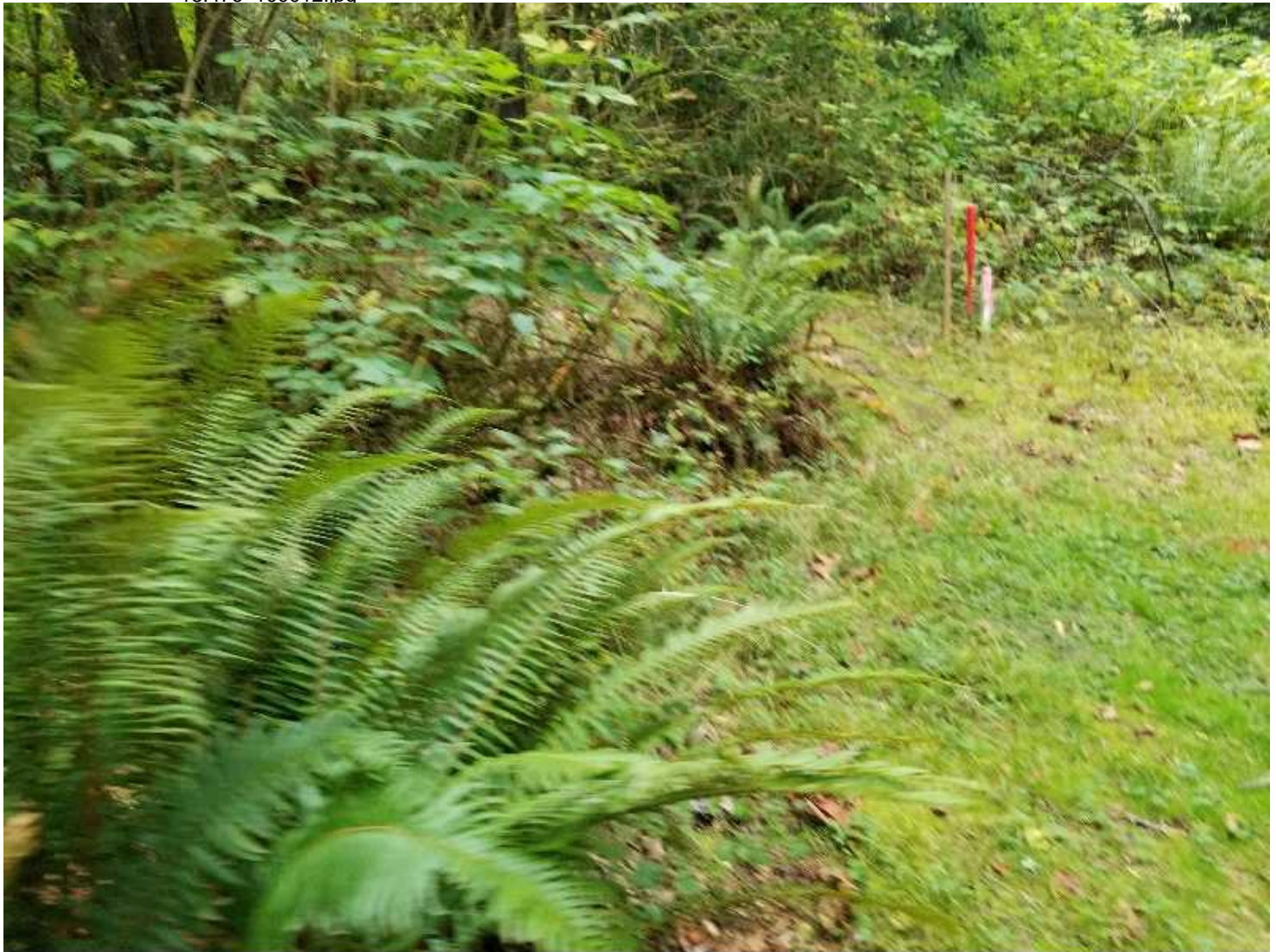
Property of United States Infrastructure Corporation Photo created on 10/03/2019 09:33:31 AM PDT