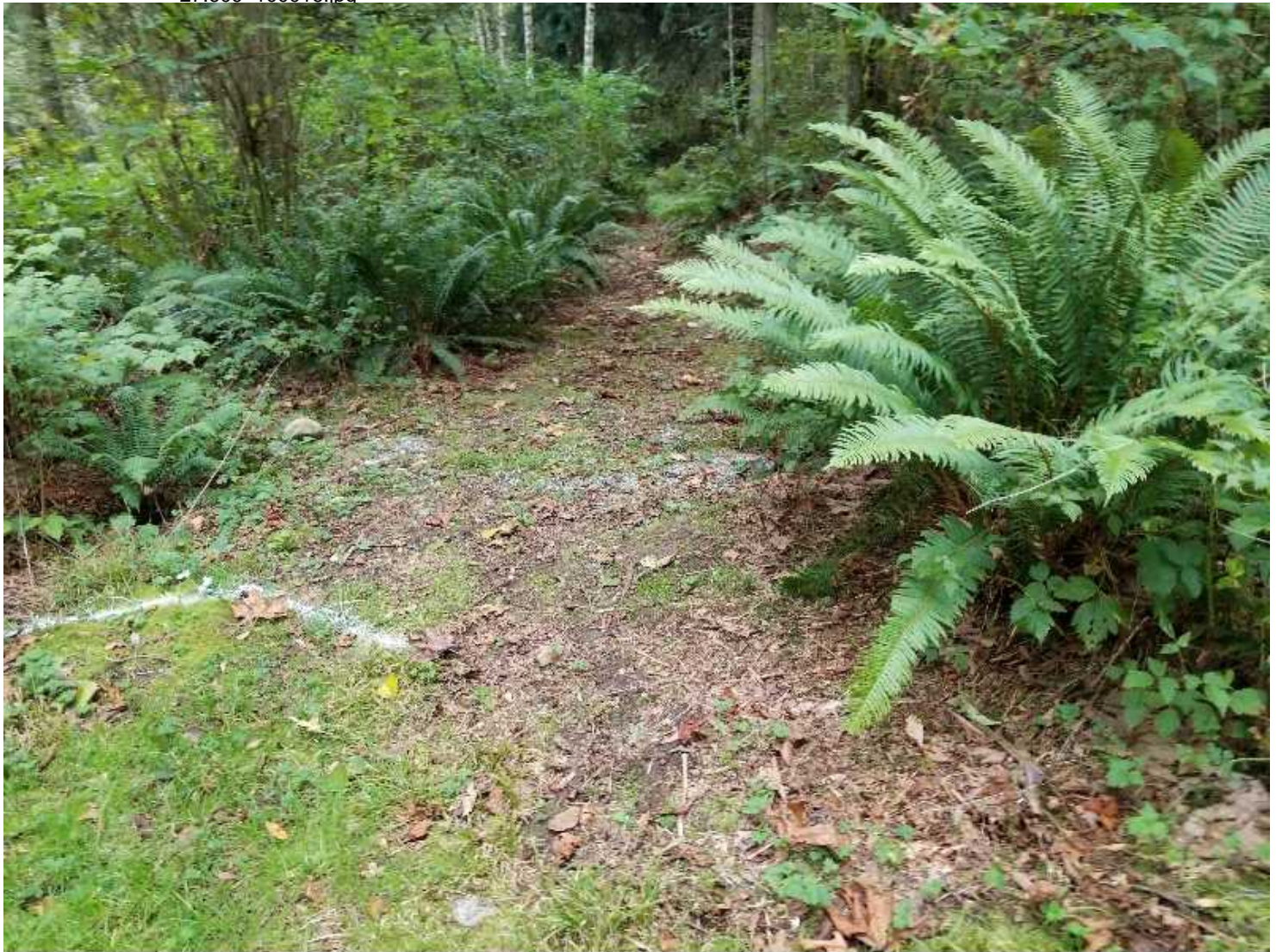
Property of United States Infrastructure Corporation Photo created on 10/03/2019 09:33:36 AM PDT