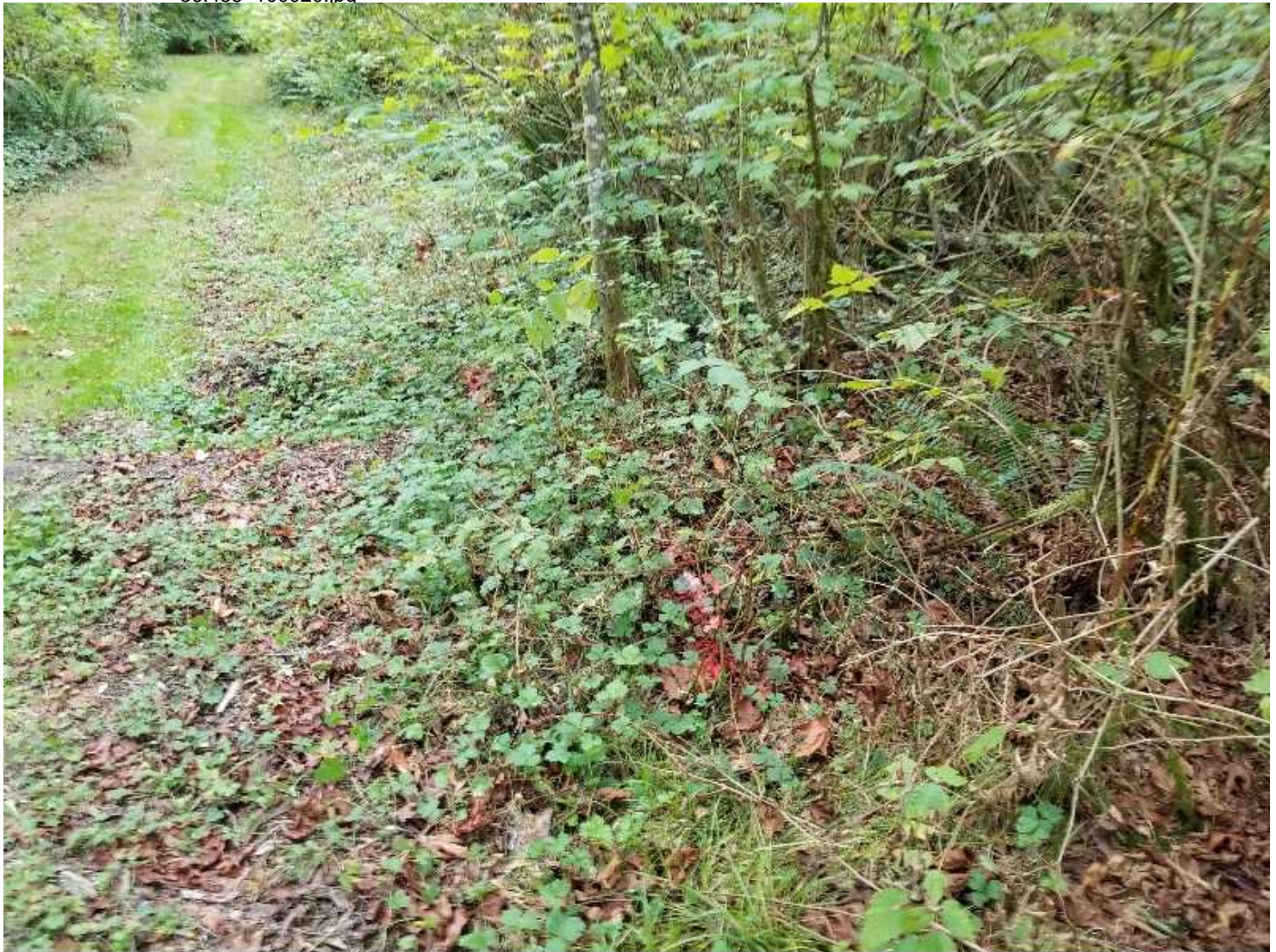
Property of United States Infrastructure Corporation Photo created on 10/03/2019 09:34:54 AM PDT