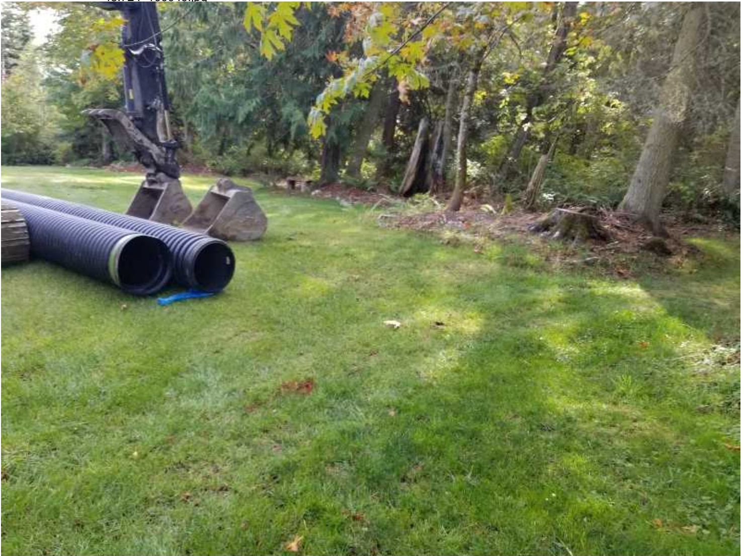
Property of United States Infrastructure Corporation Photo created on 10/02/2019 10:55:58 AM PDT