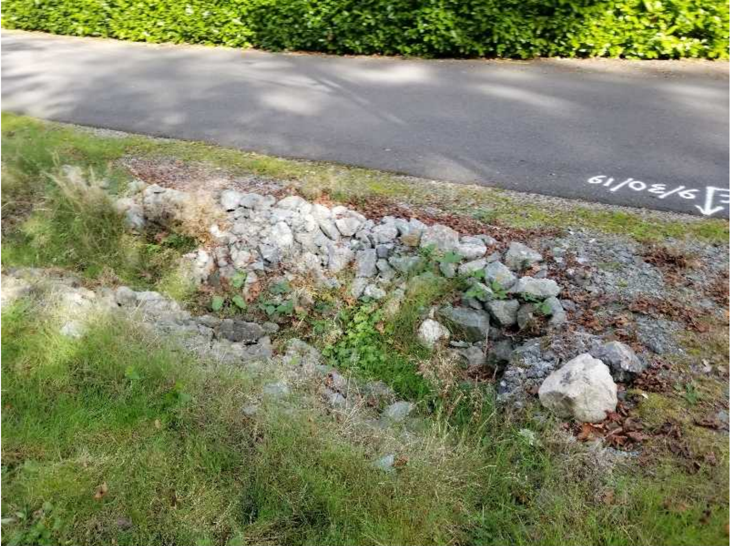
Photo created on 10/02/2019 10:30:40 AM PDT