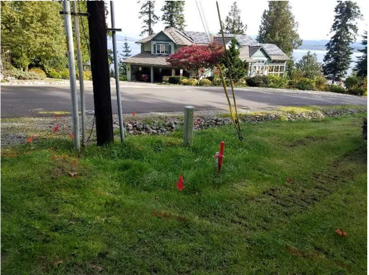
Property of United States Infrastructure Corporation Photo created on 10/02/2019 10:56:01 AM PDT