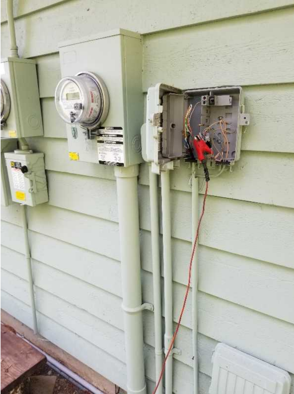
Property of United States Infrastructure Corporation Photo created on 10/02/2019 10:45:37 AM PDT