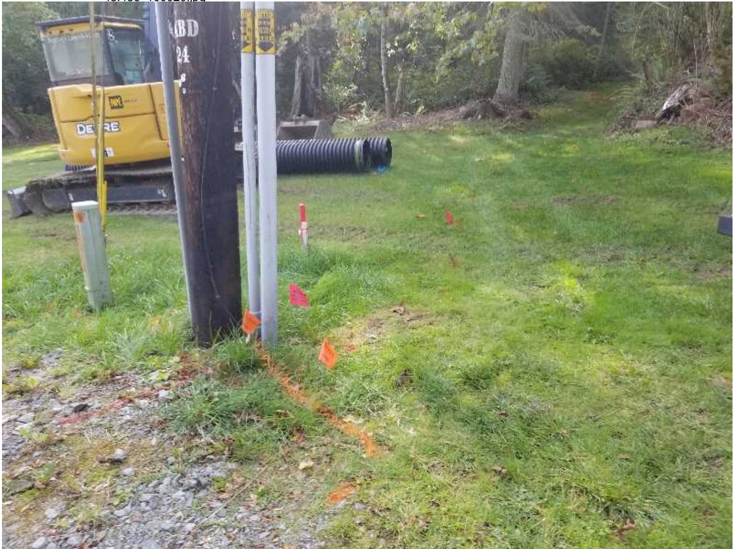
Photo created on 10/02/2019 10:52:17 AM PDT