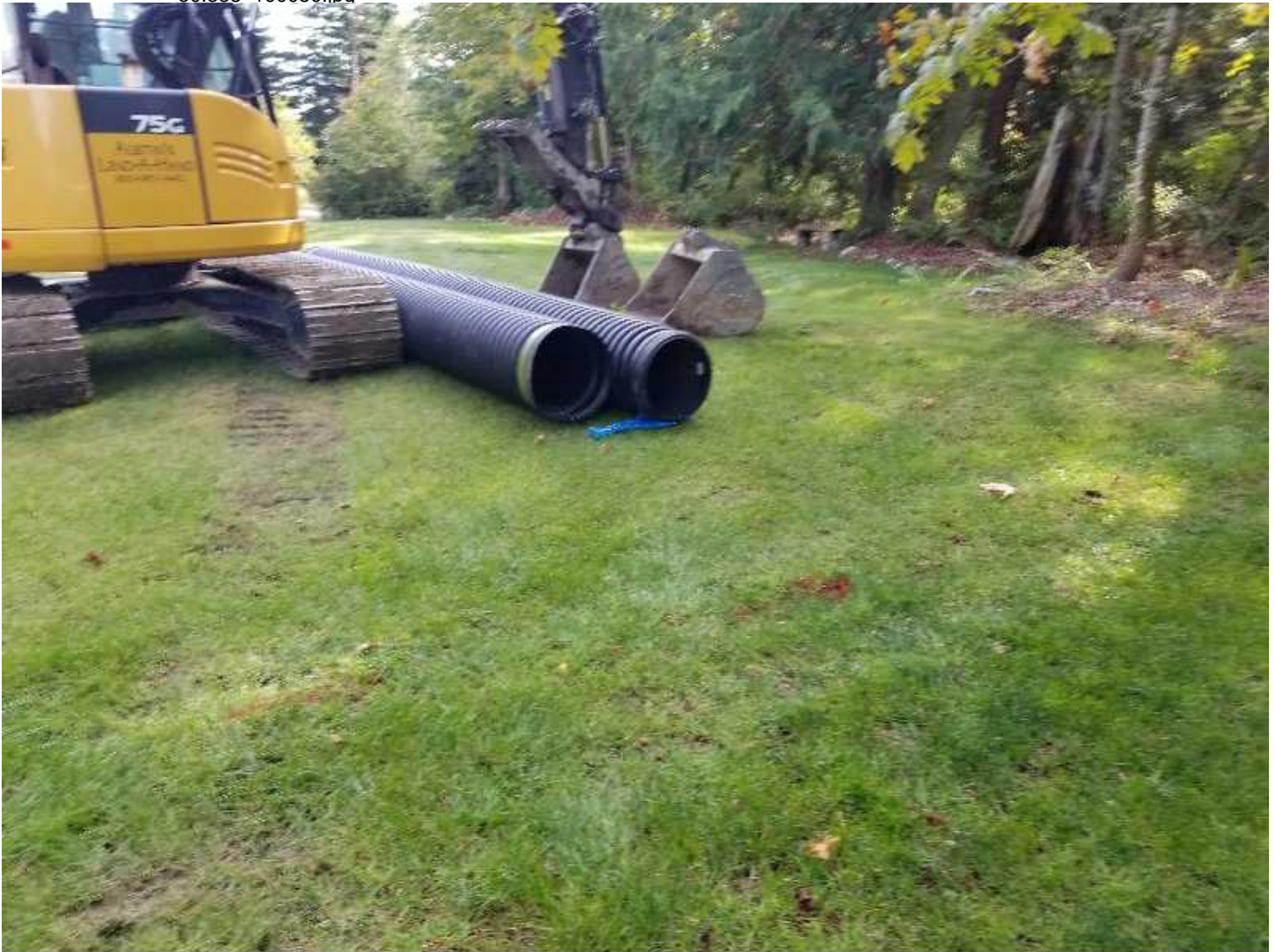
Photo created on 10/02/2019 10:55:59 AM PDT