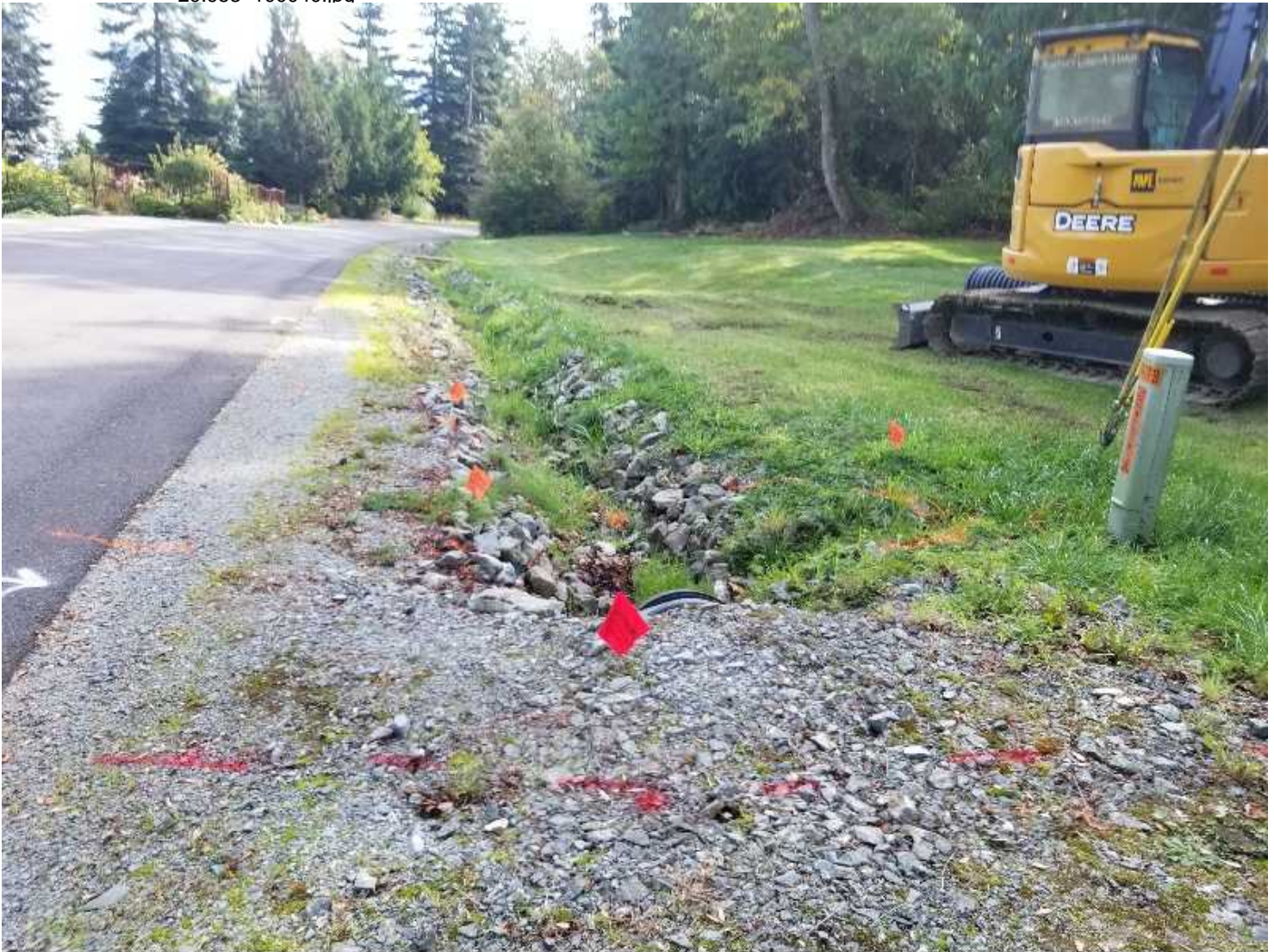
Photo created on 10/02/2019 10:52:30 AM PDT