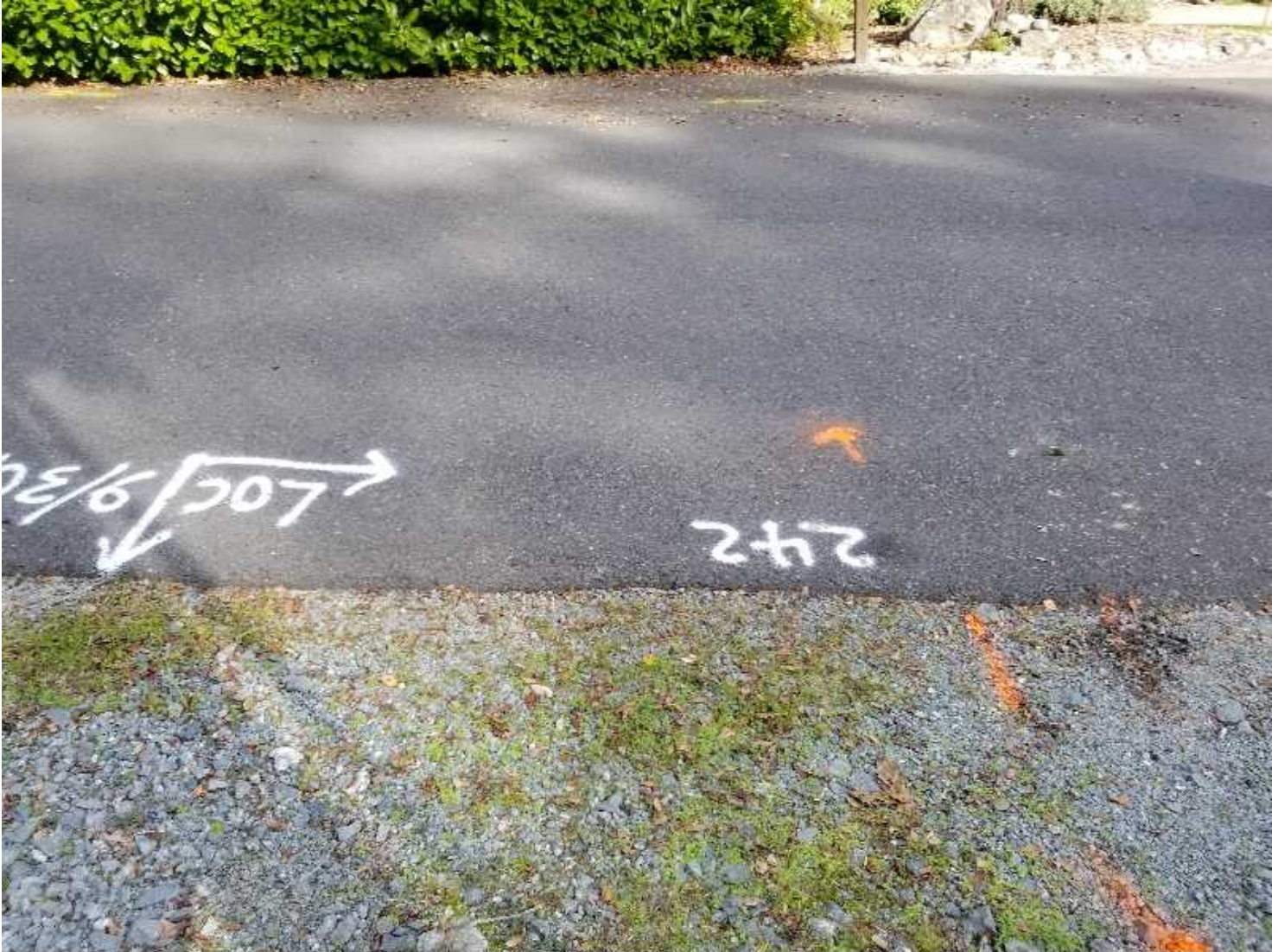
Photo created on 10/02/2019 10:52:24 AM PDT