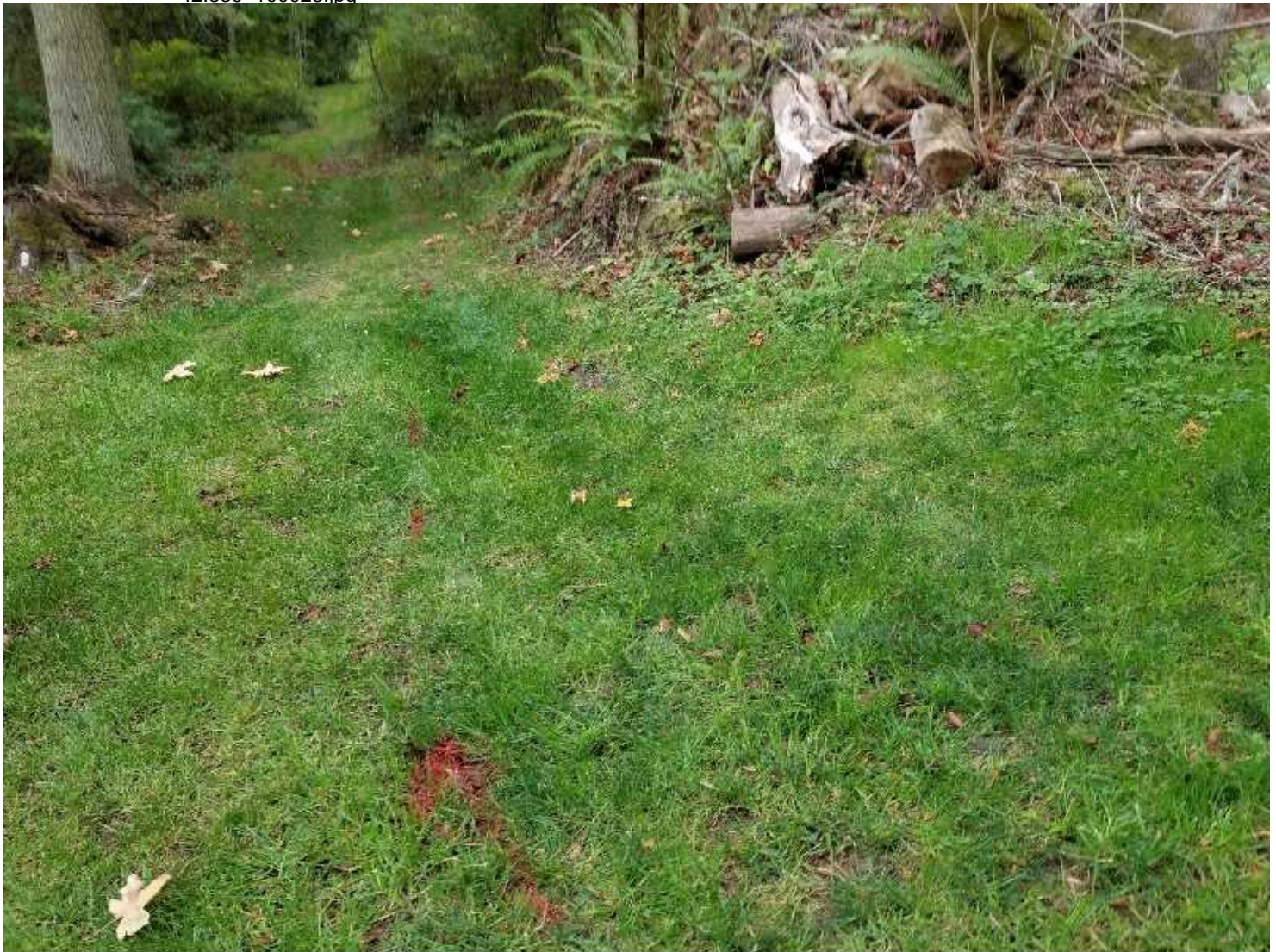
Property of United States Infrastructure Corporation Photo created on 10/03/2019 09:35:32 AM PDT