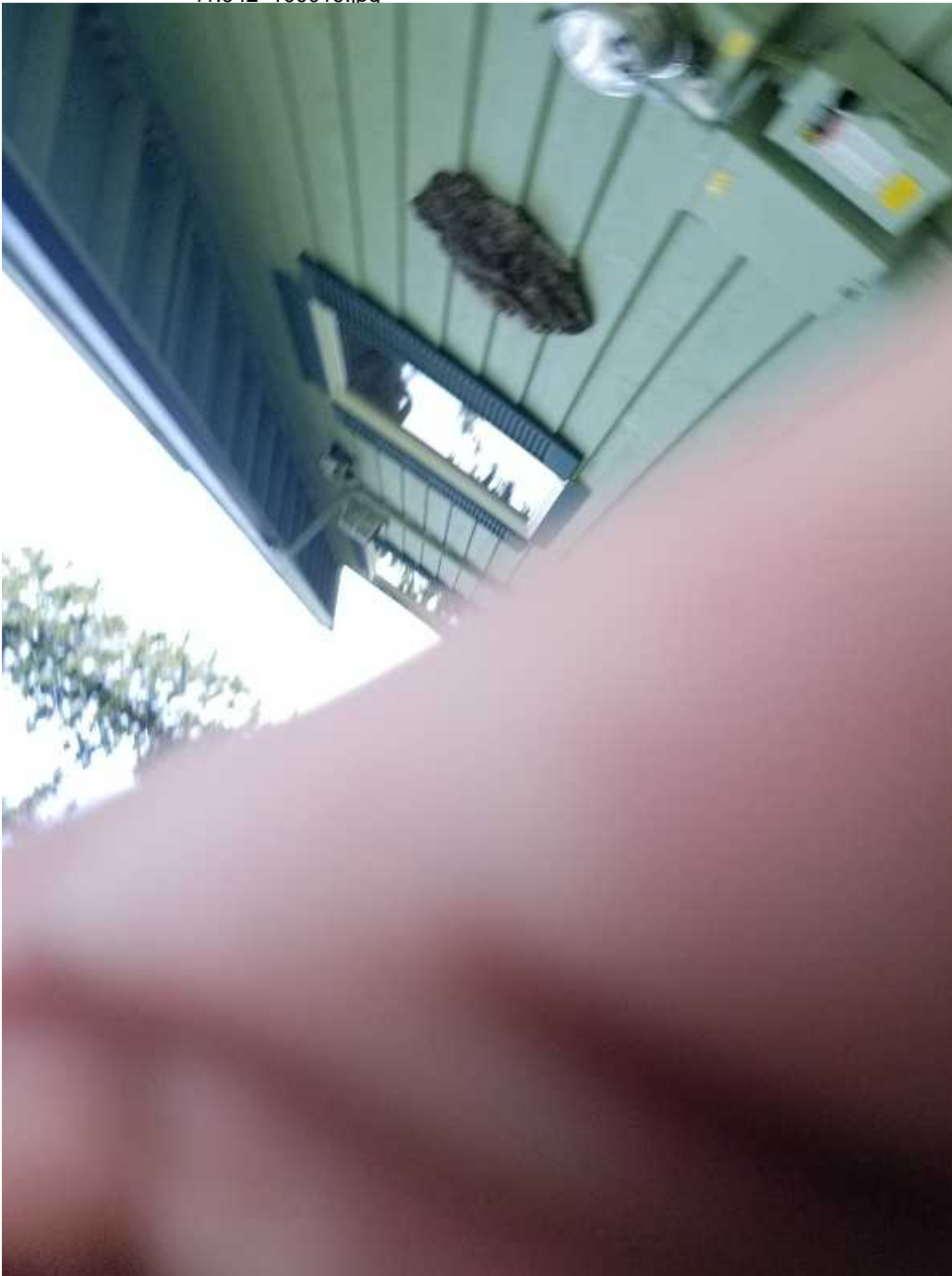
Property of United States Infrastructure Corporation Photo created on 10/02/2019 10:45:40 AM PDT