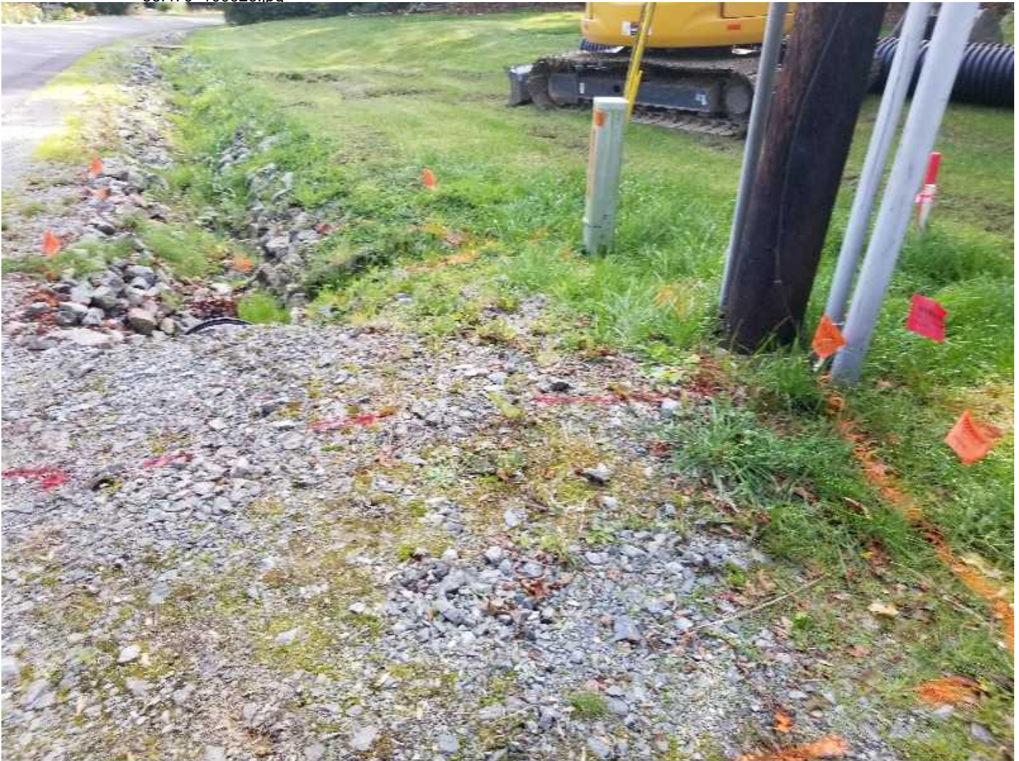
Property of United States Infrastructure Corporation Photo created on 10/02/2019 10:52:21 AM PDT