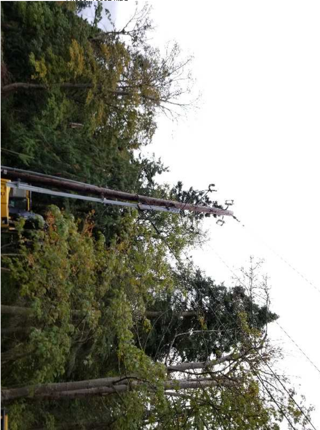
Property of United States Infrastructure Corporation Photo created on 10/03/2019 09:37:40 AM PDT