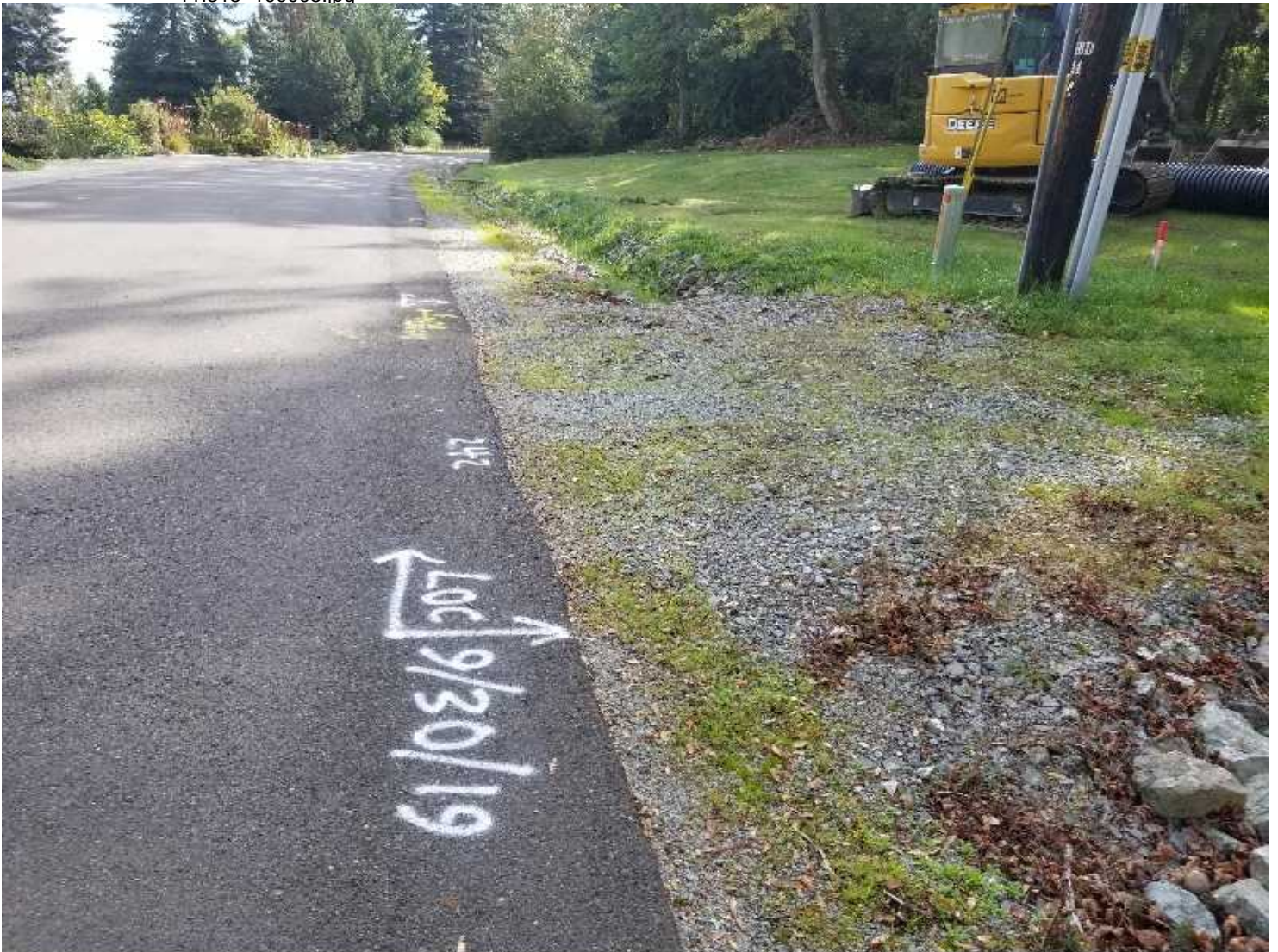
Property of United States Infrastructure Corporation Photo created on 10/02/2019 10:30:26 AM PDT