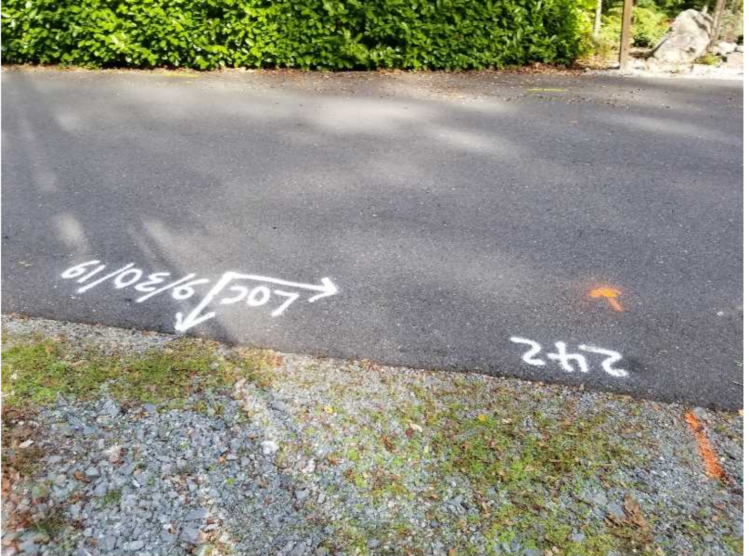
Photo created on 10/02/2019 10:52:25 AM PDT