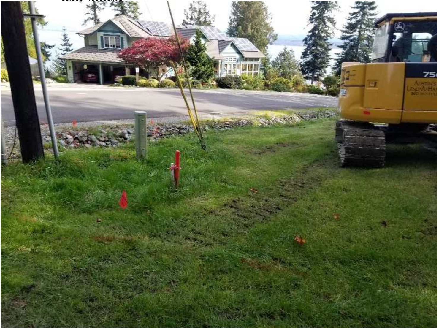
Property of United States Infrastructure Corporation Photo created on 10/02/2019 10:56:00 AM PDT