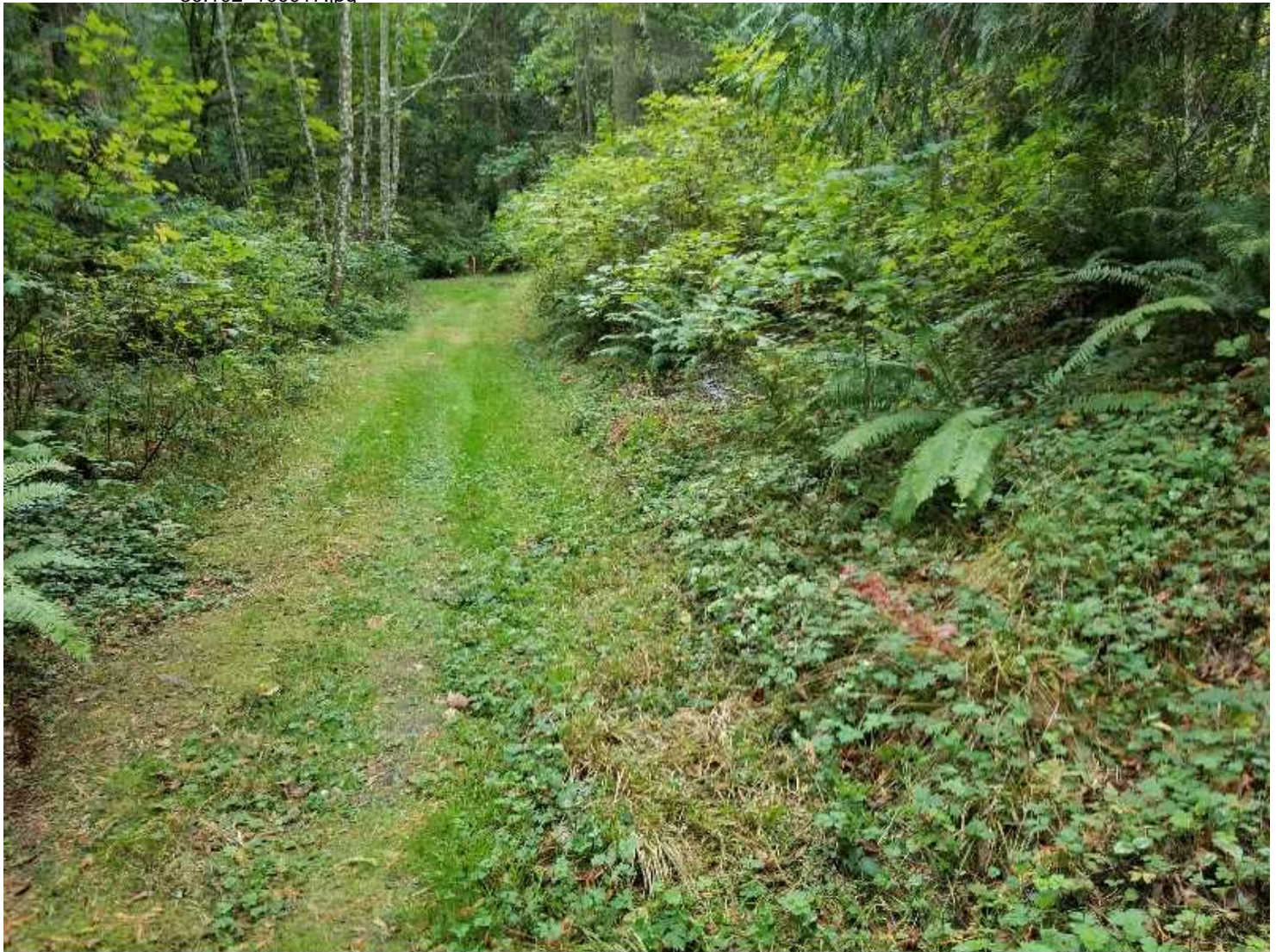
Property of United States Infrastructure Corporation Photo created on 10/03/2019 09:34:34 AM PDT