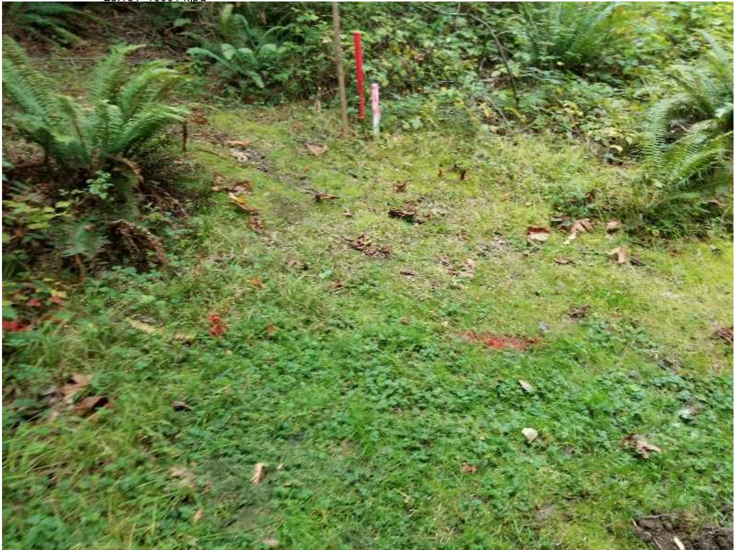
Property of United States Infrastructure Corporation Photo created on 10/03/2019 09:33:33 AM PDT