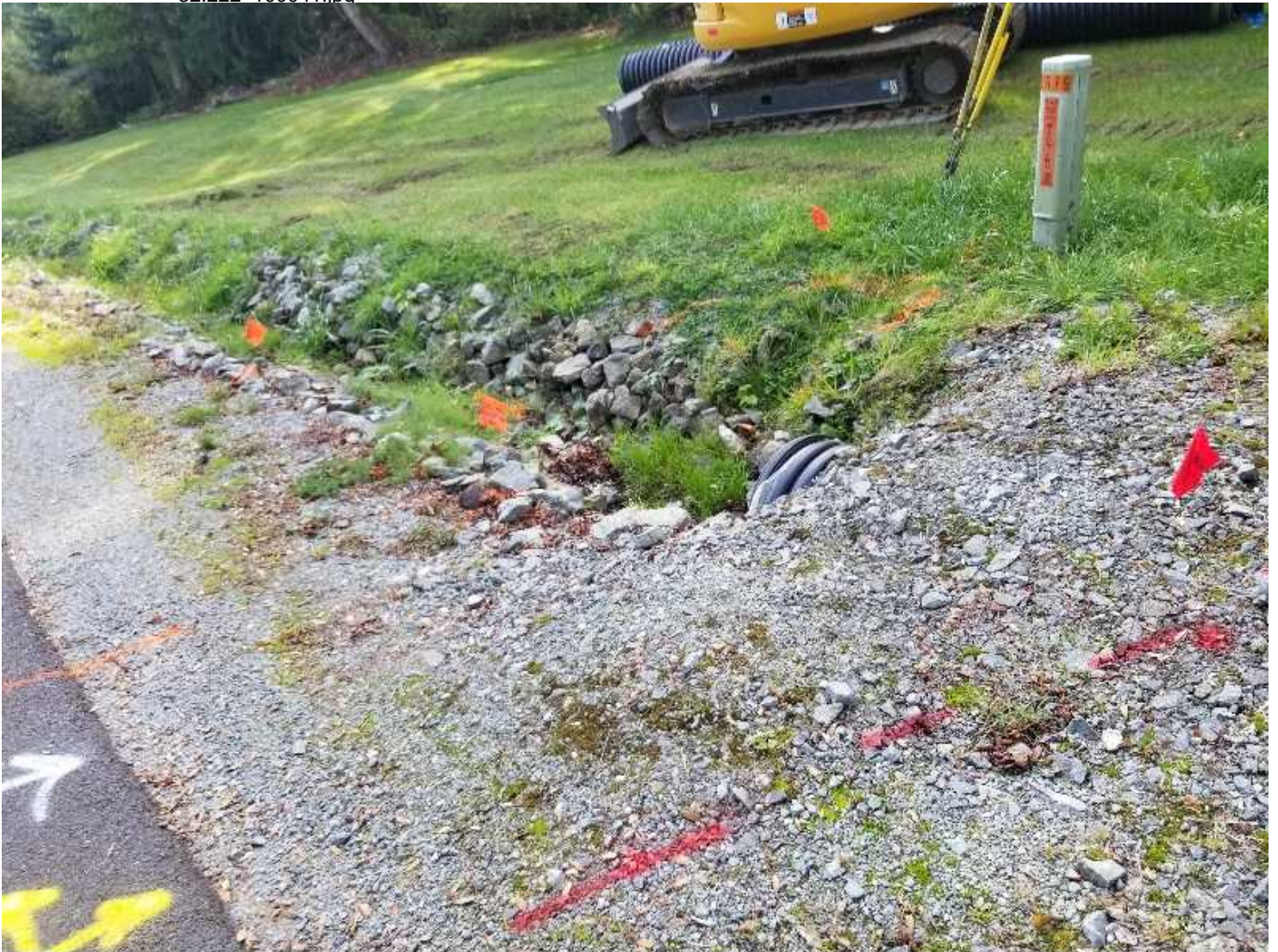
Property of United States Infrastructure Corporation Photo created on 10/02/2019 10:52:31 AM PDT