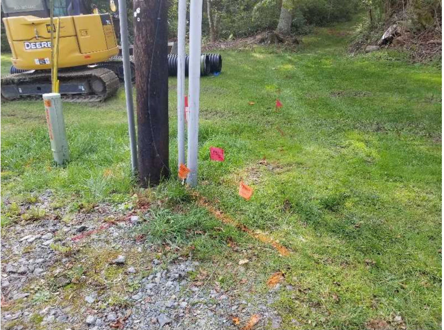
Photo created on 10/02/2019 10:52:19 AM PDT