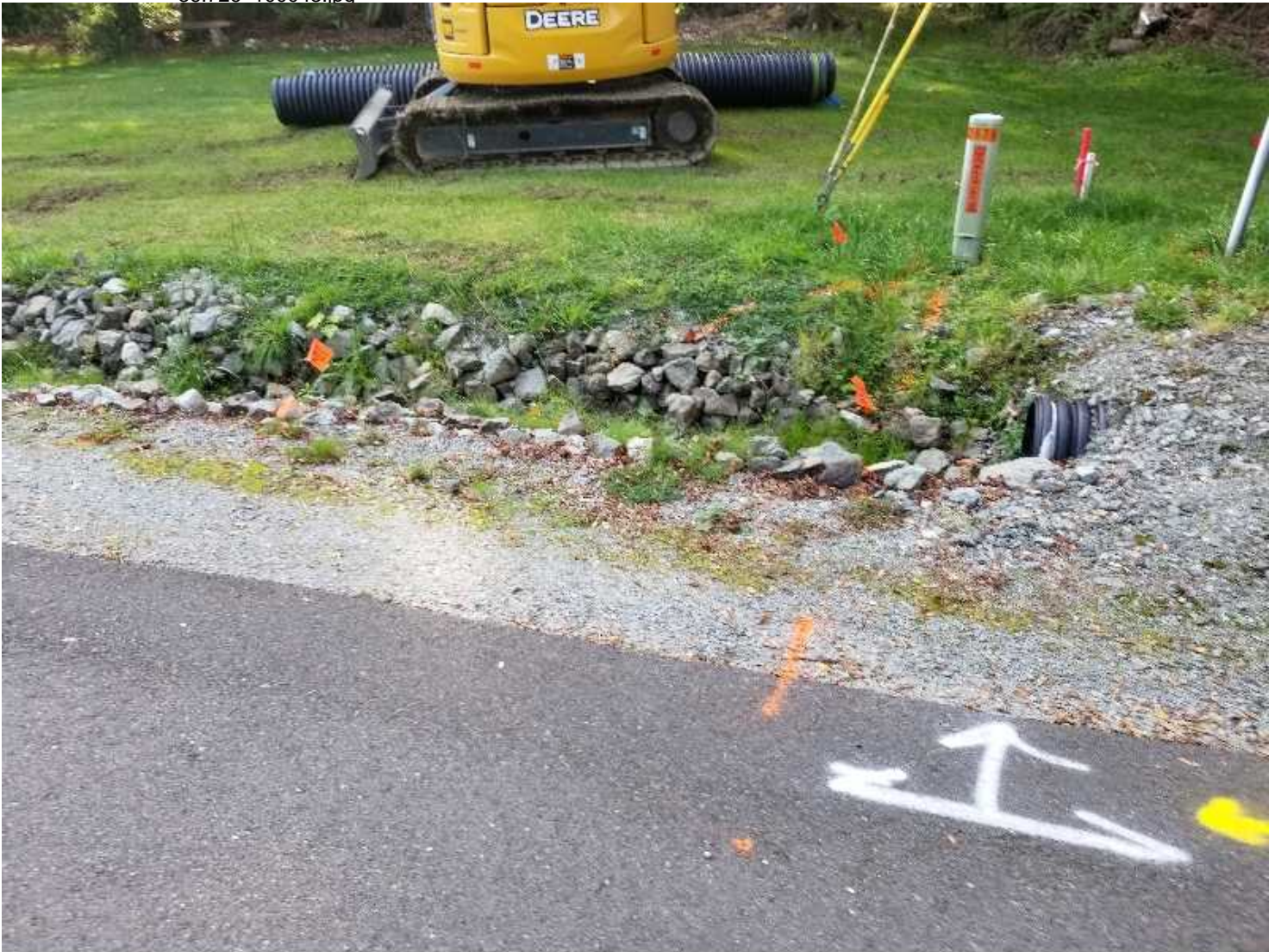
Photo created on 10/02/2019 10:52:35 AM PDT