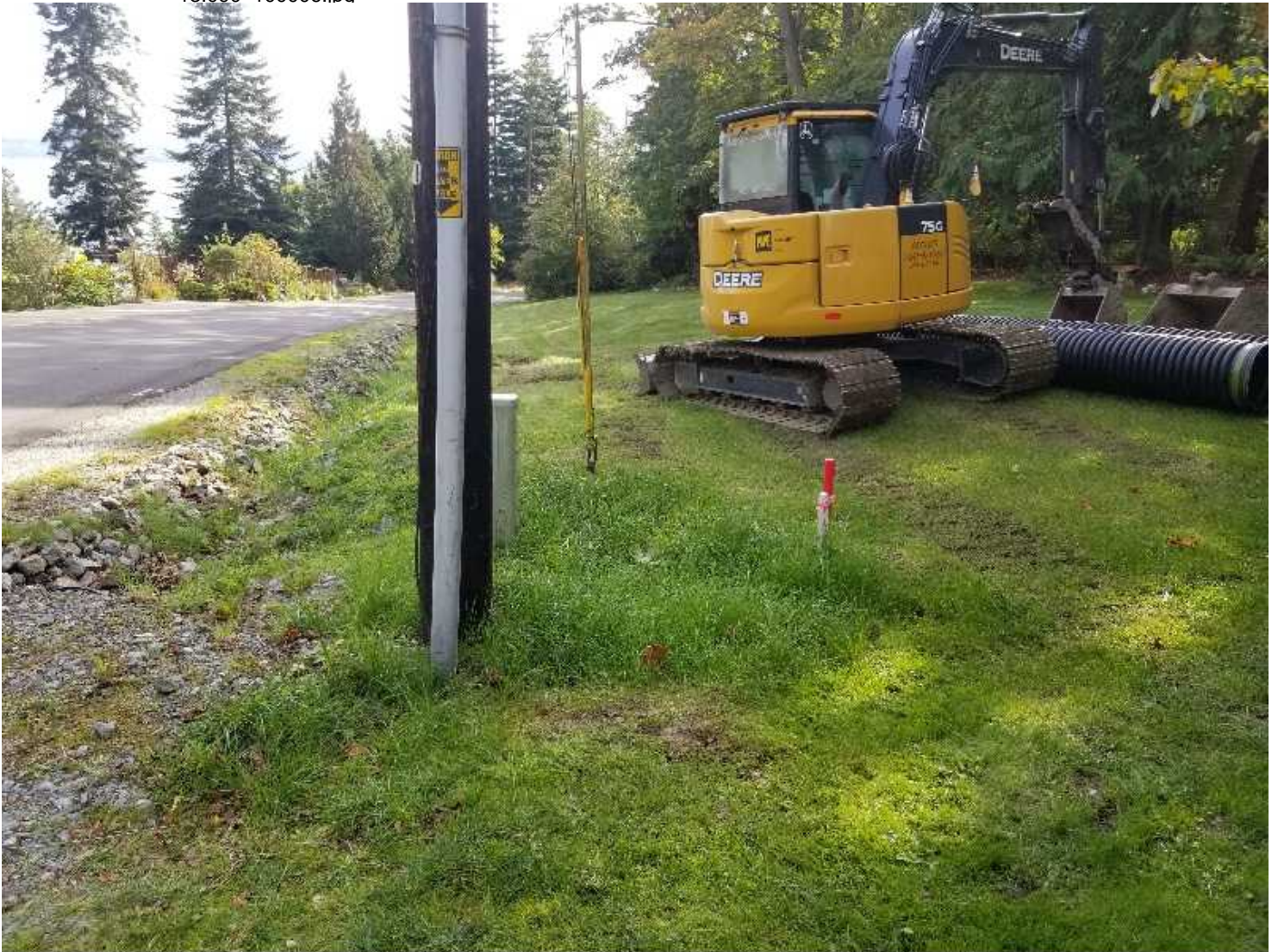
Property of United States Infrastructure Corporation Photo created on 10/02/2019 10:30:35 AM PDT