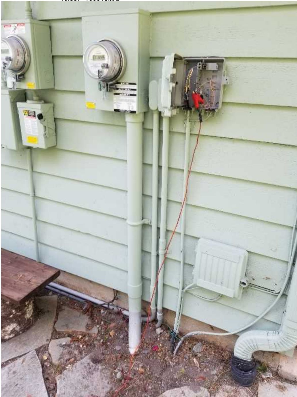
Photo created on 10/02/2019 10:45:38 AM PDT