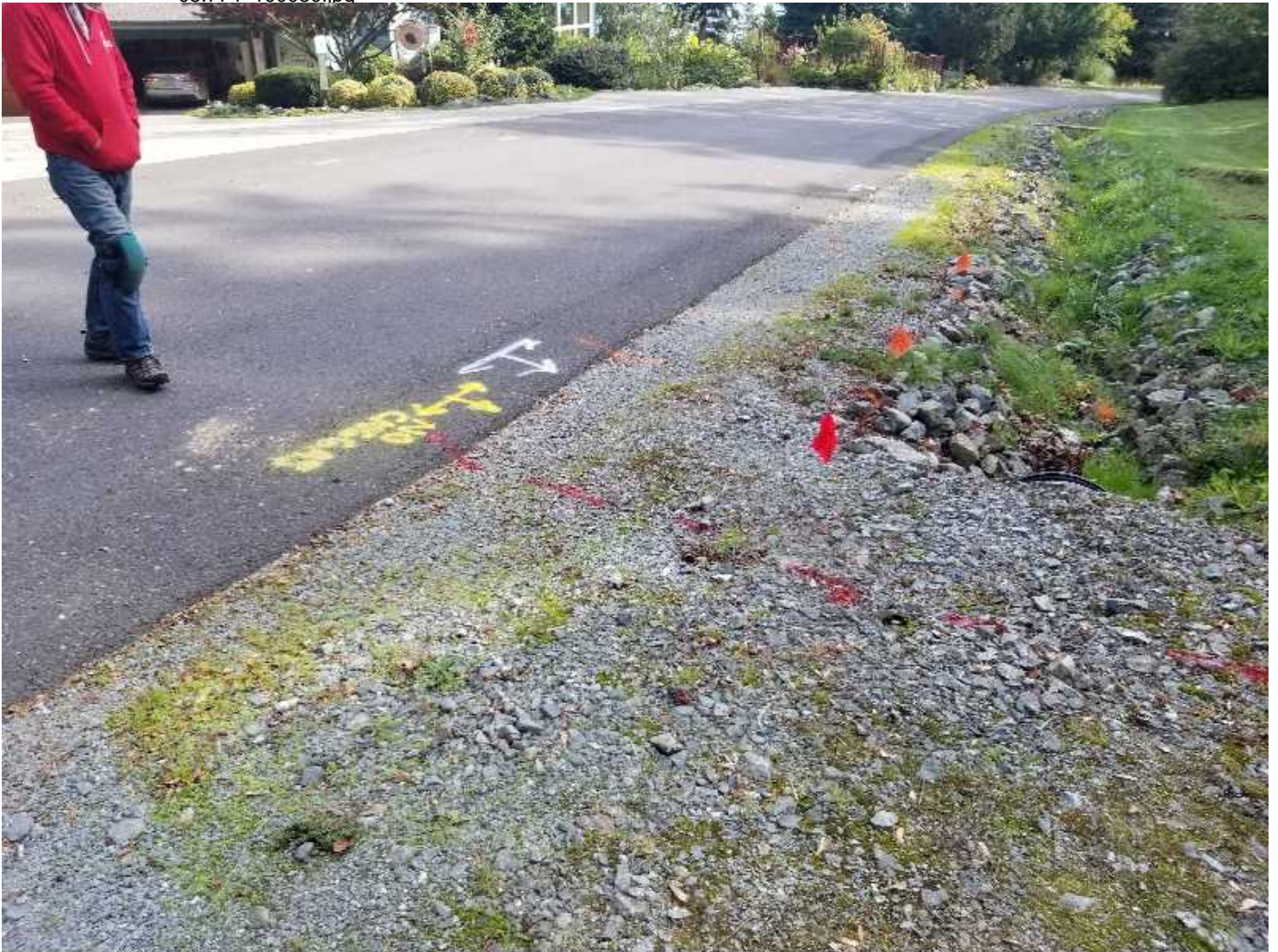
Property of United States Infrastructure Corporation Photo created on 10/02/2019 10:52:22 AM PDT