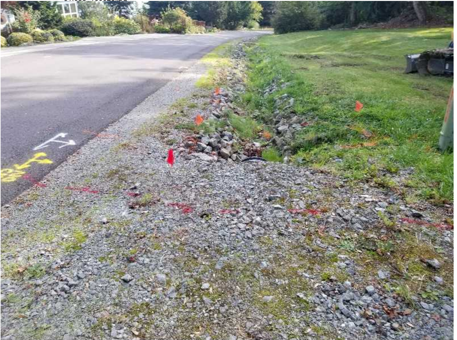
Property of United States Infrastructure Corporation Photo created on 10/02/2019 10:52:21 AM PDT