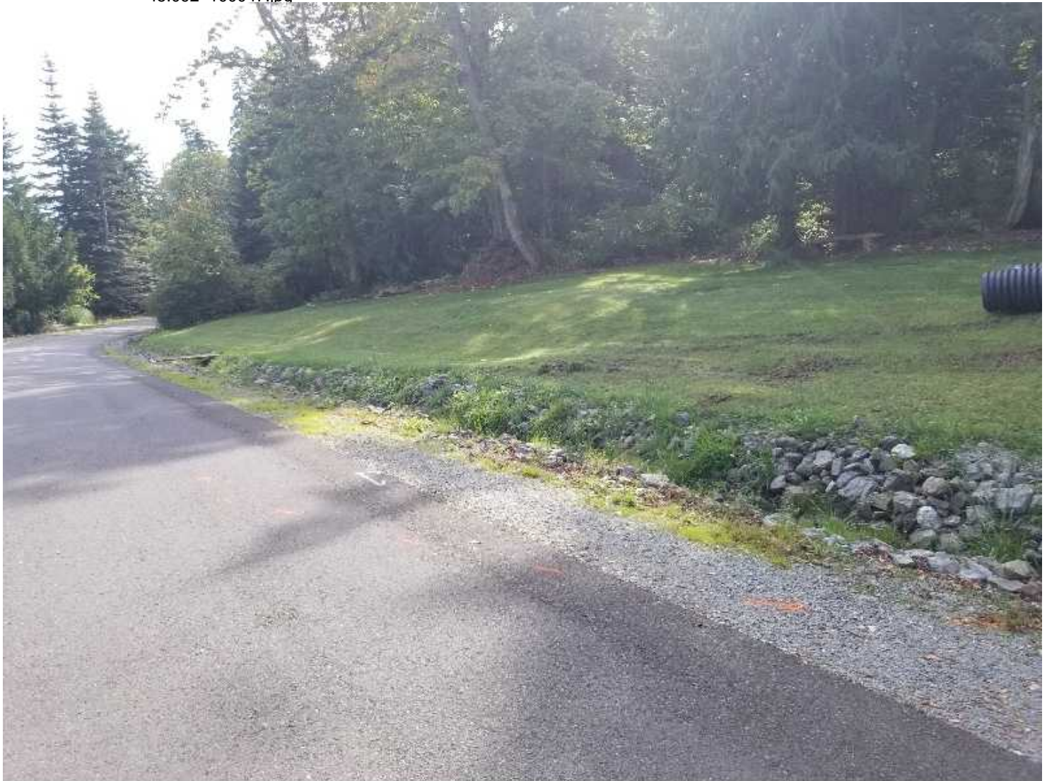
Photo created on 10/02/2019 10:52:36 AM PDT