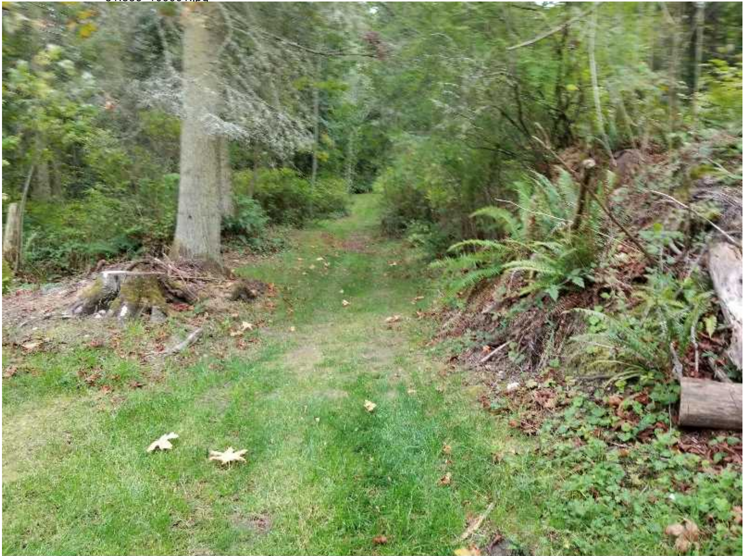
Photo created on 10/03/2019 09:22:07 AM PDT