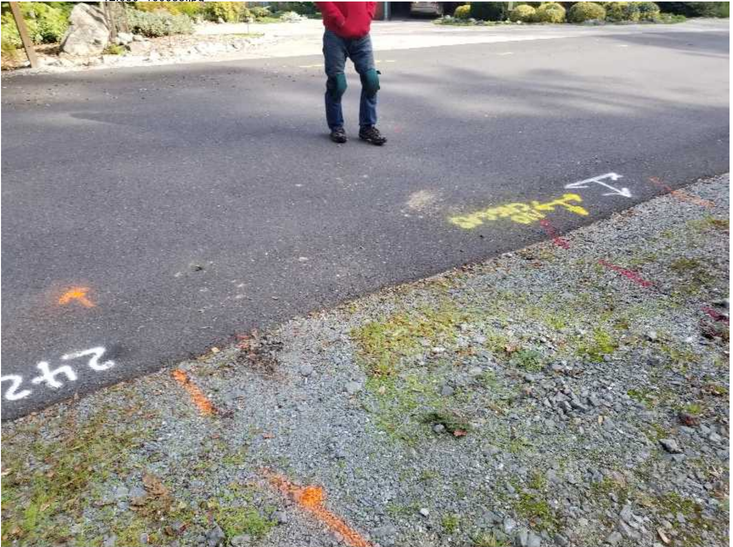
Property of United States Infrastructure Corporation Photo created on 10/02/2019 10:52:23 AM PDT