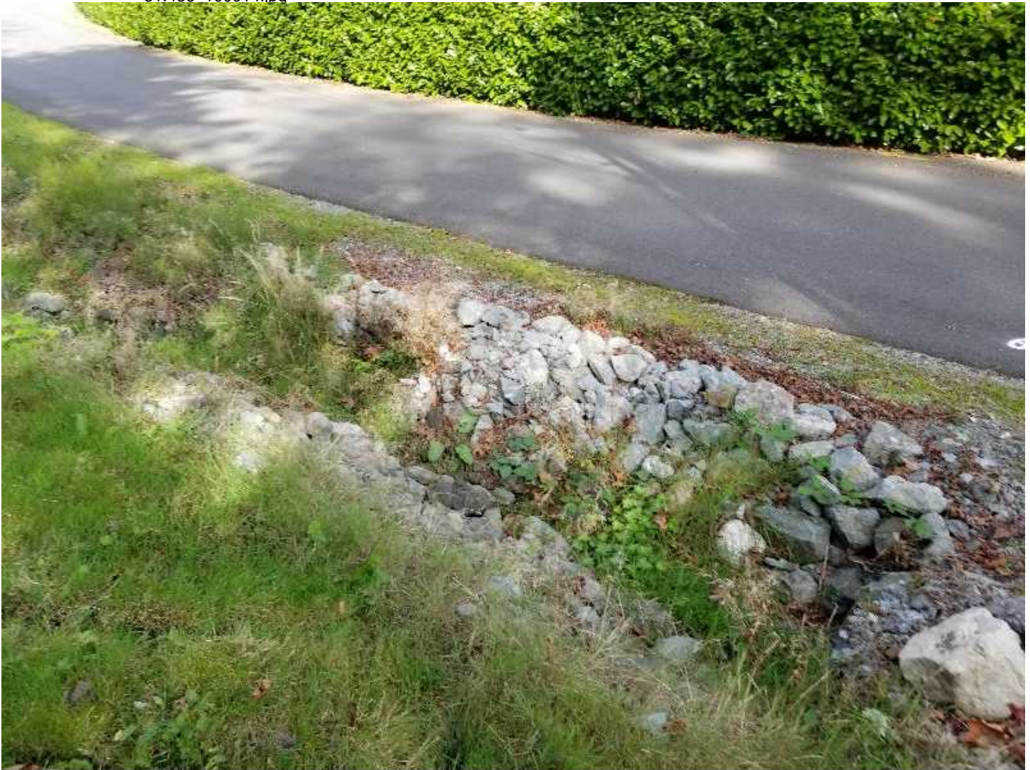
Property of United States Infrastructure Corporation Photo created on 10/02/2019 10:30:40 AM PDT