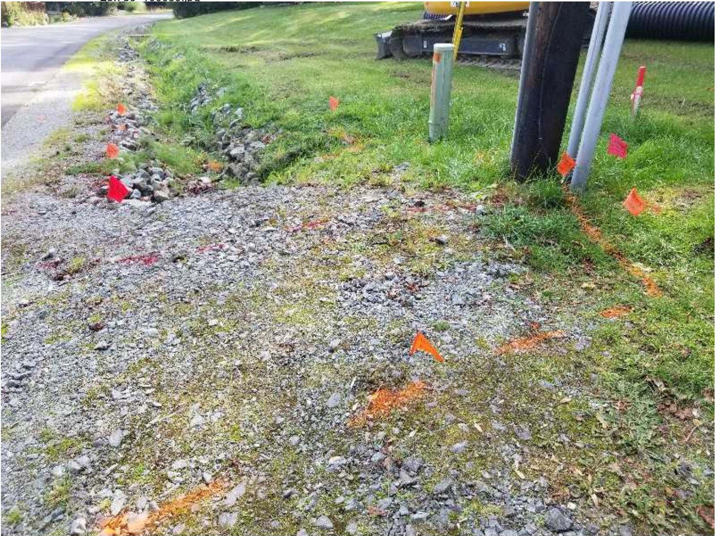
Photo created on 10/02/2019 10:52:27 AM PDT