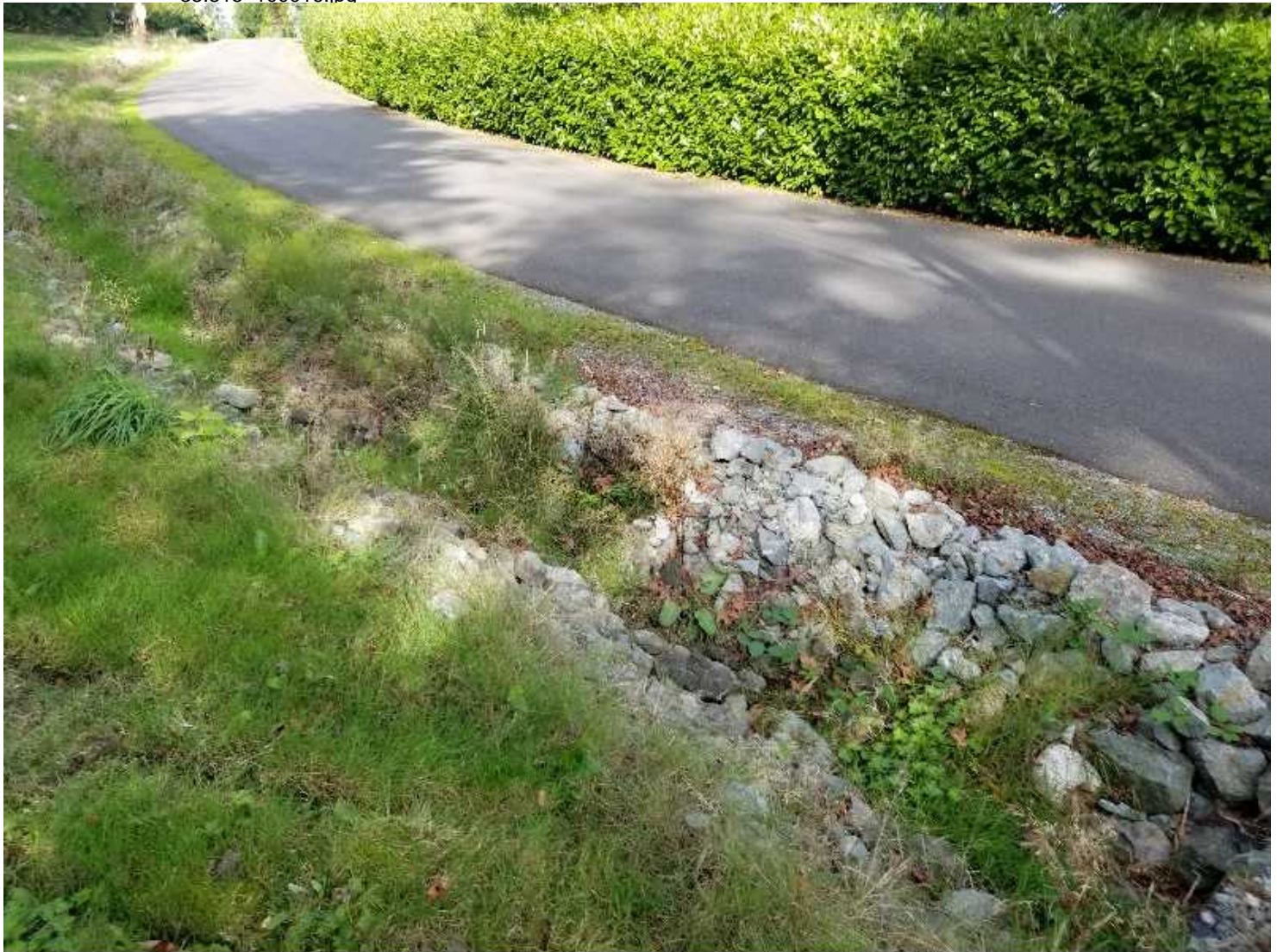
Photo created on 10/02/2019 10:30:40 AM PDT