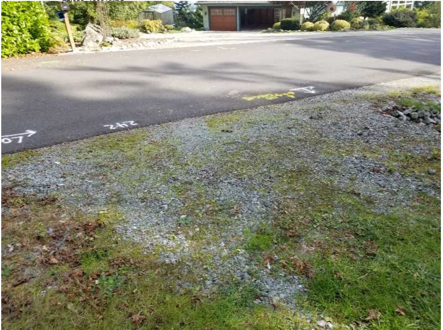
Property of United States Infrastructure Corporation Photo created on 10/02/2019 10:30:37 AM PDT