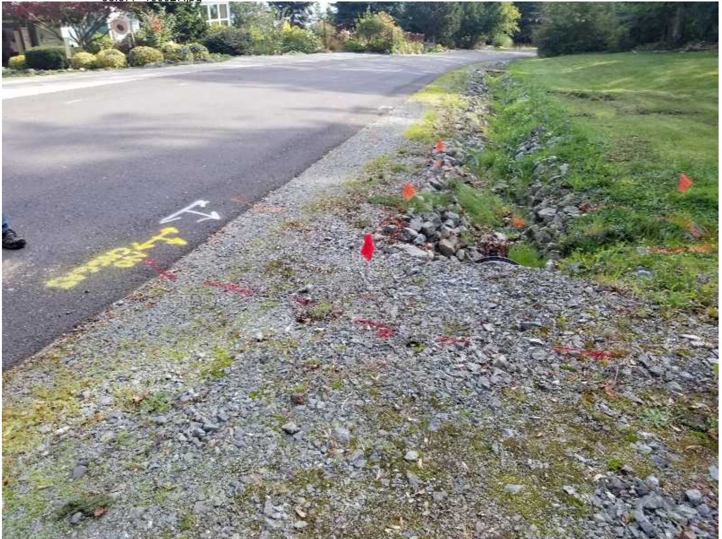
Photo created on 10/02/2019 10:52:22 AM PDT