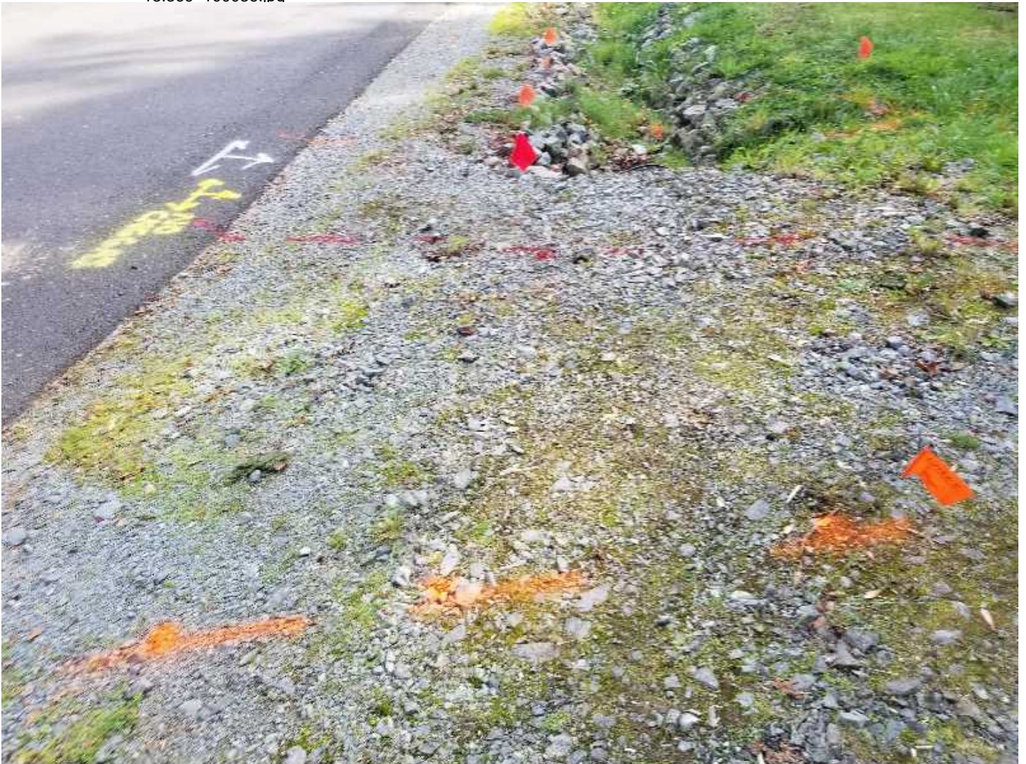
Property of United States Infrastructure Corporation Photo created on 10/02/2019 10:52:27 AM PDT