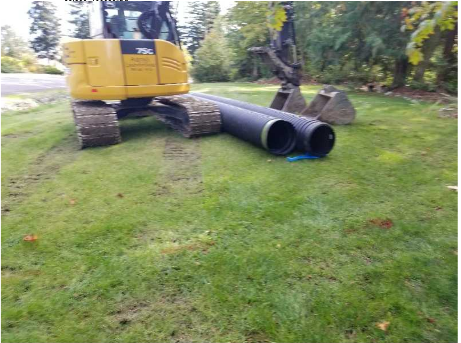
Photo created on 10/02/2019 10:55:59 AM PDT