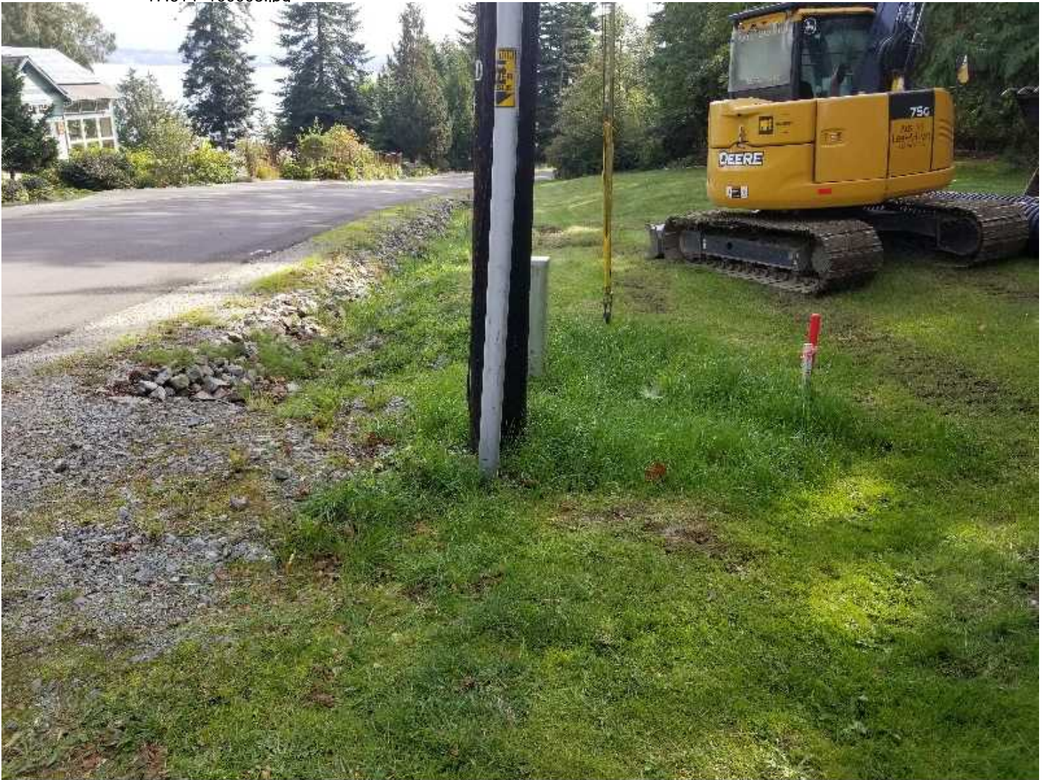
Property of United States Infrastructure Corporation Photo created on 10/02/2019 10:30:36 AM PDT