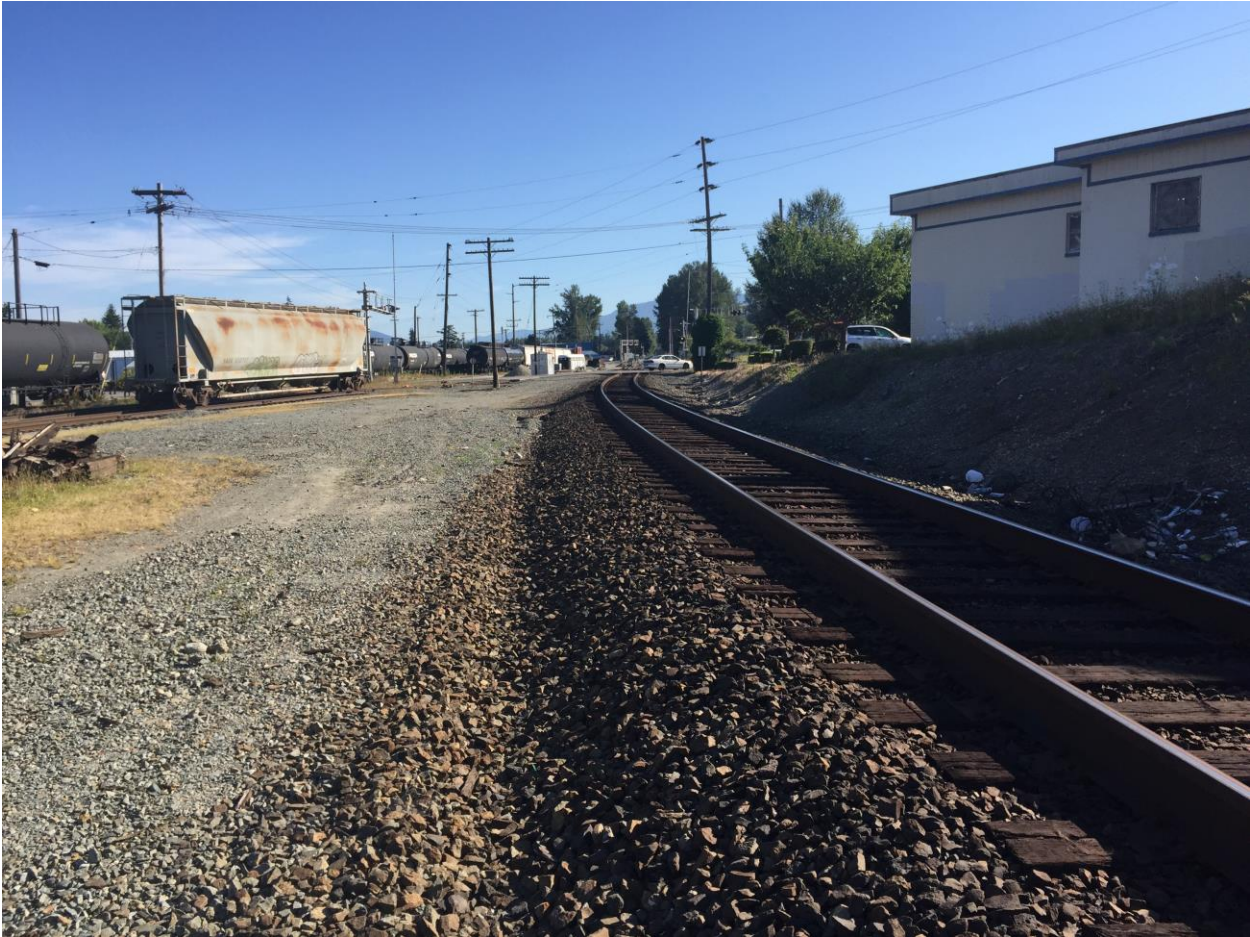
TR-190028 (1) Facing North Toward Accident Site.