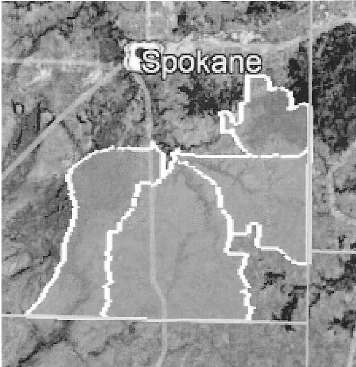
EXHIBIT B PROPOSED SERVICE AREA