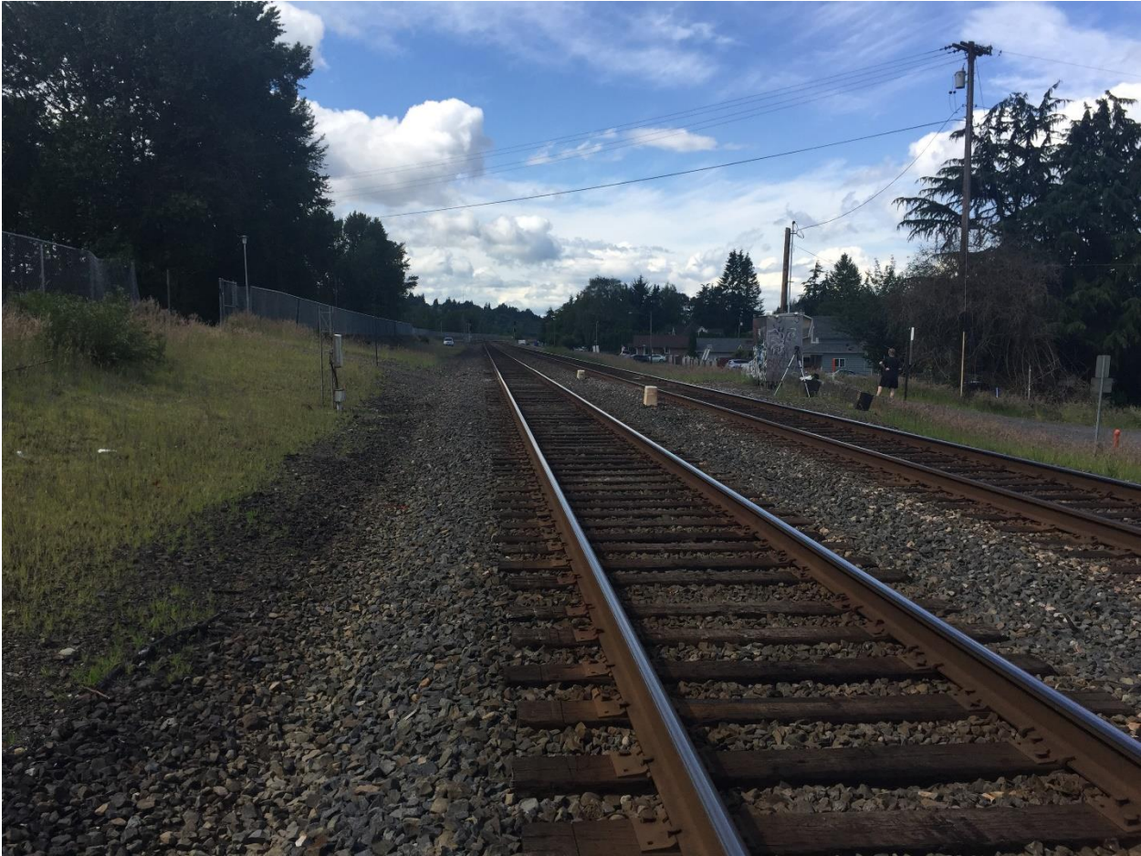
TR-180741 (1) Facing North Toward Accident Site.