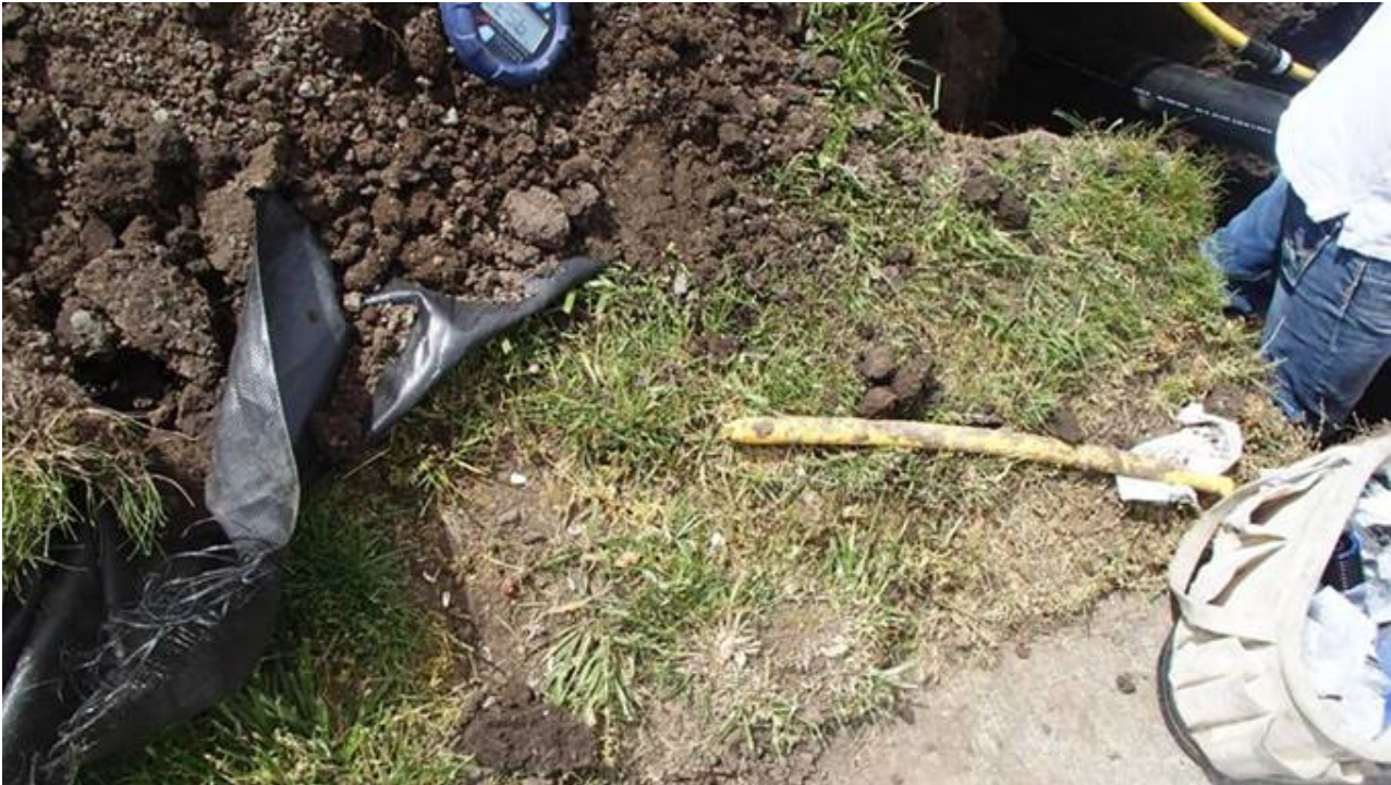
Picture #7 Close up of faded locate mark just to the east of the damage location.