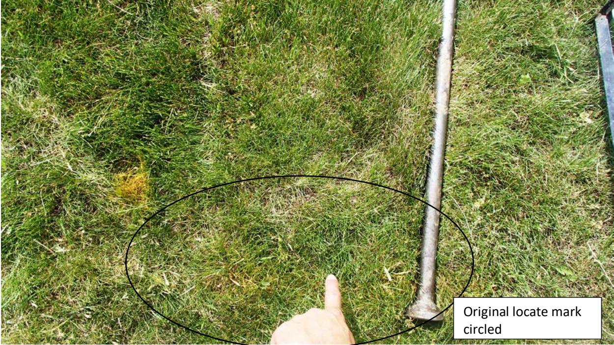
Picture #5 Another view of the faded locate mark west of the damage in relation to the for sale sign.