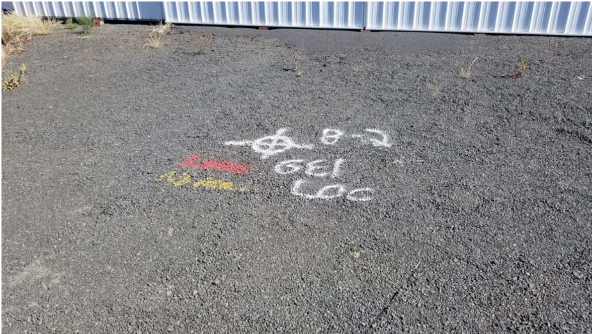
Typical Locate Mark w/ gas and electric OK's (as observed upon arrival on-site 6/12/18 at 9:15 am)