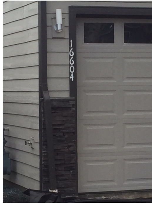
16604 133 Street SE