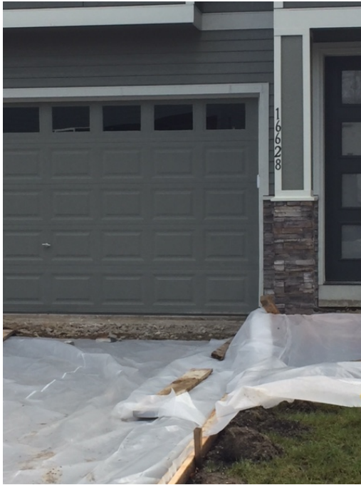
16628 133 Street SE