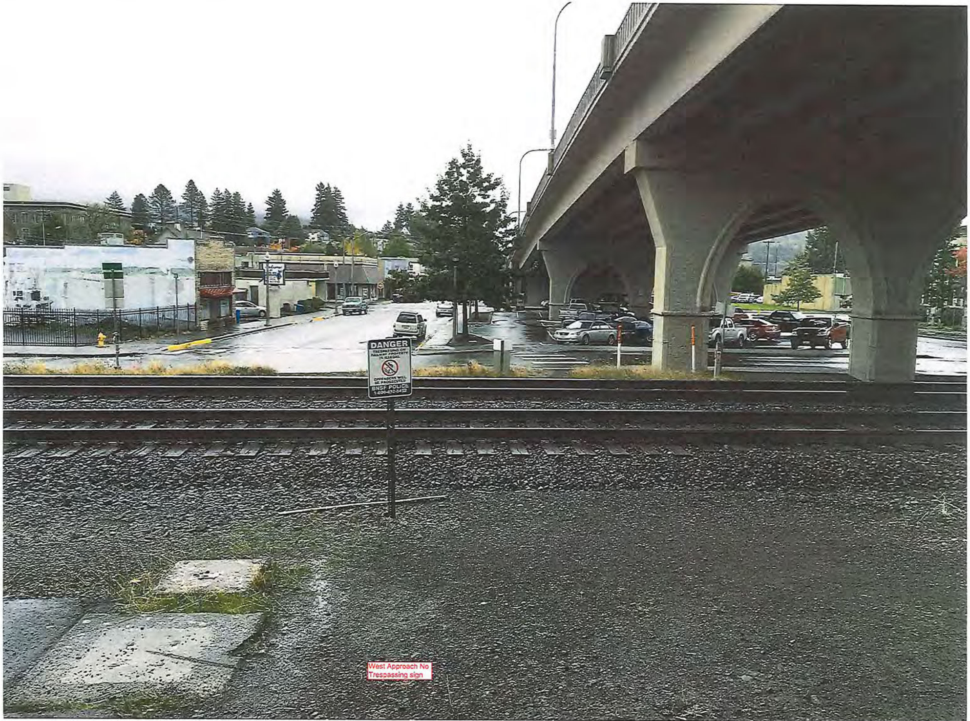
West Approach No Trespassing sign