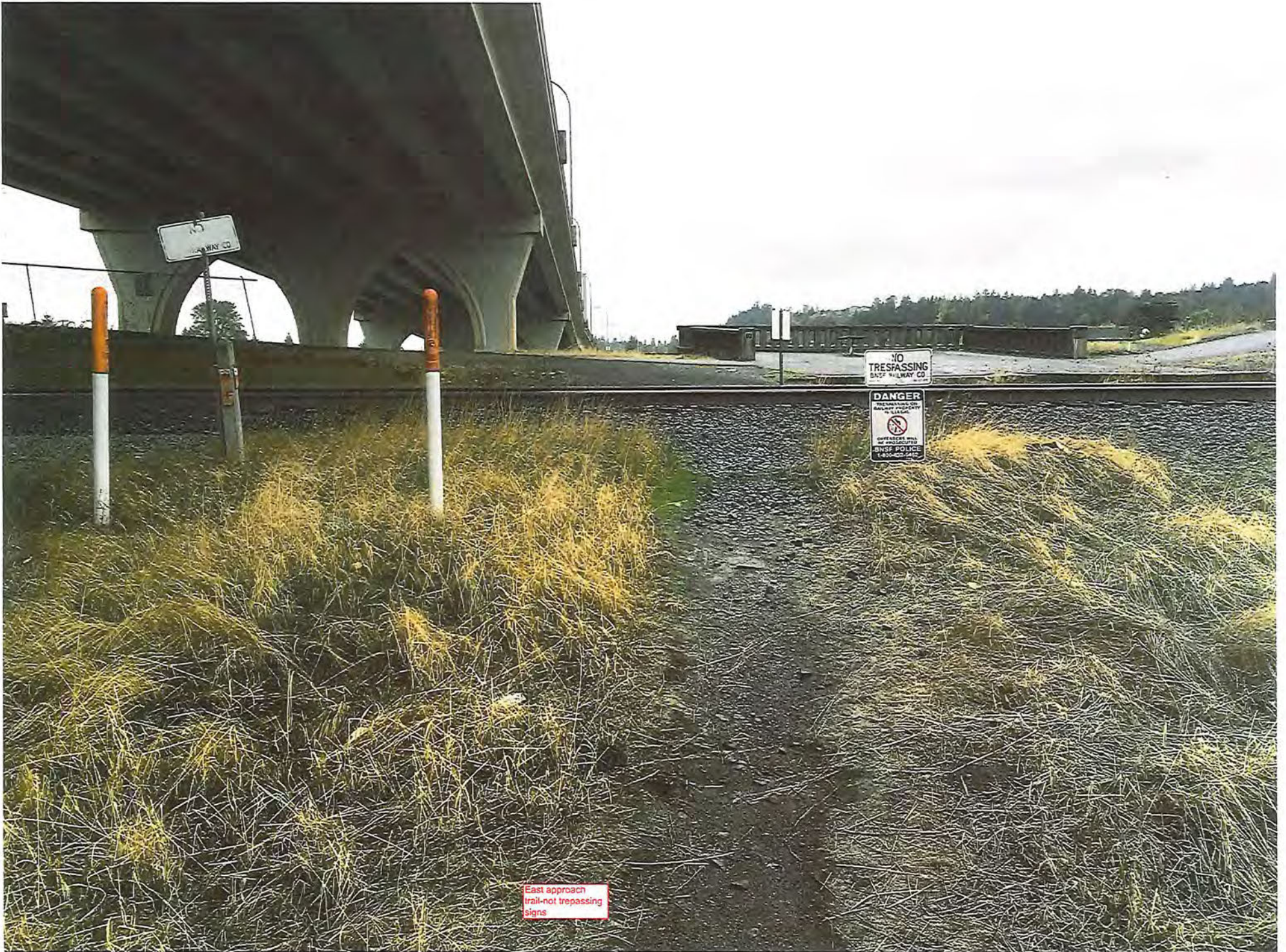
East approach trail-not trespassing signs