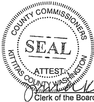
Clerk of the Board