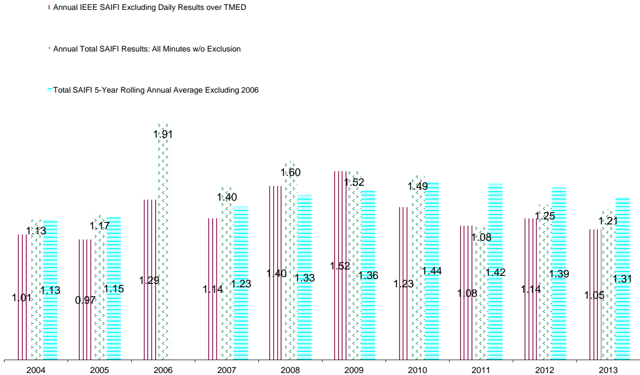
Chart 1: 2004-2013 AVA SAIFI Performance in Different Measurements by Year