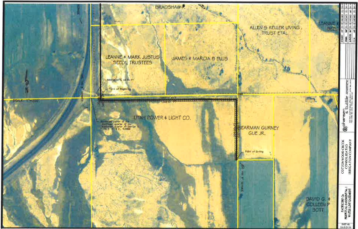
EXHIBIT "A" – Page 2 of 2