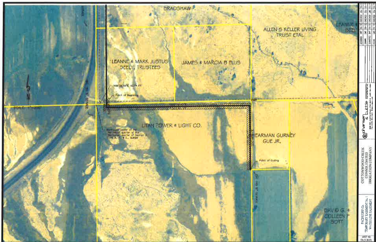
EXHIBIT A - Page 2 of 2