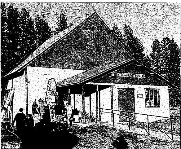
A group of volunteers helped paint the Usk Community Center to commemorate the 10th anniversary of the 9/11 attacks.

WEDNESDAY, SEPTEMBER 21 WACANID Bike Ride: International Selkirk Loop Rotary Club: 7:15 a.m. - Old-town Rotary Park Newport TOPS: 9 a.m. - Newport Eagles Fiber Arts Knitting and Spinning Group: 9 a.m. - Create Arts Center, Newport The Way We Worked Exhibit: 10 a.m. to 5 p.m. - Beardmore Building, Priest River Diabetes Support Group: 10 a.m. - Newport Lutheran Church Al-Anon: Noon - American Lutheran Church Pinocchio: 1 p.m. - Priest River Senior Center Food Preservation 101 Home Horticulture Workshop: 6-8 p.m. - Ponderay Event Center, Ponderay Priest River Animal Rescue: 6 p.m. - 1710 9th St., Priest River Priest River TOPS: 6 p.m. - Priest River Free Methodist Church Northern Panhandle Green Party: 6 p.m. - Friends Meeting House in Sandpoint York Rite of Freemasonry: 6:30 p.m. - Spirit Lake Temple Alcoholics Anonymous: 7 p.m. - Hospitality House in Newport