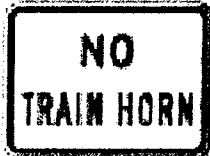
Figure 8B-5. Warning Signs