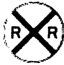
Figure 8B-2. Advance Warning Signs