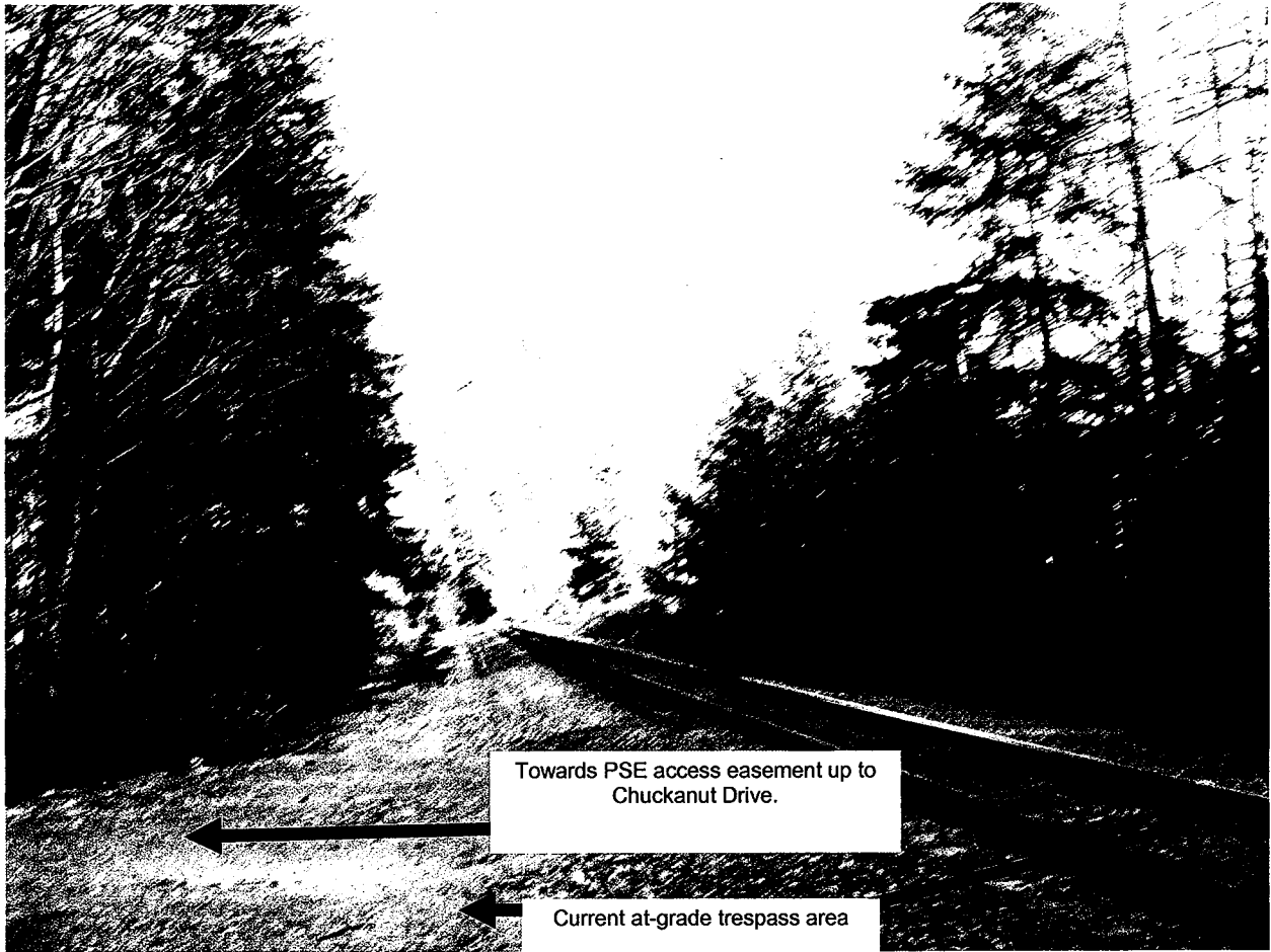
Viewing southerly at the crossing.