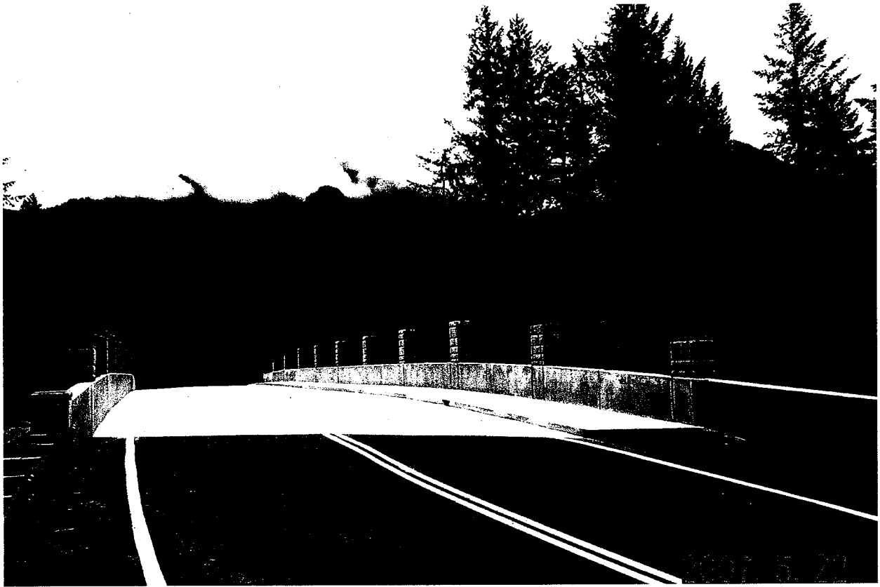
Viewing south at the new bridge deck.