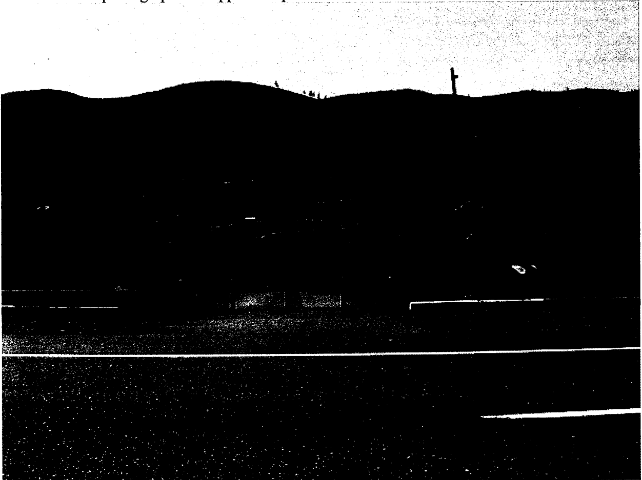
Viewing south across Highway 14 at pedestrian and administrative crossing; this photo was taken before BNSF added a spur line that starts just to the west (right) of the crossing.