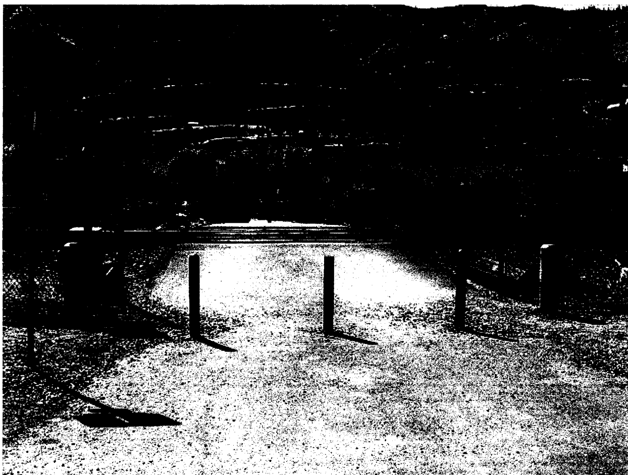
Close-up of previous view.