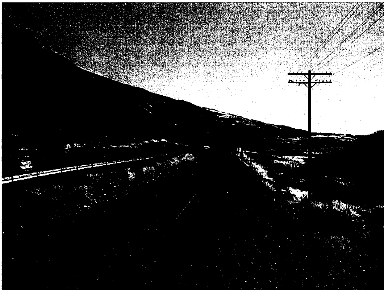
View of tracks to the east at the crossing.