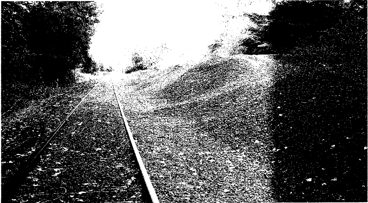
Photo 2: View of Milburn ballast pile site looking east toward Spooner Road Crossing (US DOT 848781E). On the right, one can see the motorcycle/ATV tracks that head toward the rail.