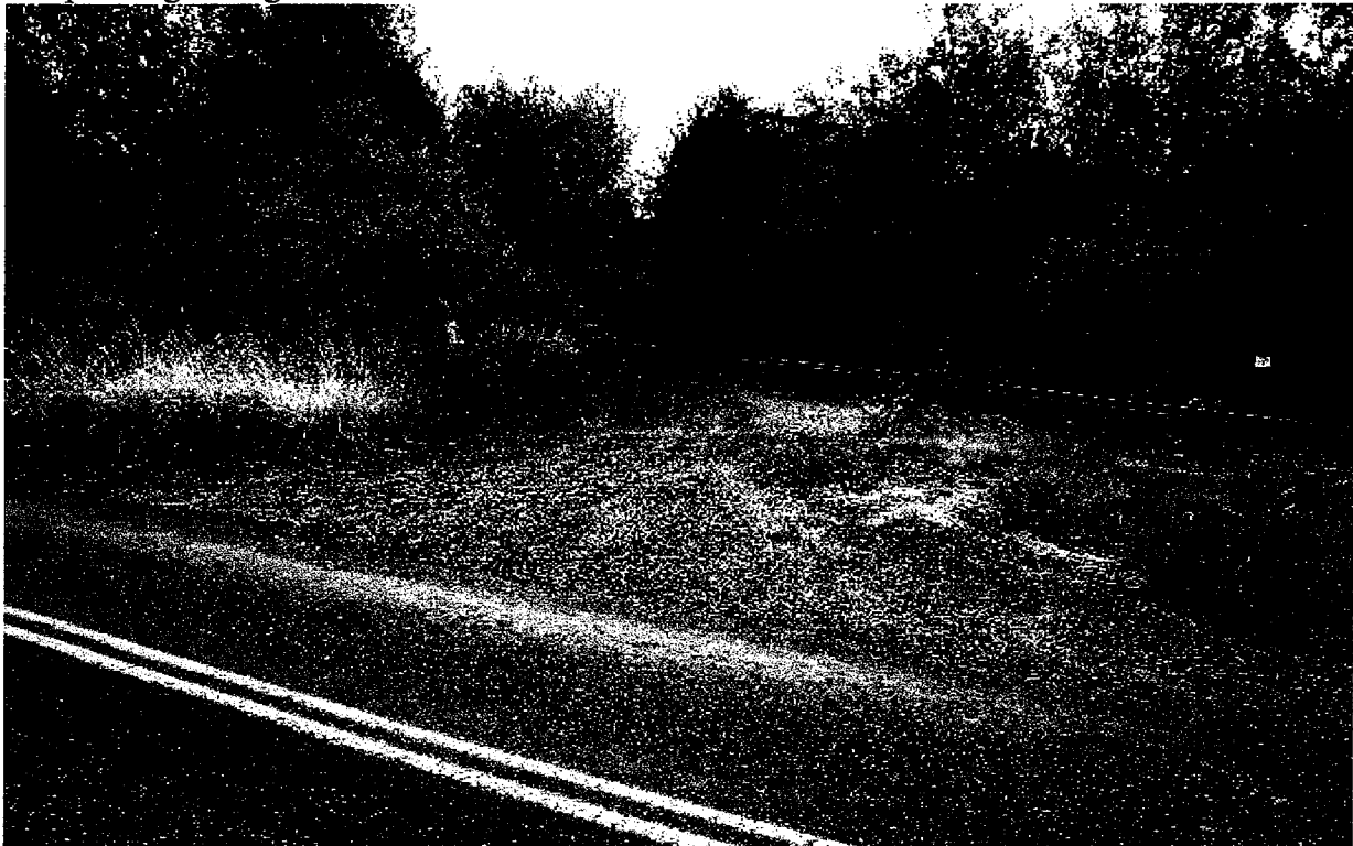
Photo 1: Unprotected entrance to Milburn ballast pile off of Spooner Road, (US DOT crossing #848781E) west of Adna, Washington.