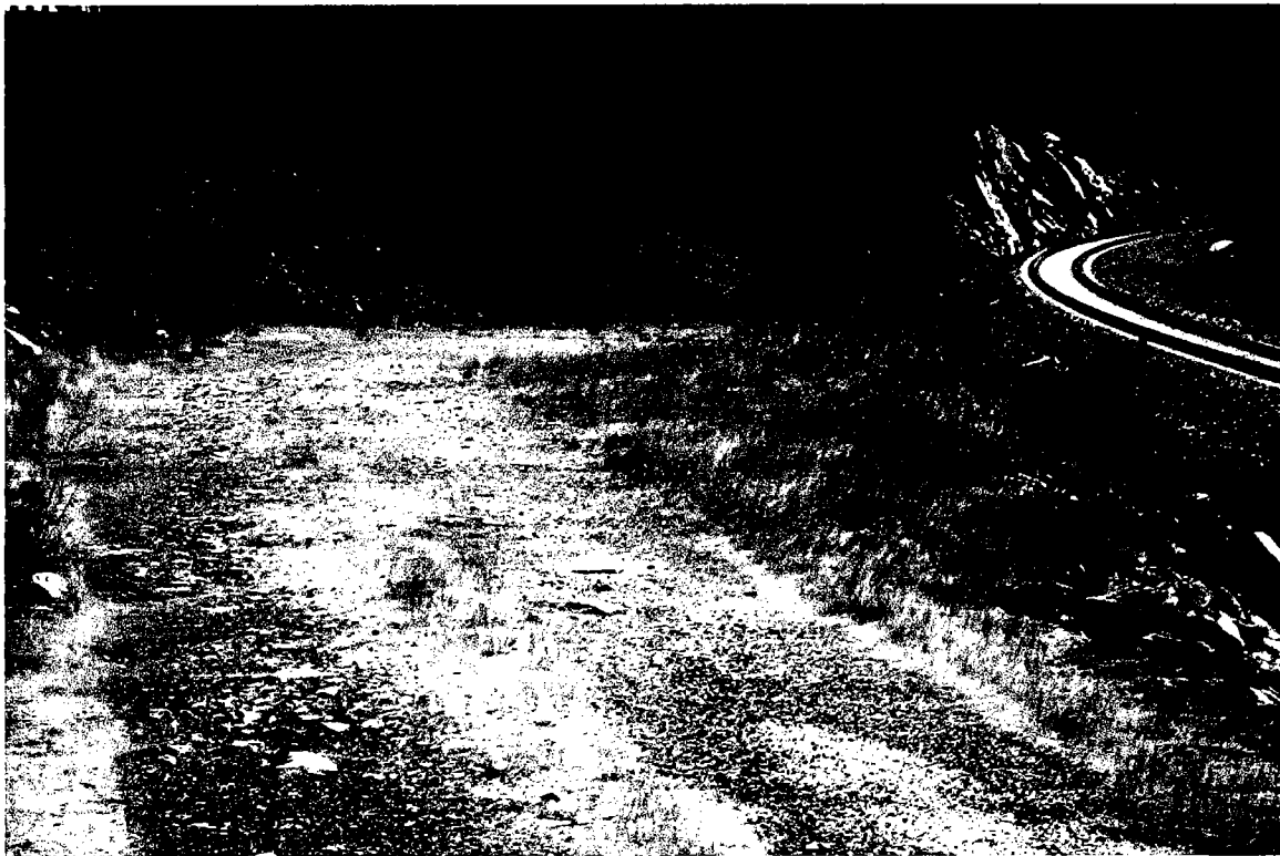
PARKING AREA MADE AVAILABLE BY OPEN ACCESS POINT