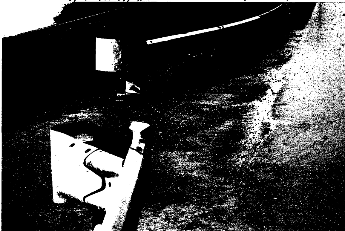
OPEN ACCESS BETWEEN GUARDRAIL SECTIONS