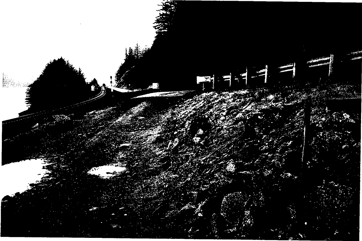
OPEN ACCESS TO RAILROAD RIGHT-OF-WAY FROM SR 14 NEAR HIGHWAY MILEPOST 51