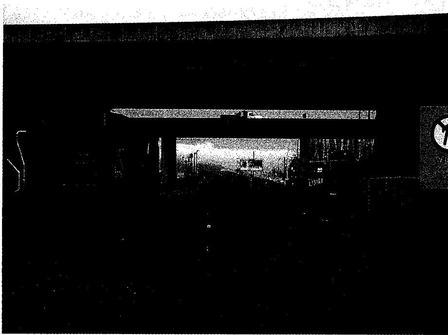
Fence Gap Looking southbound from the train platform