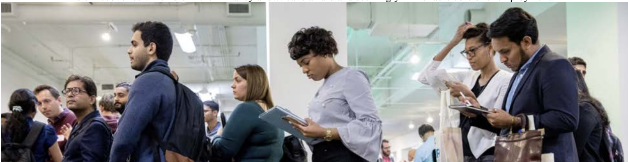
Job seekers and recruiters at a fair in Los Angeles. Economists have been surprised by the continued decline of unemployment.

The expansion is now the longest since records begin in the mid-1800s. It bears little resemblance to the 1930s, which Mr. Hansen described as "sick recoveries which die in their infancy and...leave a hard and seemingly immovable core of unemployment."