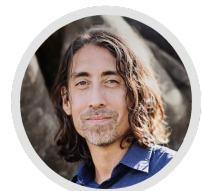
Sayer Ji Founder of GreenMedInfo.com

Easy Turmeric recipes + The Dark Side of Wheat