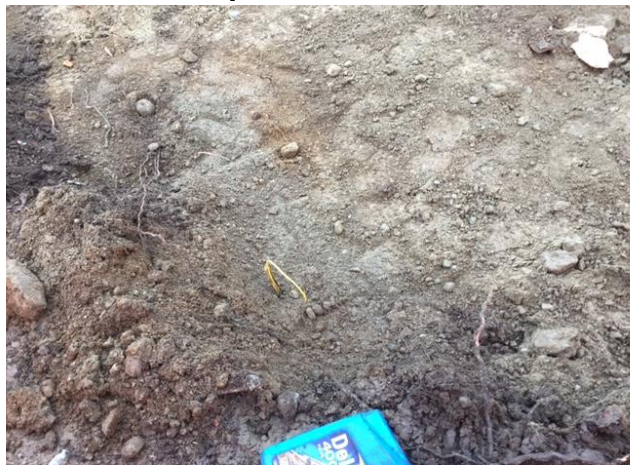
Gas Stub Marker that had been damaged and covered