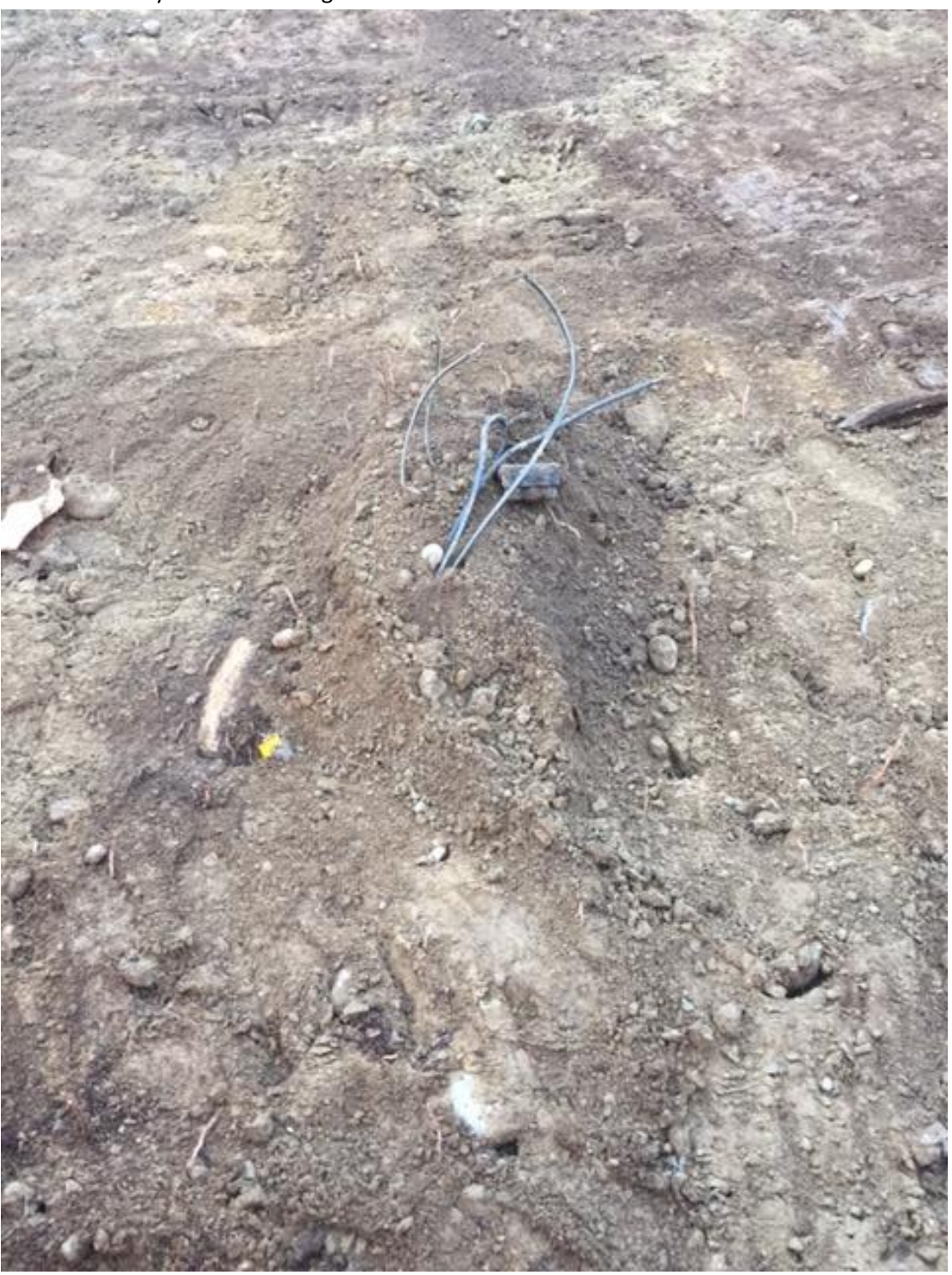
Electrical facility that was damaged.