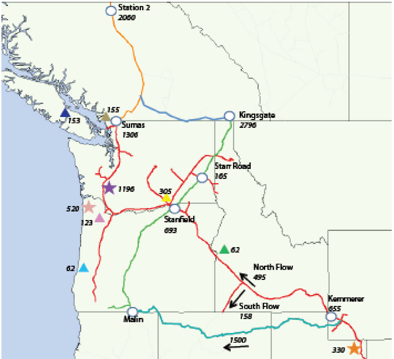
FIGURE C1. Pacific Northwest Infrastructure and Capacities