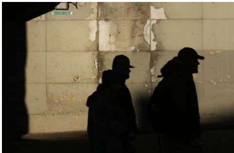
A chipped and damaged wall stands under a bridge in Brooklyn, N.Y. Anticipation of higher infrastructure spending is one factor supporting expectations of higher long-term Treasury yields.

Long-term Treasury yields have declined modestly, while short-term yields have risen