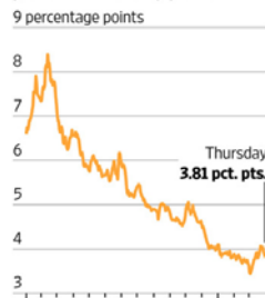
Sources: Ryan ALM (yield); Bloomberg Barclays (spread) THE WALL STREET JOURNAL.

Though sh began to label data in the markets, drawn by an improving global first quarter stock valuations, were mixed, STORY