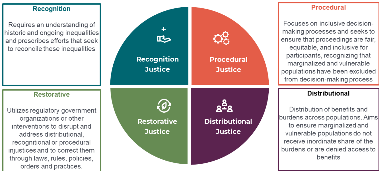
Figure 1.1 Core tenets of energy justice outlined by the Commission

CETA provided an opportunity for PSE to advance equity in clean energy transformation activities to ensure that all customers benefit from and participate in the clean energy transformation, and we are continually working on embedding equity considerations into resource planning. The Commission provided guidance regarding expectations for utility implementation of equity through its 2022 decision in the Cascade Natural Gas Corporation rate order, stating its commitment to “ensuring that systemic harm is reduced rather than perpetuated by its processes, practices, and procedures.” 3 Integral to this work is exploring the concept of energy justice and its core tenets, shown below in Figure 1.1.