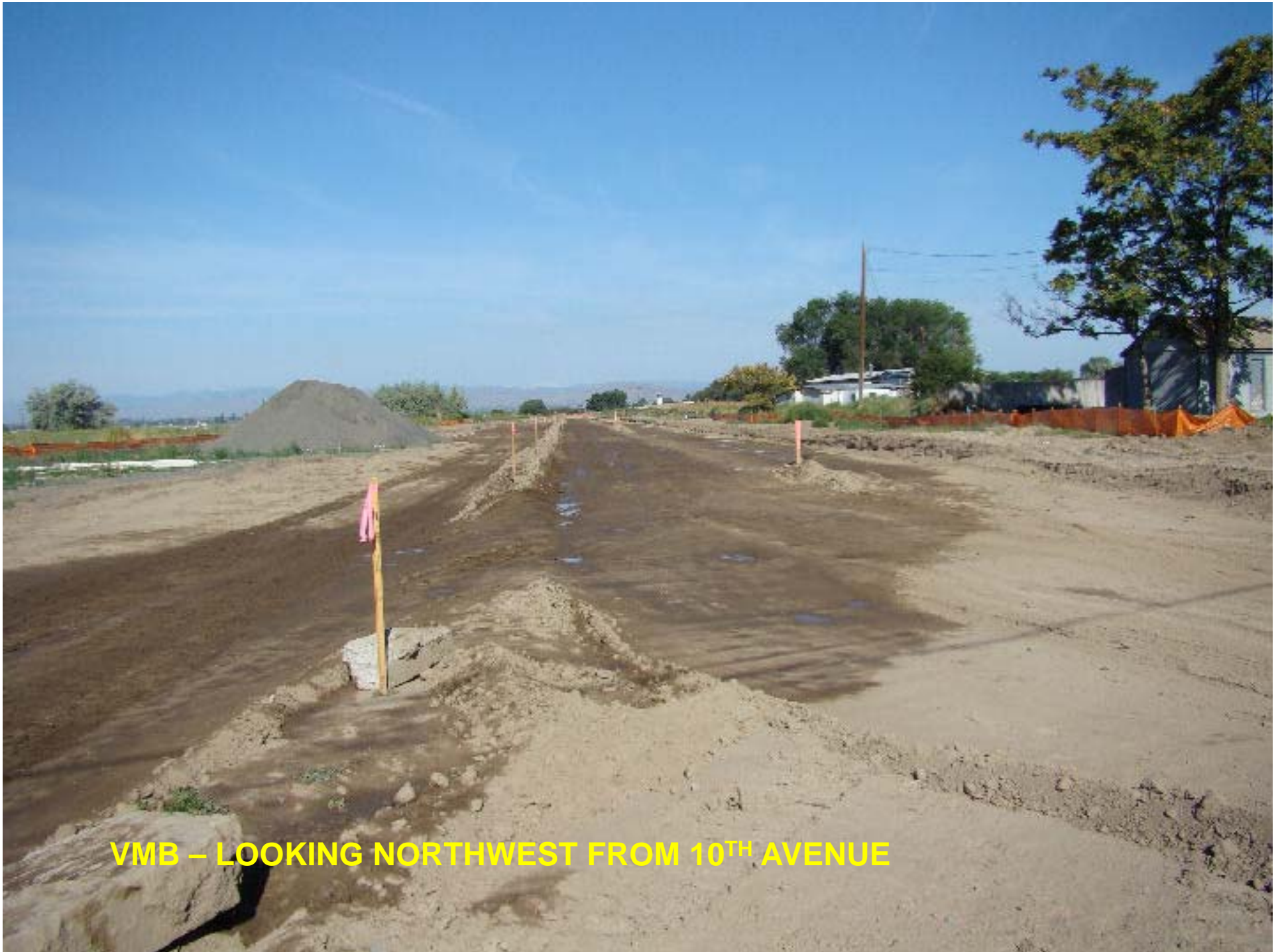
VMB – LOOKING NORTHWEST FROM 10 TH AVENUE