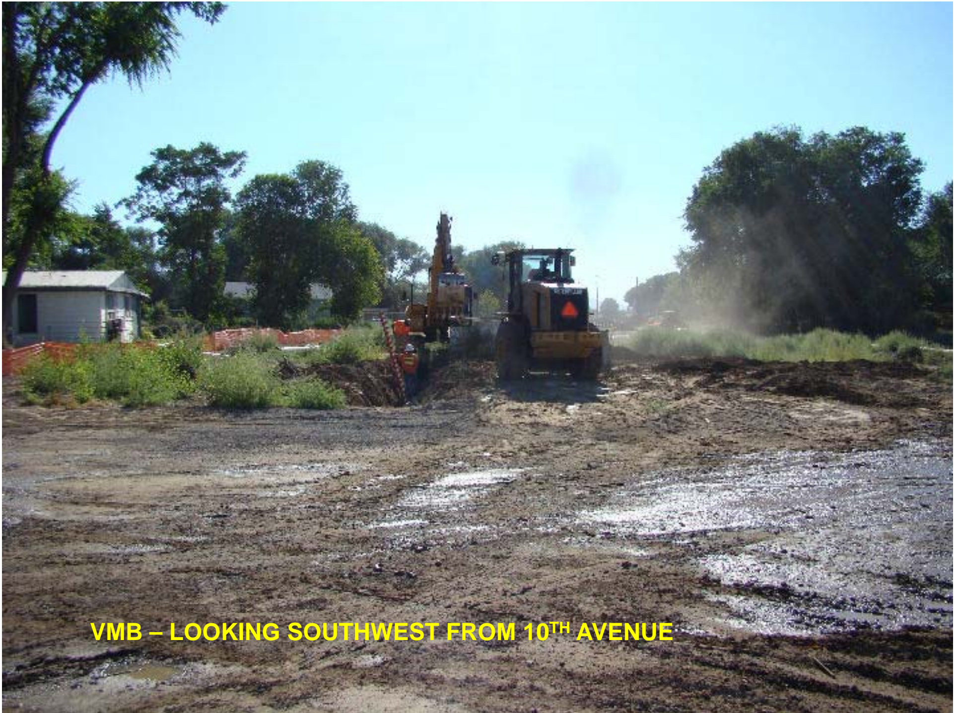
VMB – LOOKING SOUTHWEST FROM 10 TH AVENUE