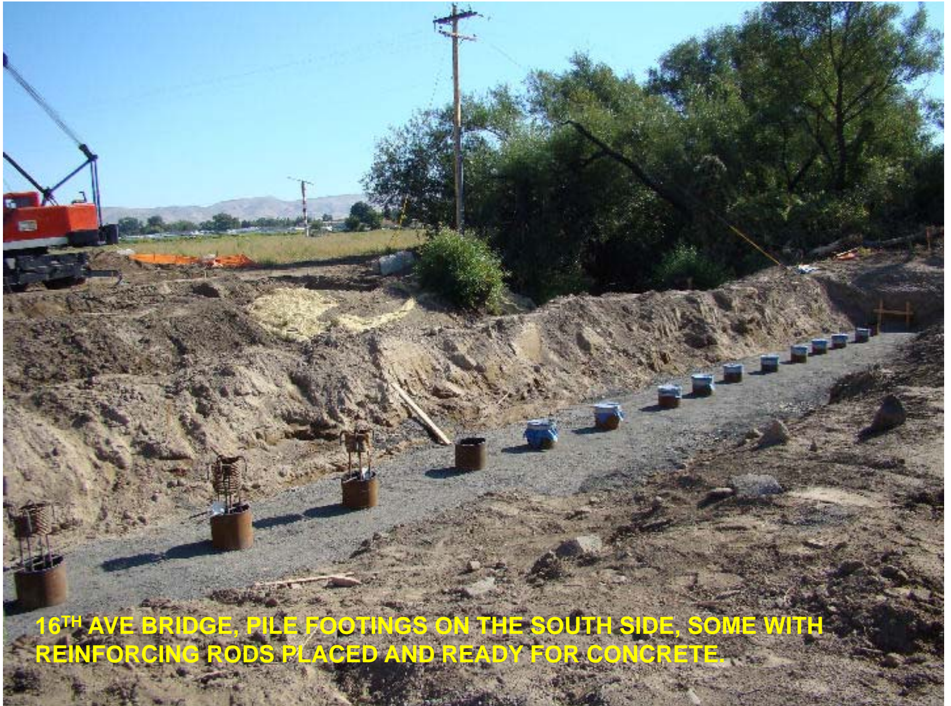
16 TH AVE BRIDGE, PILE FOOTINGS ON THE SOUTH SIDE, SOME WITH REINFORCING RODS PLACED AND READY FOR CONCRETE.