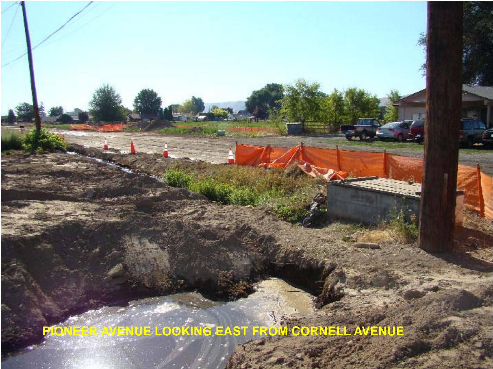
PIONEER AVENUE LOOKING EAST FROM CORNELL AVENUE