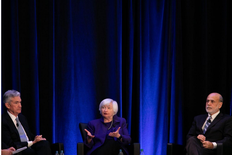
Fed Chairman Jerome Powell and former chairmen Janet Yellen and Ben Bernanke. The financial crisis was followed by a stretch of free money unseen since the 1940s.

How could economists have gotten something so basic so spectacularly wrong? What was it about this past decade that made all their predictions go awry?