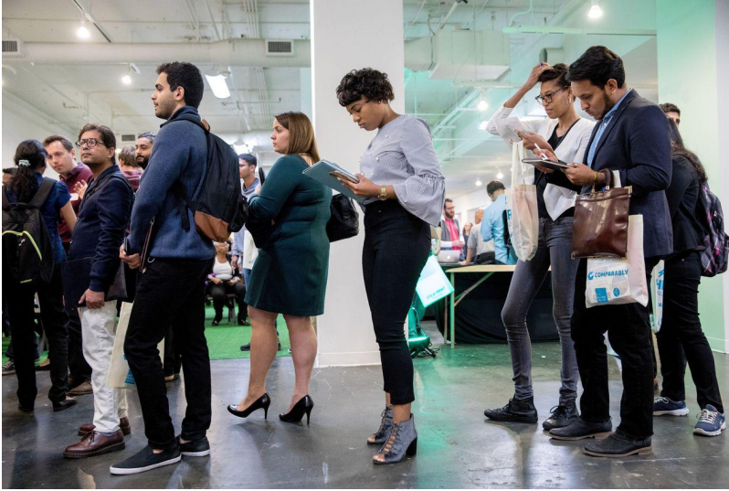
Job seekers and recruiters at a fair in Los Angeles. Economists have been surprised by the continued decline of unemployment.