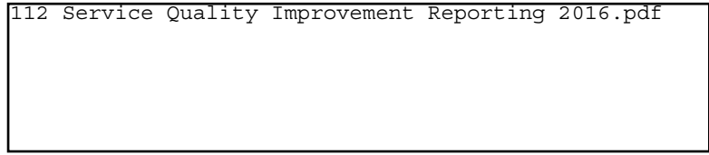
Name of Attached Document

<112> Attach Five-Year Service Quality Improvement Plan or, in subsequent years, your annual progress report filed pursuant to 47 C.F.R. § 54.313(a)(1). If your company is a CETC which only receives frozen support, your progress report is only required to address voice telephony service.