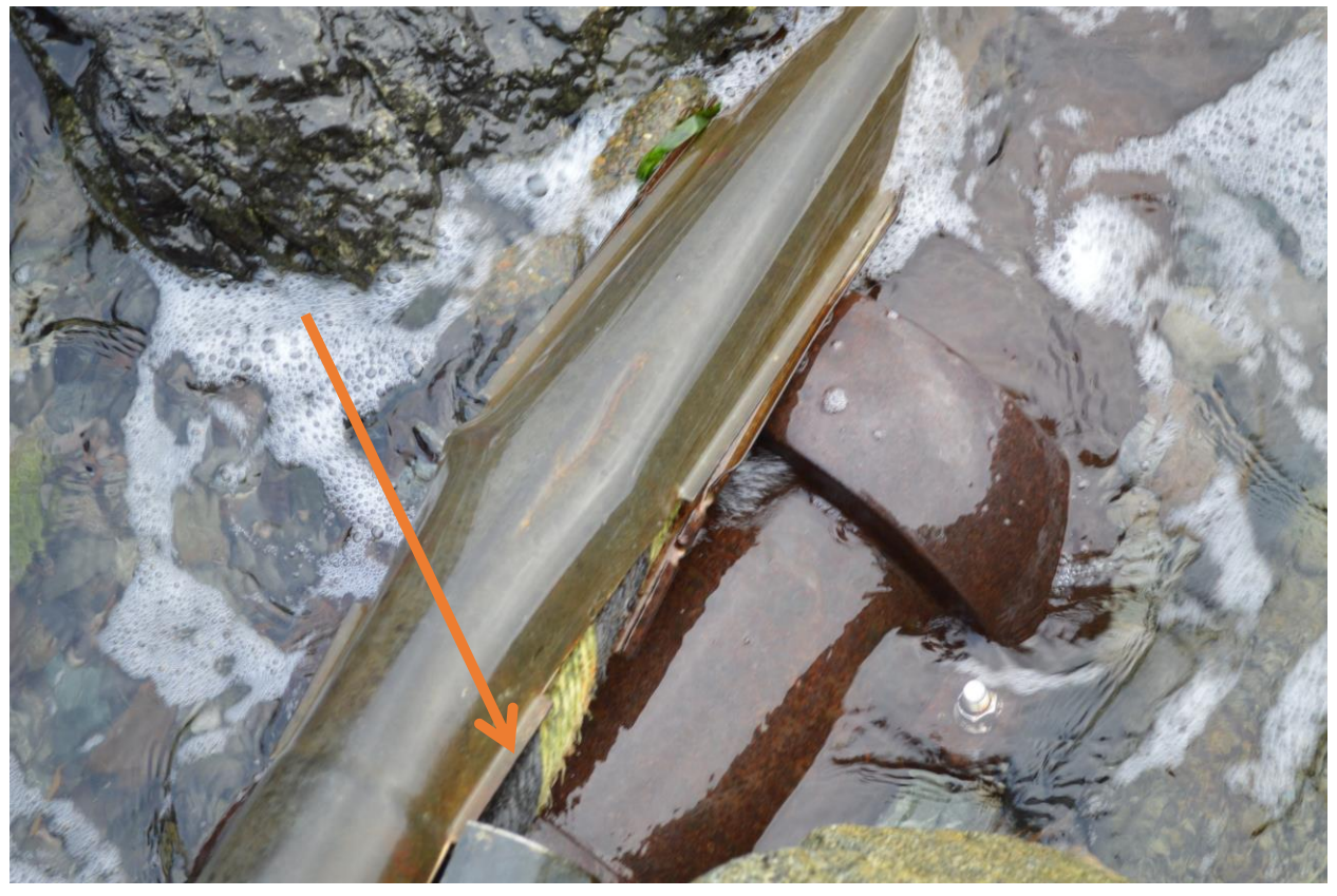
Exhibit 4 CenturyLink Fiber Optic Cable Exposed 2