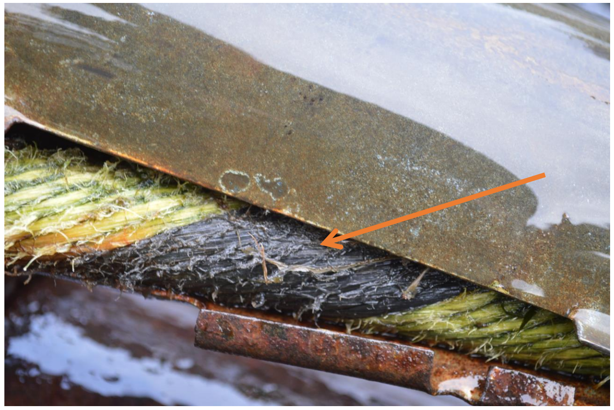
Exhibit 6 CenturyLink Fiber Optic Cable Conduit Collapse and Crossing Over Electric Cable 1