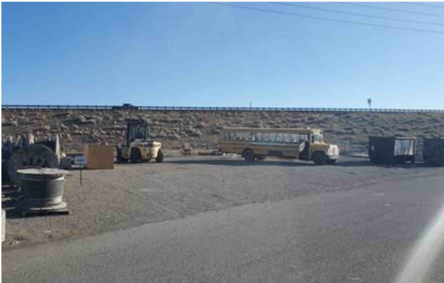
Clear by 2/10/21