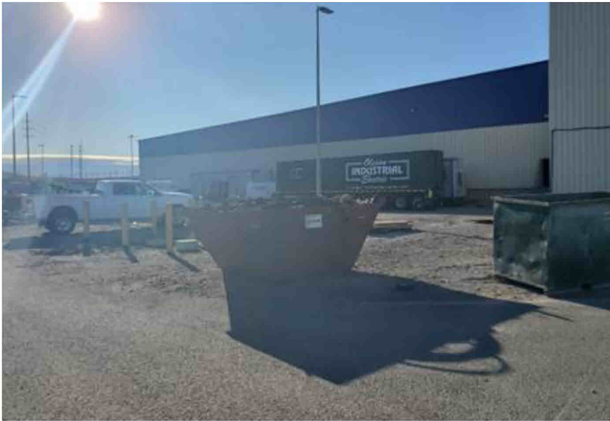
Clear by 2/10/21