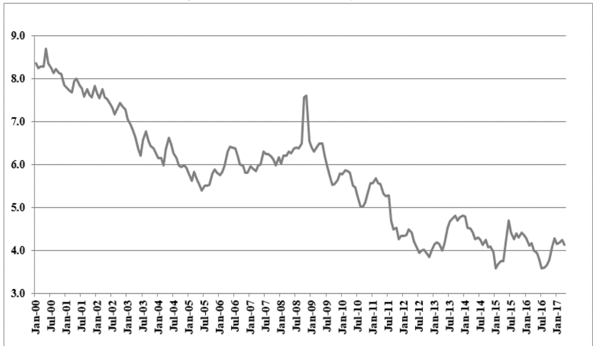
Exhibit JRW--9 Long-Term 'A' Rated Public Utility Bonds