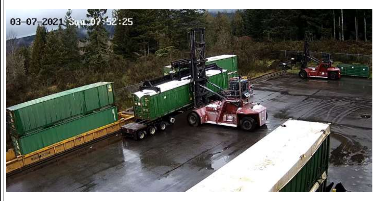
6.8 The photographs below show a closed intermodal container of OCC Rejects from PTP being offloaded from the truck to the UPRR train at NMF's rail spur, bound for WMDSO's Columbia Ridge Landfill in Oregon.