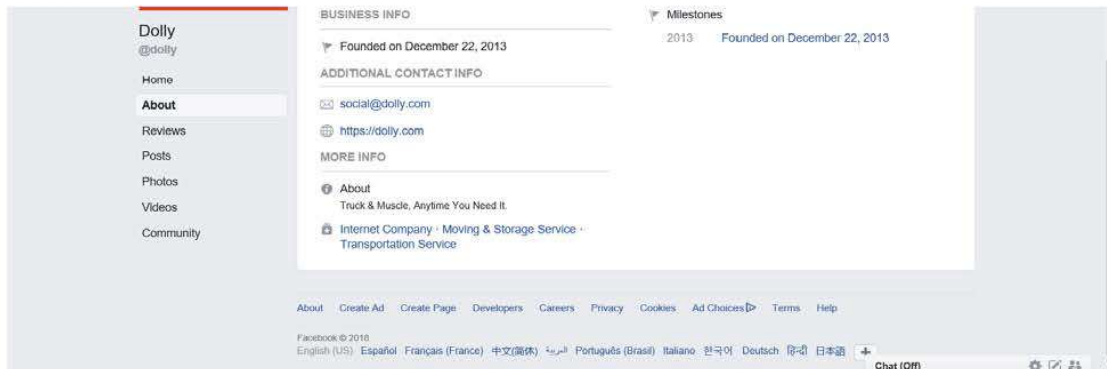
Dolly Facebook search and Facebook About Page, printed on June 18, 2018