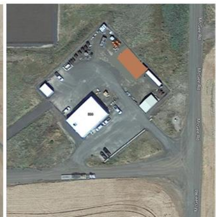
Marengo 1 and 2 near Dayton, WA