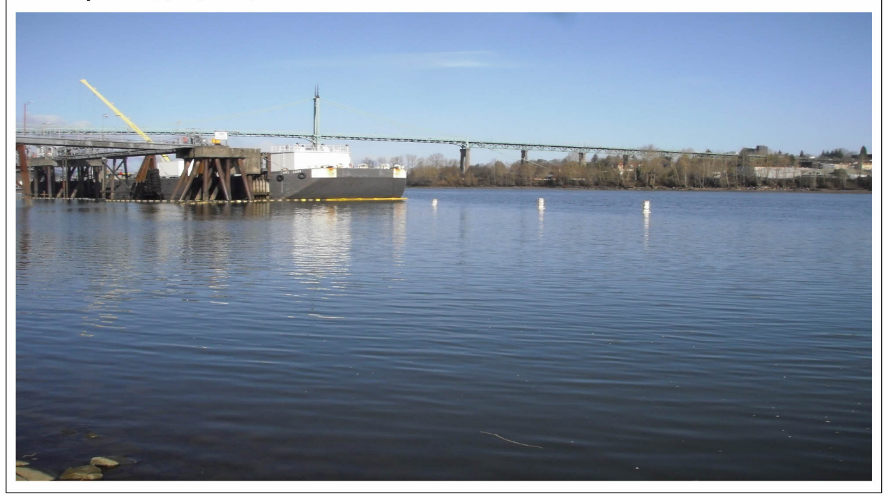
Photo 2 Mat Material Visible but Underwater at the Mid-Point of the Cap Area (2/17/2020)

PacTerm Oil Boom Placement Around Moored Barge with Three Mariner Warning Buoys at Pilot Cap Area (2/17/2020)