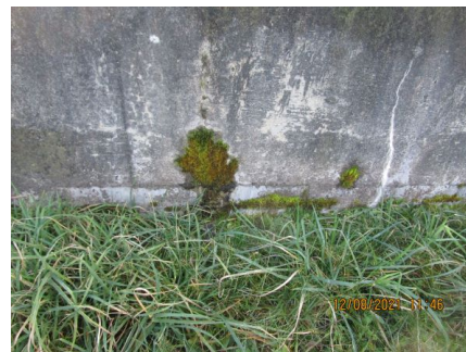
North Side Large Storage Tank