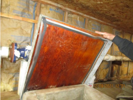
Large Storage Tank Hatch Gasket