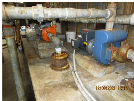
Booster Pumps for Small Storage Tank