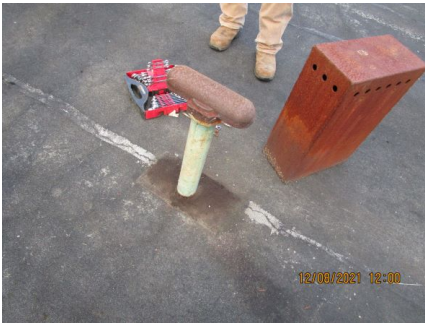
Large Storage Tank Vent