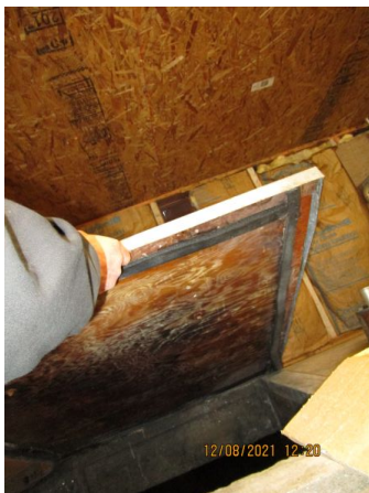
Small Storage Tank Hatch Gasket