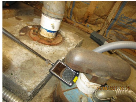
Small Storage Tank Vent