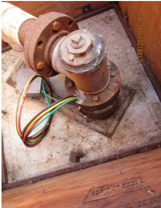
Well 1 With Sealed Wires