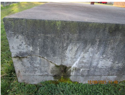
North Side Large Storage Tank