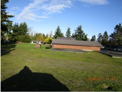
Water Facilities Site