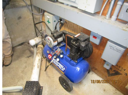
Oilless Air Compressor for Pressure Tanks