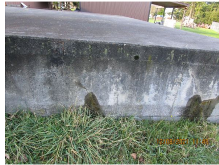
East Side Large Storage Tank