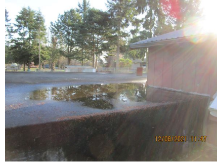
Large Storage Tank - Ponding