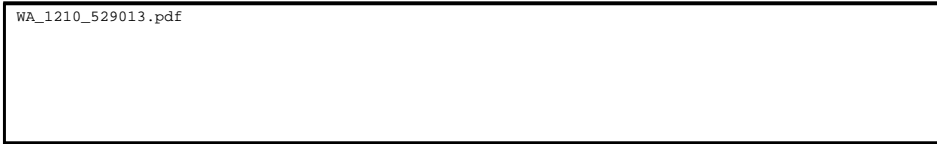
Name of Attached Document

<1210> Terms & Conditions of Voice Telephony Lifeline Plans