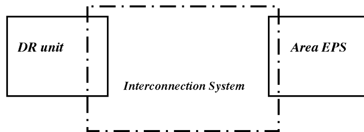
Figure 2—Schematic of interconnection

3.1.8 interconnection equipment: Individual or multiple devices used in an interconnection system.