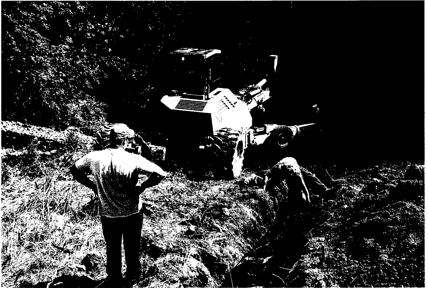
View: Looking down slope. The contractor's crew was working on the geotextile fabric before the trench is covered with approximately 1 foot of soil backfill material.