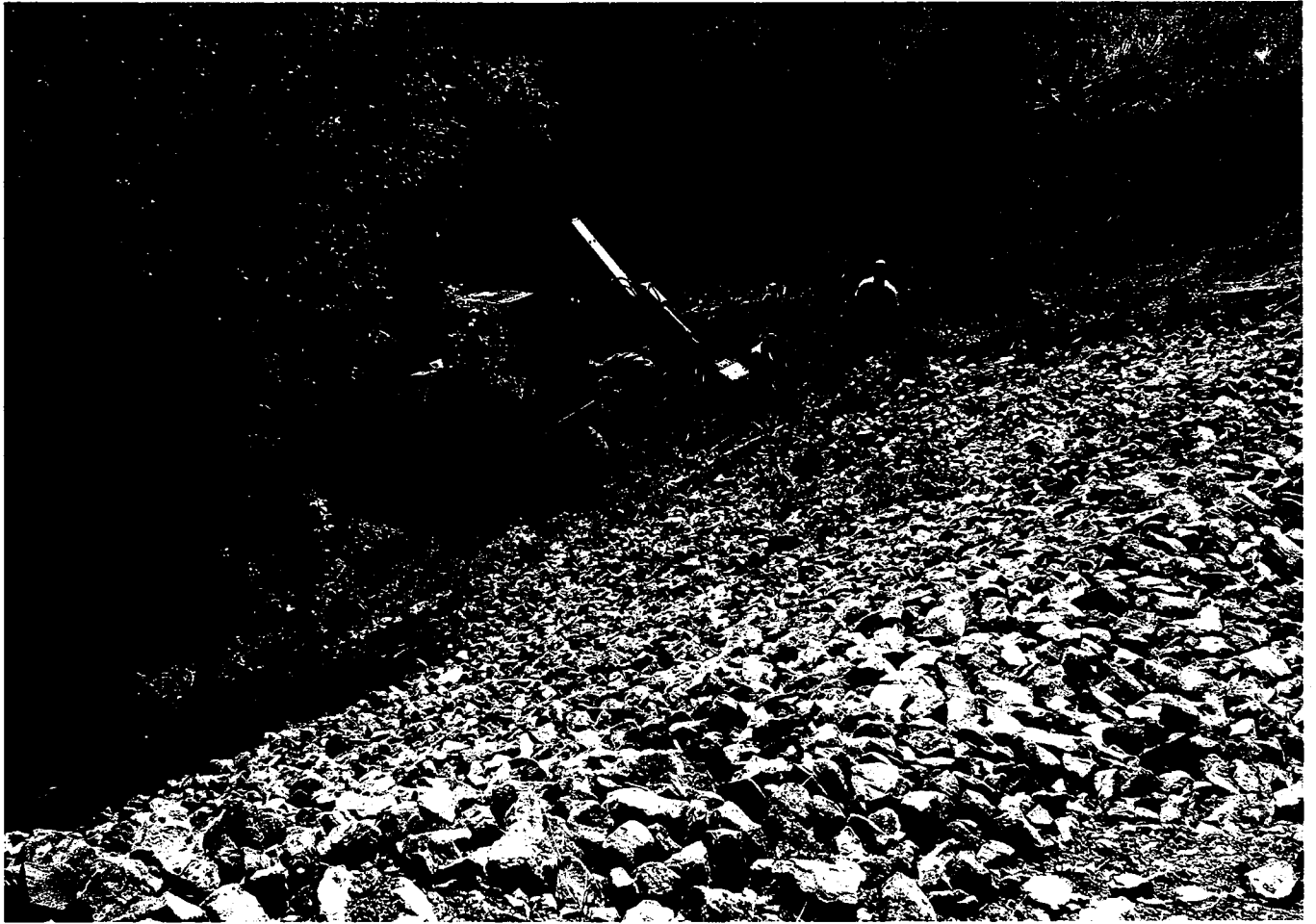
View: Looking down slope (approximately 60-degrees).