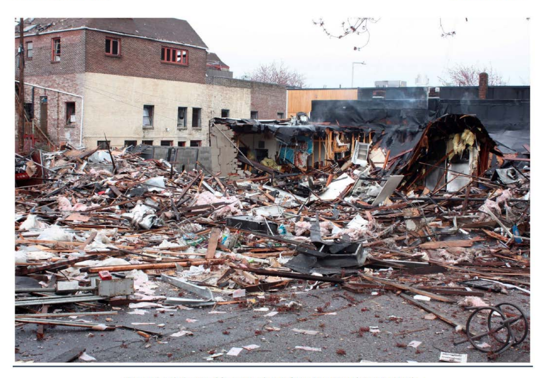
Image 4. Debris spread facing northwest from Greenwood Avenue North.

Staff Investigation Report Docket PG-160924