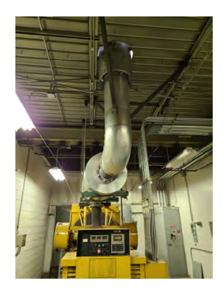
Existing UPS System