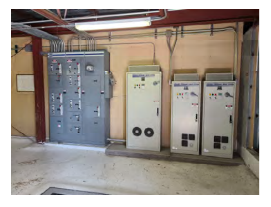
Existing MV Equipment