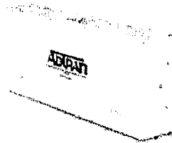
TA 750 DC BATT BACK-UP SYS