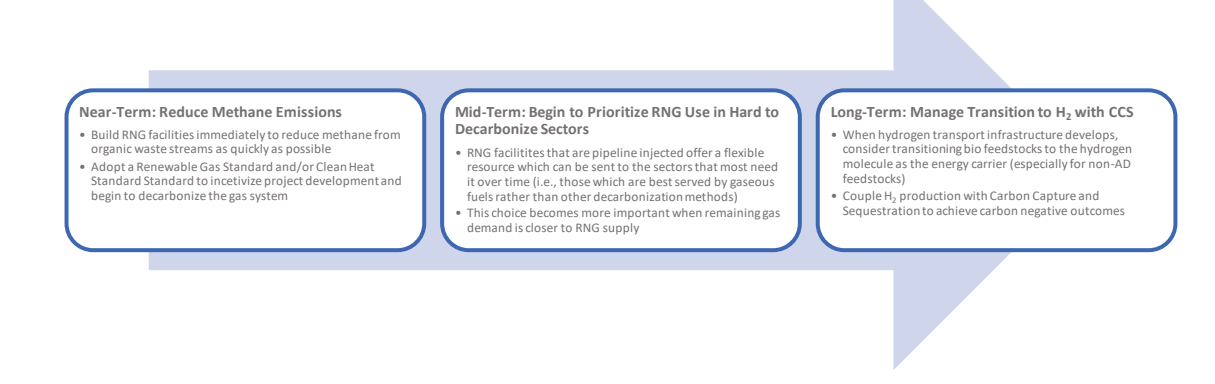
Figure 1. Priorities for RNG Deployment Will Likely (and Should) Shift Over Time

Further, many long-term studies of decarbonization agree that the use of renewable gases is essential but disagree about which sector will most need RNG to decarbonize in the long run.<sup>8</sup> Because of these facts, in these comments we attempt to articulate a nimble vision of how RNG in Washington can best help with decarbonization in the near-, mid-, and long-terms as shown in Figure 1.