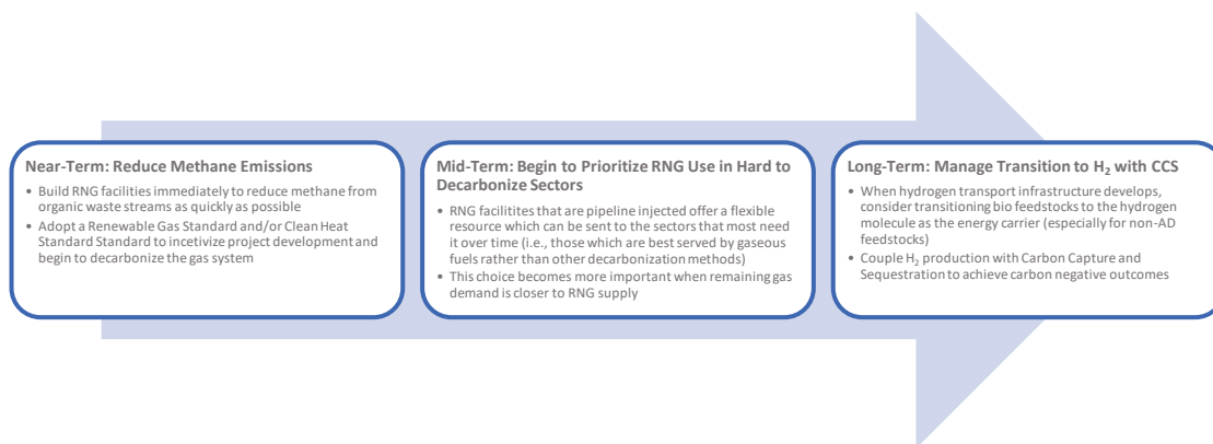
Figure 1. Priorities for RNG Deployment Will Likely (and Should) Shift Over Time

Further, many long-term studies of decarbonization agree that the use of renewable gases is essential but disagree about which sector will most need RNG to decarbonize in the long run. 8 Because of these facts, in these comments we attempt to articulate a nimble vision of how RNG in Washington can best help with decarbonization in the near-, mid-, and long-terms as shown in Figure 1.